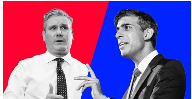
KEIR STARMER: LABOUR (LEFT) RISHI SUNAK: CONSERVATIVE (RIGHT)

-C: I think a lot of people are dissuaded from being interested in politics... maybe from the behaviour of the politicians.