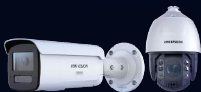
2/3/7 Line IP Camera and PTZ Camera with AcuSearch