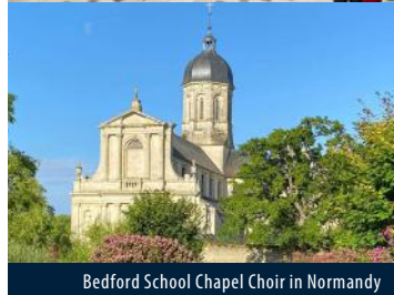
Bedford School Chapel Choir in Normandy