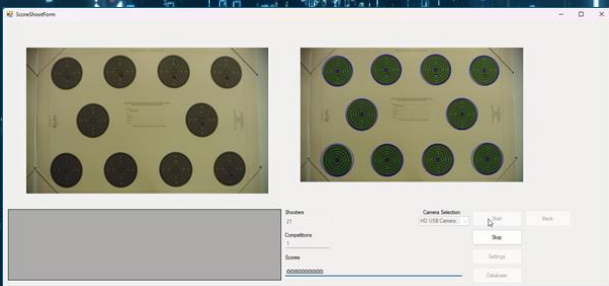
Toby Mitchell's (Upper Sixth) Scoring System

Using knowledge and skills gained in lessons to solve a practical problem is a key element of the A-Level Computer Science assessment. The results produced by the boys are always impressive, and this last year was no exception.