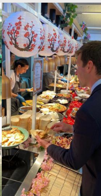
Top left: Boarders' games, bottom left, Laser Tag, Above: Taste the World