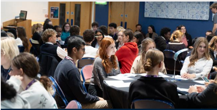
Ready2Lead? 2023 Annual Conference

Bedford School groups showcased their ideas of an awareness raising photography project, a redesigned recycling bin that allowed users to vote on current issues and a resource pack to support primary aged children to make the most of Bedford's green spaces.