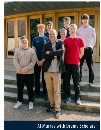
Al Murray with Drama Scholars

The workshop also delved into the psychology around comedy and the core principles of stand-up, for example running jokes, the rule of three and word play. Al advised that if the boys were able to practise and master these, then they too will be able to deliver stand-up.