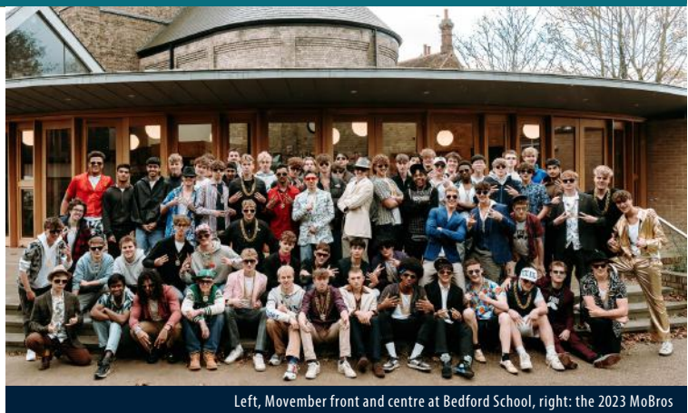
Left, Movember front and centre at Bedford School, right: the 2023 MoBros