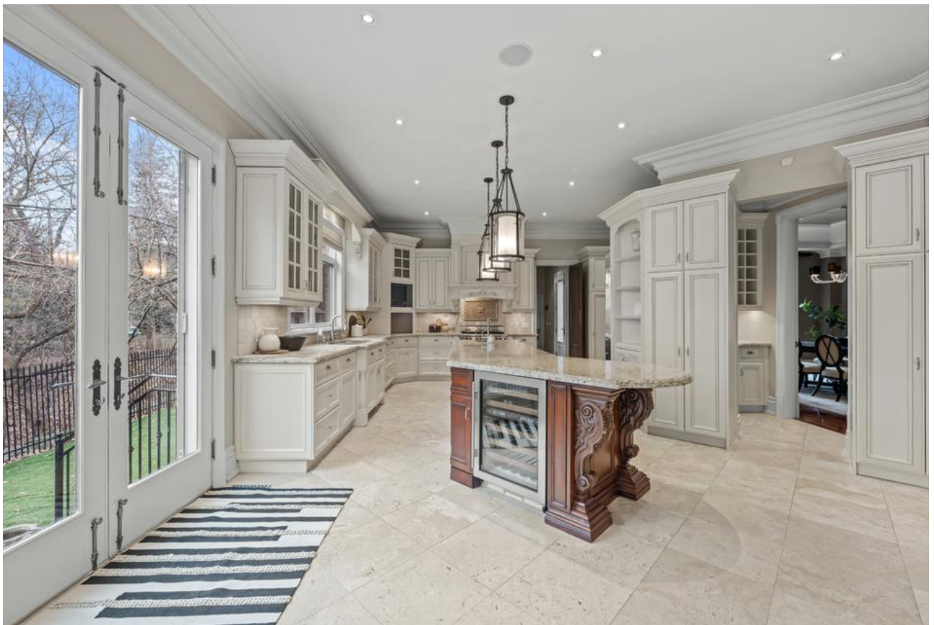
55 VALECREST DRIVE