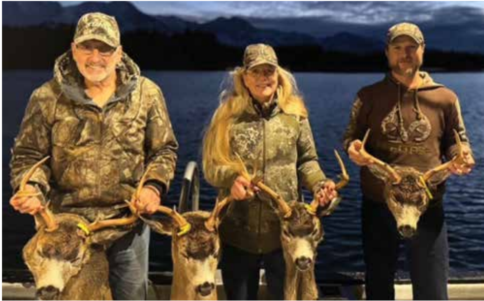
Serenity offers a 5-day Alaska boat-based Sitka blacktail hunt for four hunters on Wednesday evening's auction.