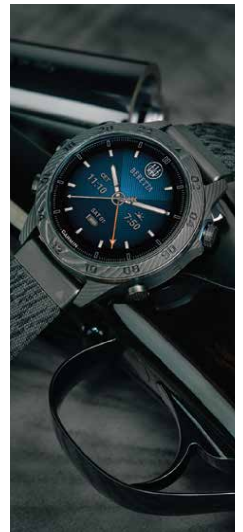
The Garmin MARQ Commander (Gen 2) Beretta Edition is on display at Beretta's Convention booth. The watch is limited to 500 individually crafted watches and represents the meeting of two brands defined by precision, performance and legacy.

SCI attendees can explore the newest commercial firearms and accessories introduced earlier this year, fresh from the SHOT Show. A selection of firearms, as well as clothing and accessories, will