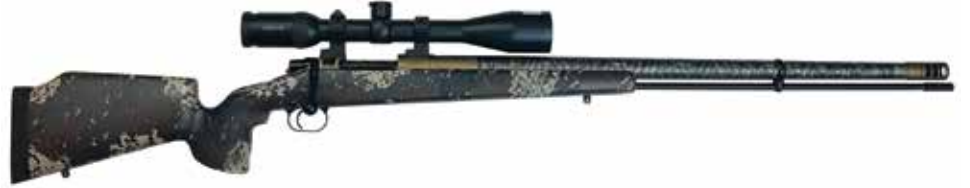
Swarovski Optik, Nightforce and Leupold scope packages are available from Arrowhead. A key highlight at SCI is its turnkey rifle-and-optic packages — professionally mounted, leveled and field-ready.

The forum is 2:30 to 4 p.m. in Room 202B of the Music City Center.