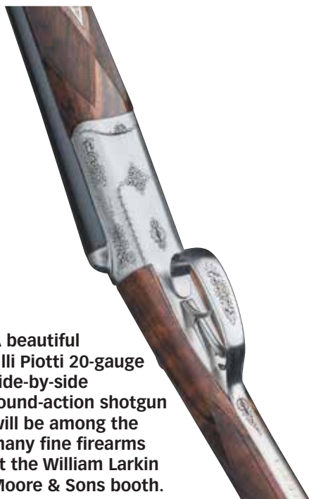
A beautiful Flli Piotti 20-gauge side-by-side round-action shotgun will be among the many fine firearms at the William Larkin Moore & Sons booth.

For more information, stop by booth 1209 or email info@wlmsons.com .