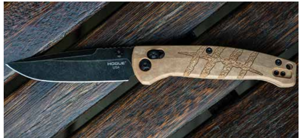
The Hogue Knives' new Mysto Wood everyday carry drop point is a quality field-dressing and skinning knife at a competitive price.

For more information, visit booth 805 or arrowheadrifles.com .