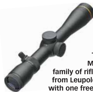
The new Mark 4HD family of riflescopes from Leupold comes with one free custom elevation dial and many magnification and reticle options.

The five magnification ranges available include: 1-4.5x24, 2.5-10x42, 4.5-18x52, 6-24x52 and 8-32x56. The 1-4.5x24 and 2.5-10x42 models feature 30mm tubes. All 1-4.5x24 models are second focal plane, while the 2.5-10x42 model is available in first or second fo-