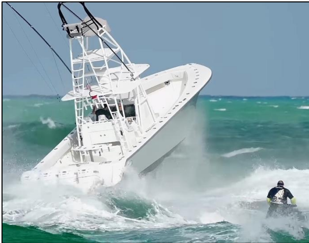
Haulover Inlet with small and large craft