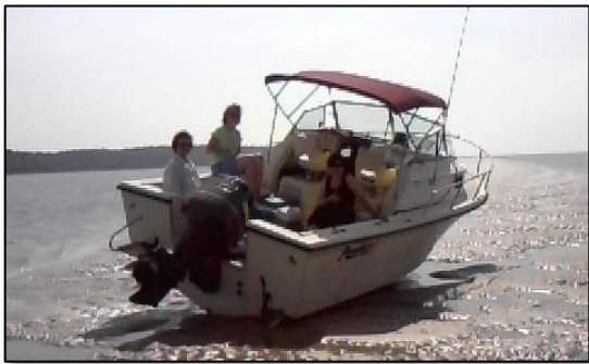
Running aground near Beaufort

What the heck. If you are not boating, you are not having fun. This is just part of the experience.