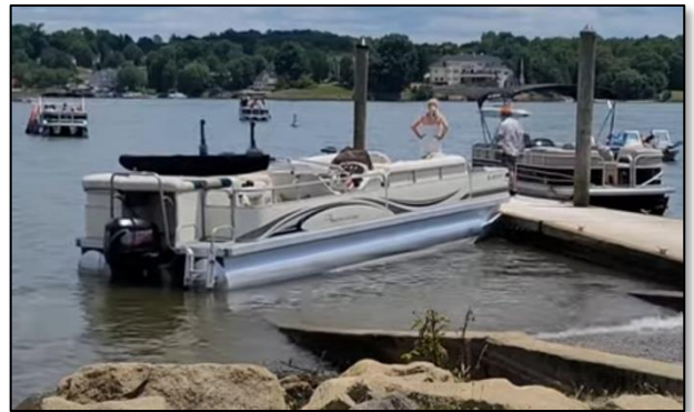
Boat motor being "eaten" by the boat ramp concrete

This ramp area is also very busy and with waves from boat wake and wind from the main Lake Wylie area.