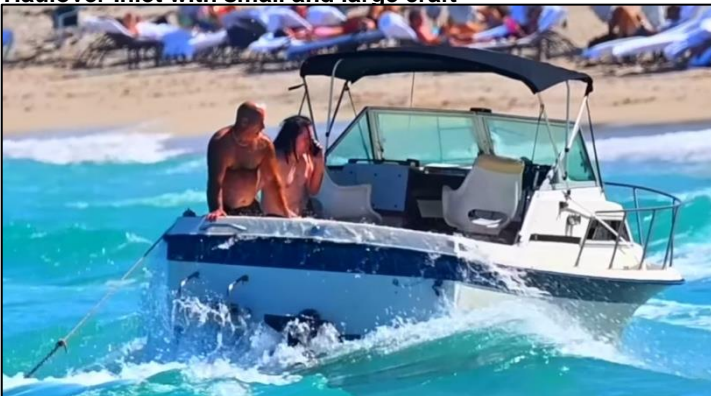
Anchoring from the stern is not recommended. This boat lost power. Their anchoring system is not sufficient to keep this boat off the beach.