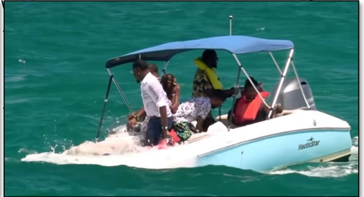
Overloading and low bow. In the right photo, some passengers were removed from the swamped boat by Good Samaritans.