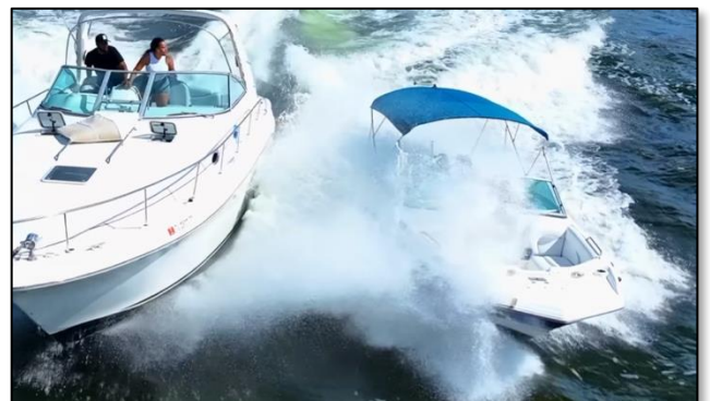
Keep a good lookout. The cruiser made a last-minute turn to avoid hitting the boat.