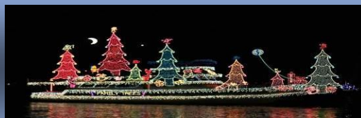
Ship shape holidays