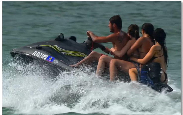
PWC overloaded, and no Personal Flotation Devices being worn as required