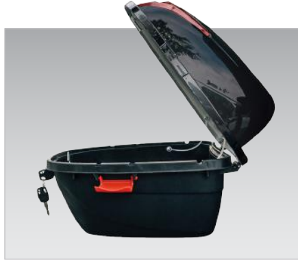
Lockable storage pod