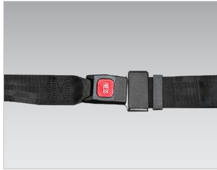
50/60/70" lap belt