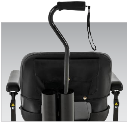
3" single or double cane/crutch holder