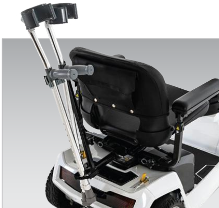
Forearm crutch holder