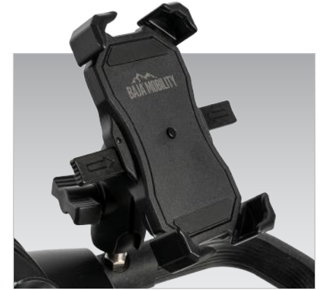
Cell phone holder