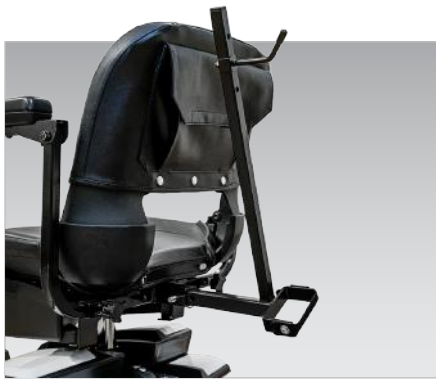
Wishbone crutch holder