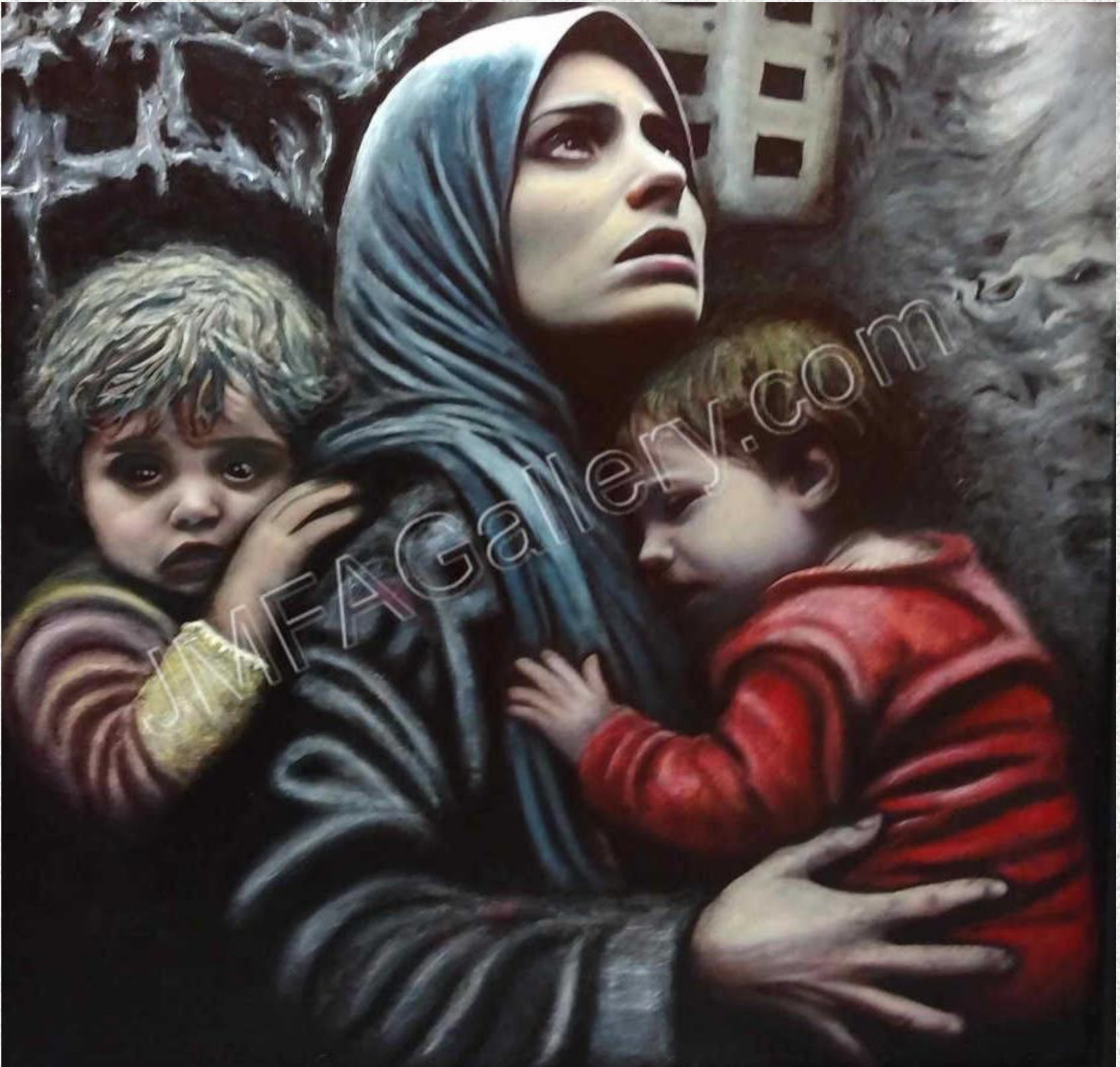
Victims of Conflict - The Innocent 30W"x30H"x1"D oil on canvas, 2024