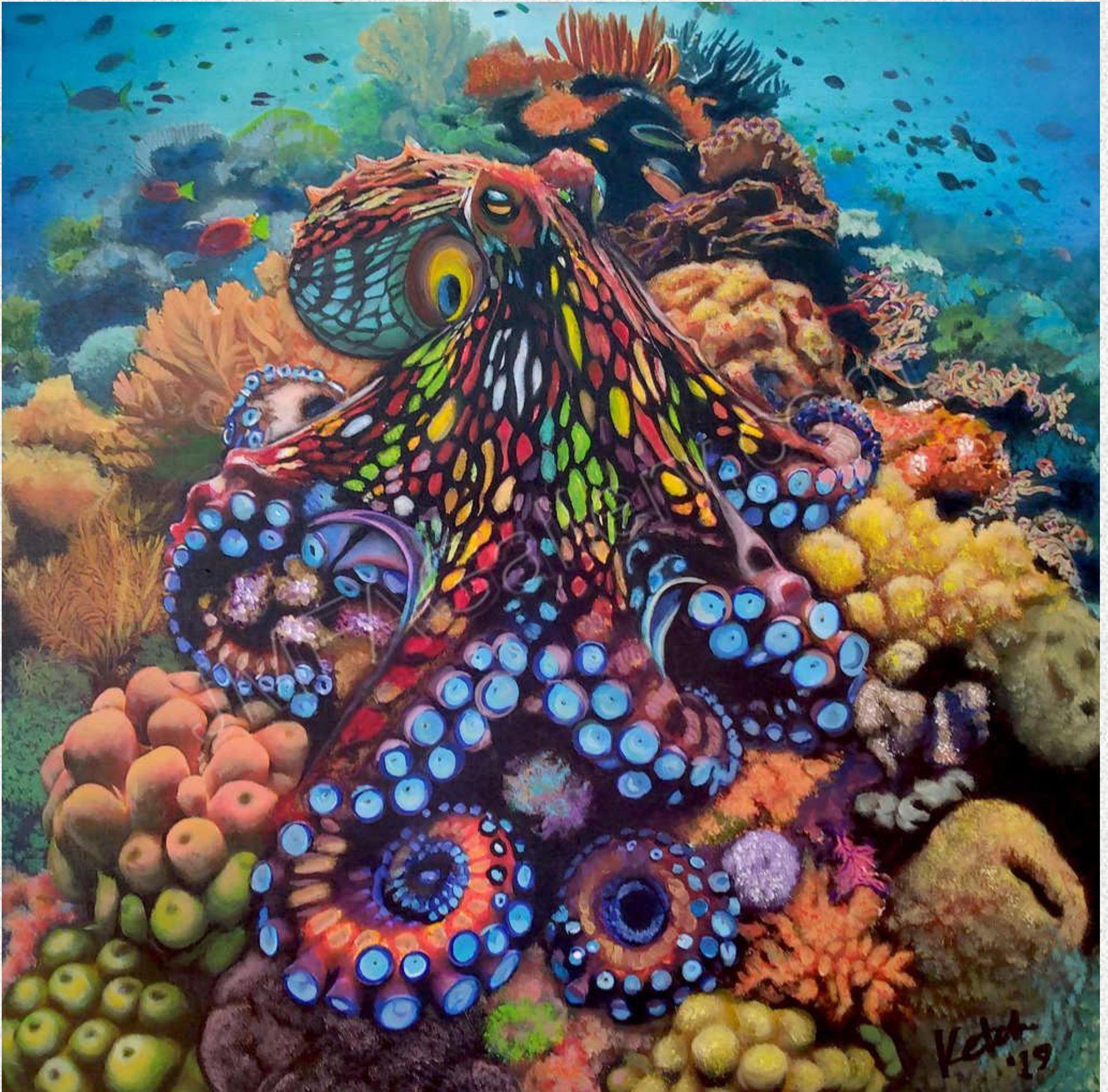
Octopus 30W"x30H"x1"D oil on canvas, 2023