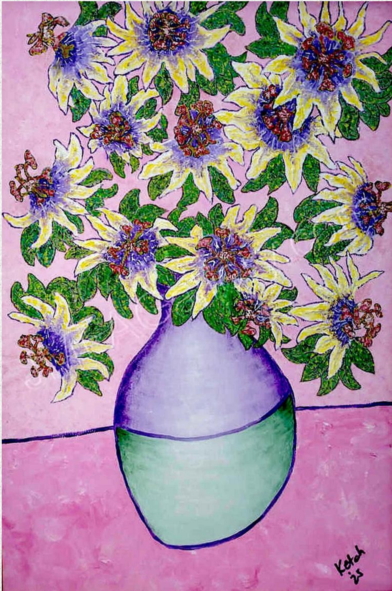
Lilikoi Vine 24W"x36H"x1"D oil on canvas, 2025