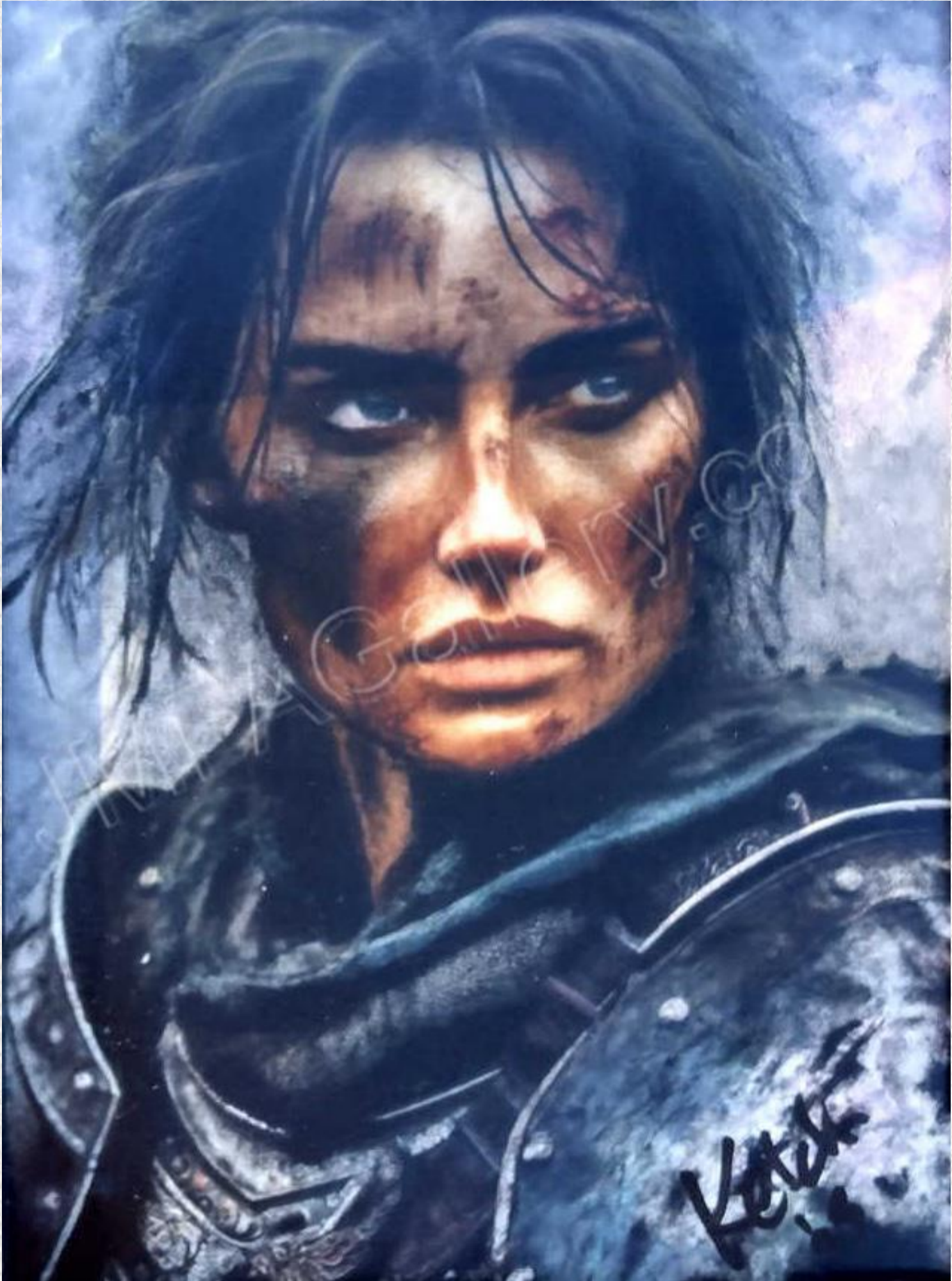
Joan d'Arc 16W"x20H"x1"D oil on canvas, 2024

Ketch's studies in France deepened my historical appreciation for the enduring struggle of the French people in their pursuit of freedom from oppression, greed, and the dominance of a foreign power. Inspired by this spirit, my oil-on-canvas portrayal of Joan of Arc captures not only her unwavering courage and strength of character but also her timeless beauty. This painting serves as a tribute to her legacy, preserving her resilience and determination for generations to come.