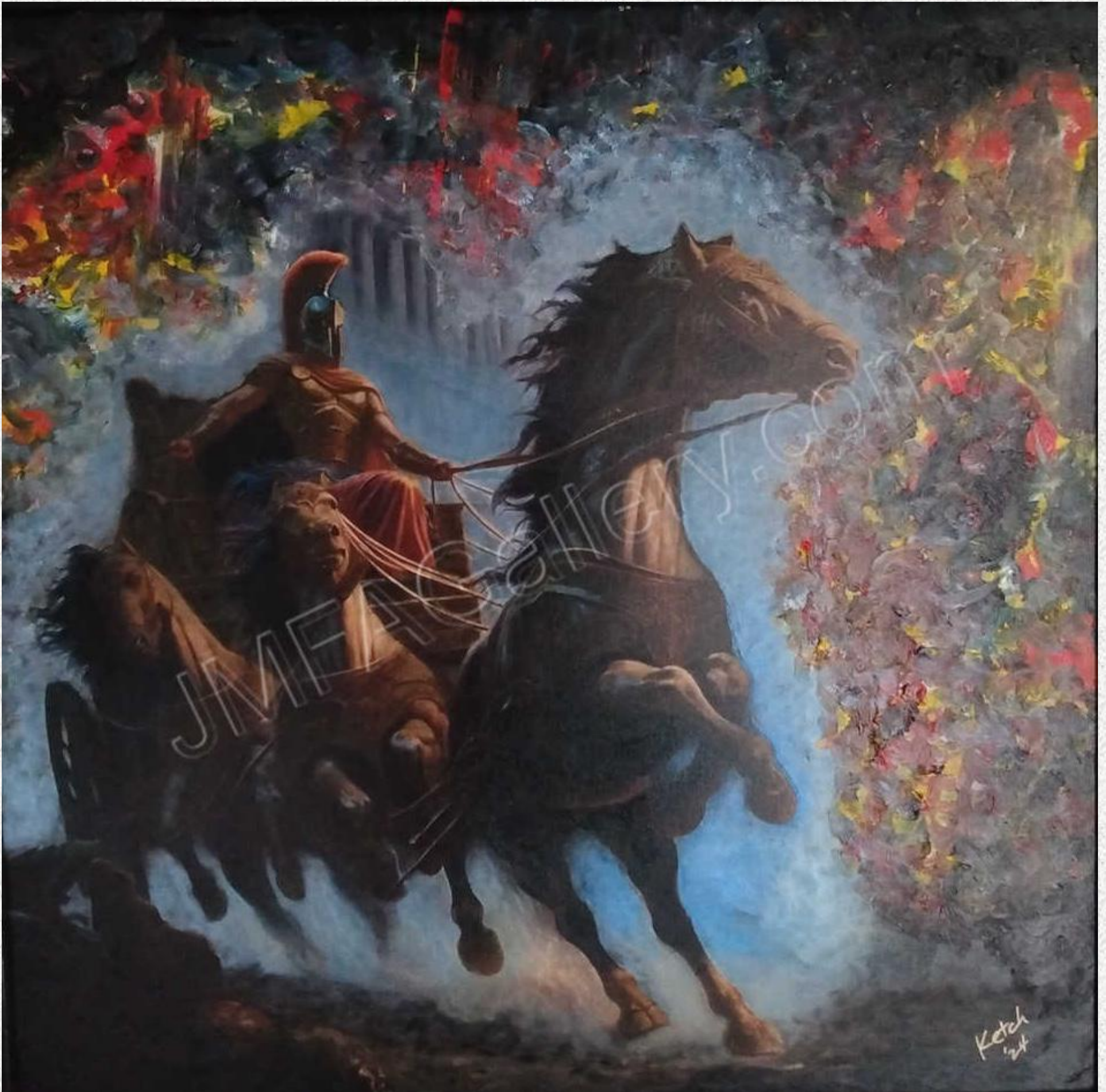
Victims of Conflict - Civilization 30W"x30H"x1"D oil on canvas, 2024