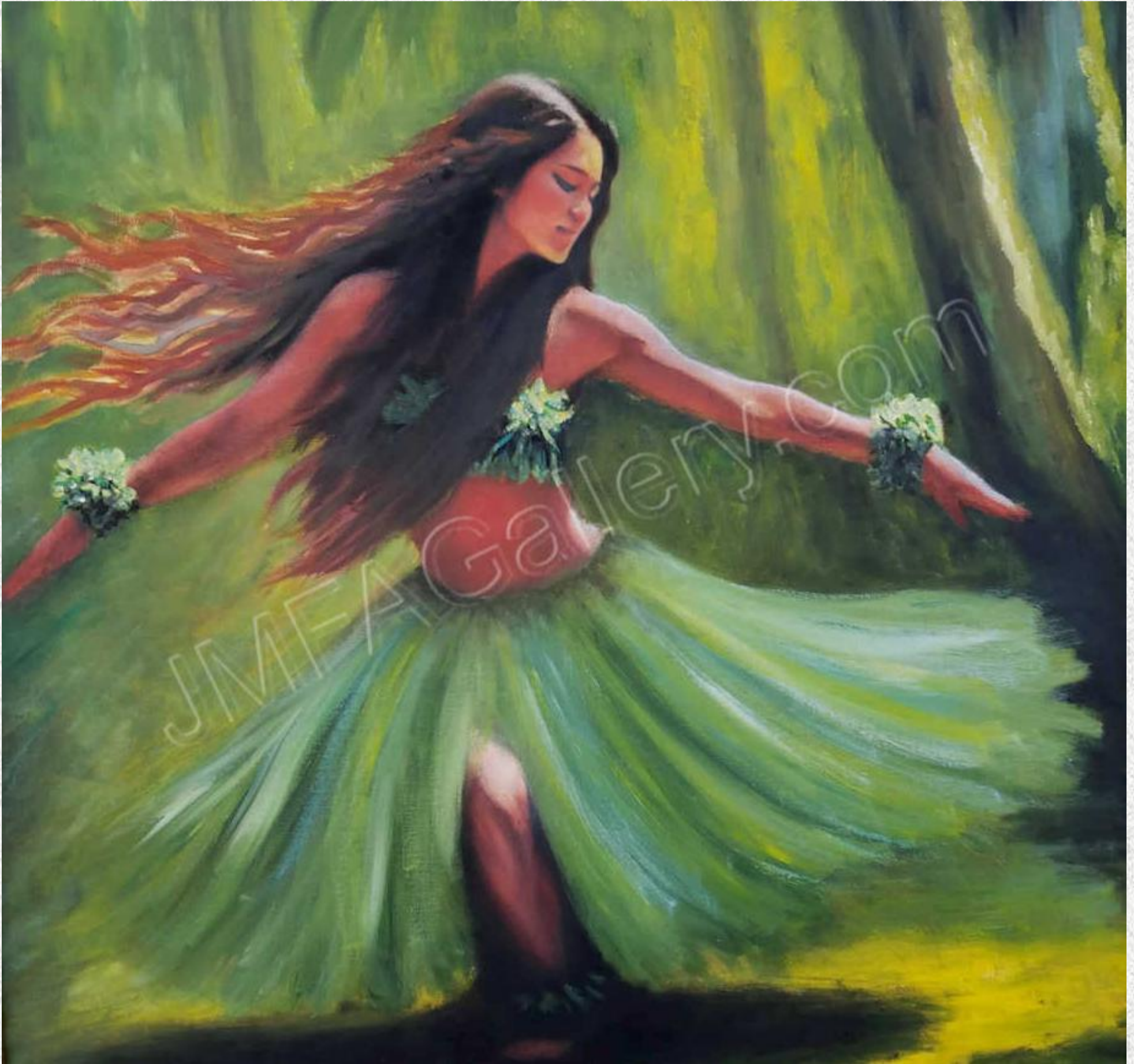
Na Wahine 30W"x30H"x1"D oil on canvas, 2024