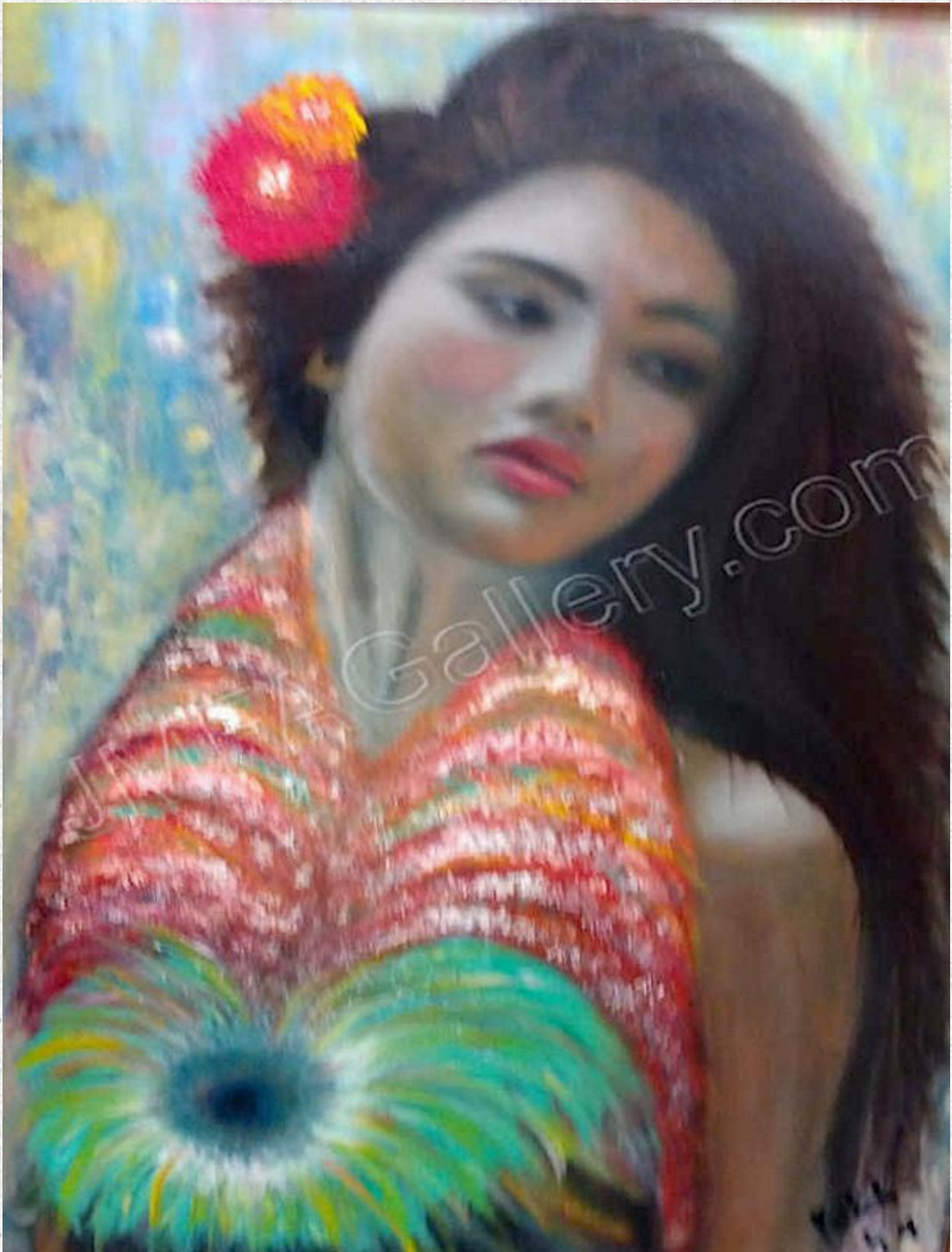
Femme Tahitienne 24W"x36H"x1"D oil on canvas, 2024

In this oil-on-canvas painting, Femme Tahitienne , Ketch captures the beauty and allure of the women of French Polynesia, inspired by his many visits to these enchanting islands. Their unique blend of French and Polynesian heritage, combined with the warmth and spirit of their island home, is reflected in this piece. Through expressive brushstrokes and vibrant tones, he seeks to convey the elegance, strength, and mystique that define the women of Tahiti.