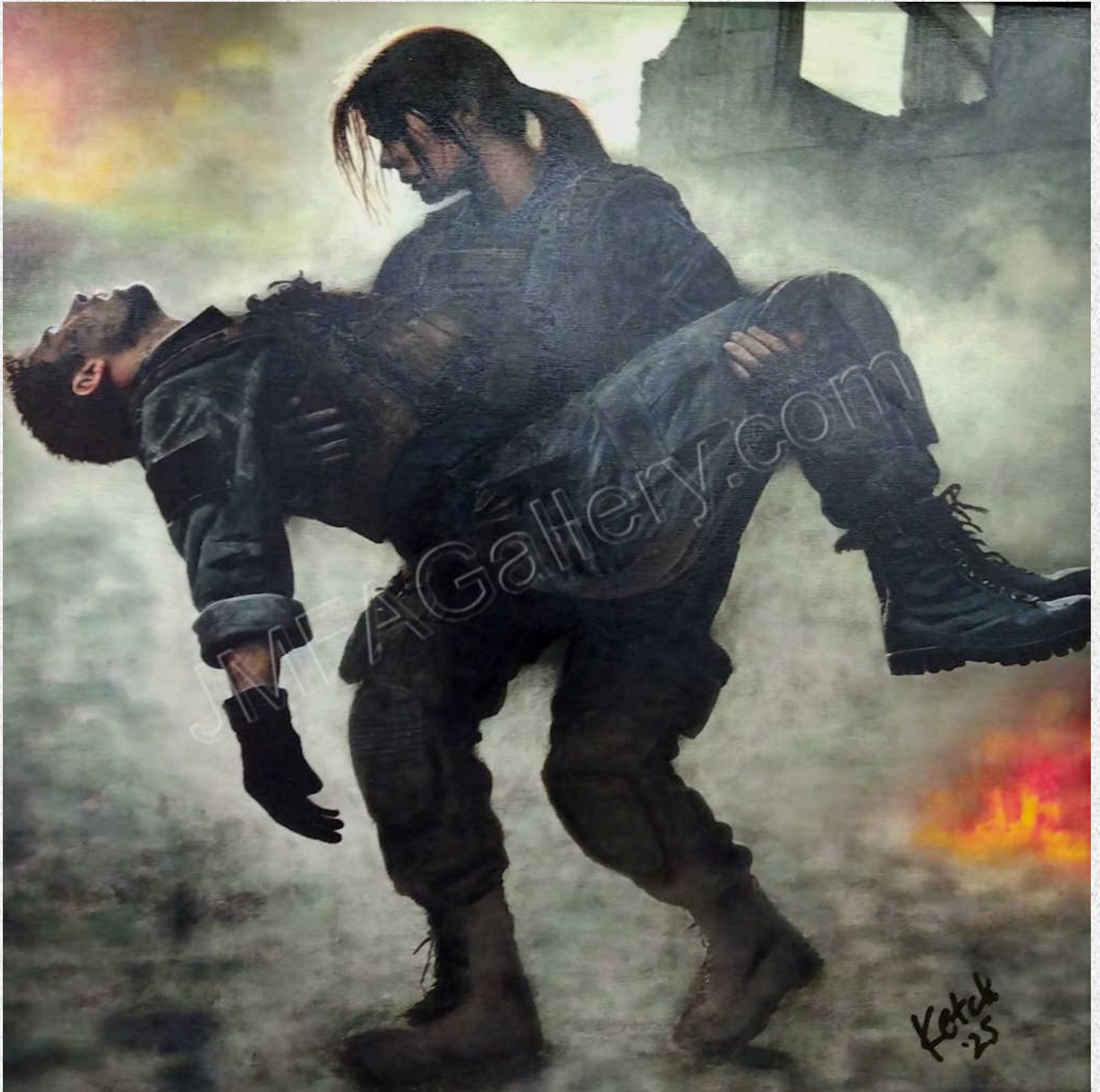
Victims of Conflict - The Warriors 30W"x30H"x1"D oil on canvas, 2025

The third panel depicts the individual cost of war. A young soldier, his boots and gloves brand new, has just arrived at the front. A female soldier whose tattered clothing and worn boots tell the story of long battles fought. The man has suffered a mortal wound—his life cut short before it even began, symbolized by the only worn part of his uniform: the bottom of his pants. She carries his lifeless body from the battlefield, a burden she will bear for the rest of her life.