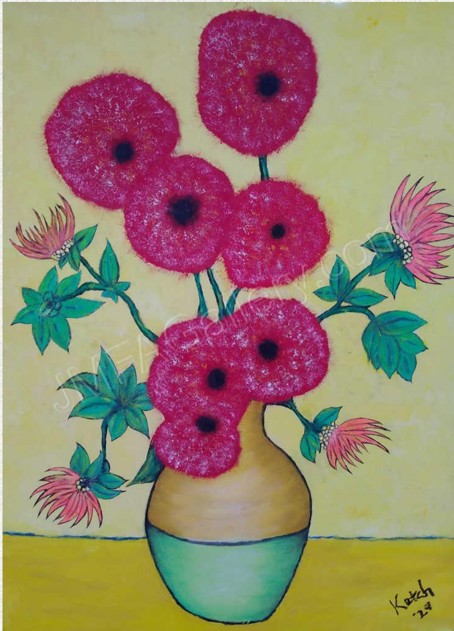
Vase of Flowers 24W"x36H"x1"D oil on canvas, 2024

Inspired by Van Gogh's iconic brushstrokes and vibrant use of color, Ketch reimagined this classic vase of flowers , infusing it with fresh, rich, and joyful hues. Using oil on canvas, Ketch sought to bring new life to his timeless composition, creating a piece that celebrates his legacy while standing as a unique work of fine art. This painting offers a modern yet timeless addition to any collection, radiating warmth and happiness.