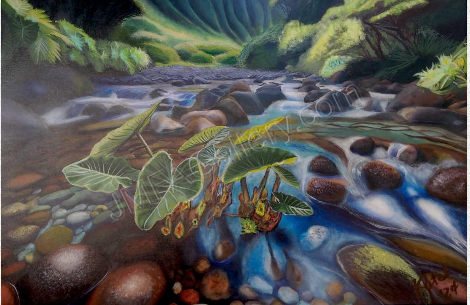
Taro Stream 24W"x36H"x1"D oil on canvas, 2024

This oil-on-canvas painting captures the serene beauty of a Hawaiian mountain stream, framed by the majestic Ko'olau Mountains in the background and lush taro plants in the foreground. It embodies the essence of Ketch's island home, where crystal-clear waters flow from the verdant peaks, nourishing the land before merging with the vast blue Pacific Ocean. Through rich colors and expressive brushwork, this piece reflects the harmony and natural abundance of Hawaii's landscapes.