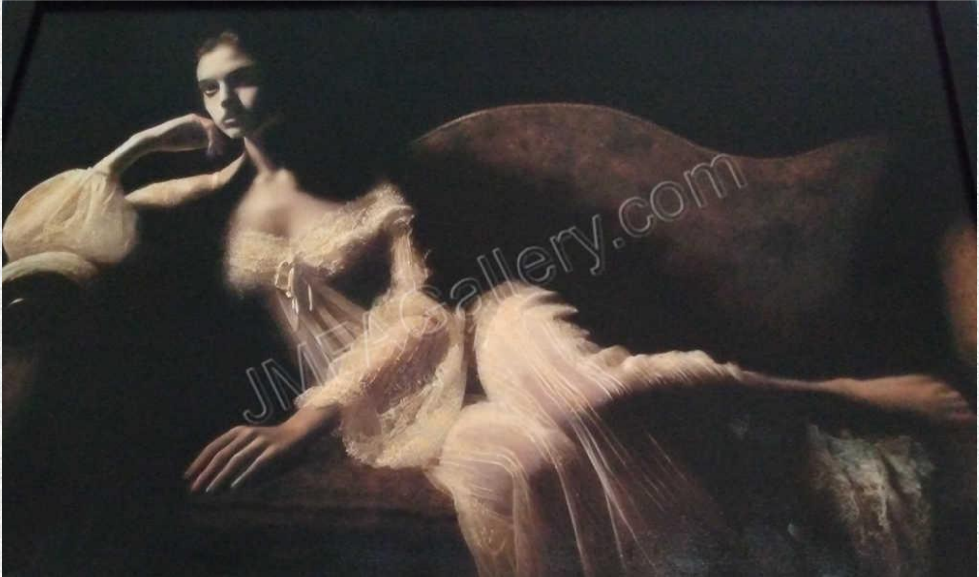
Reclining Woman 36W"x24H"x1"D oil on canvas, 2024