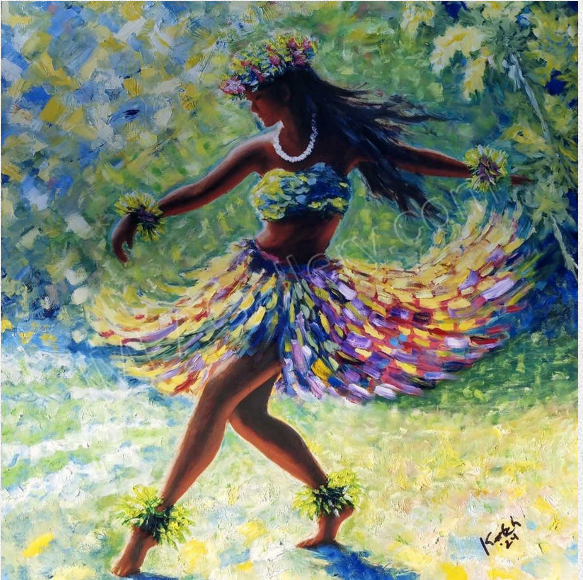
Hula Girl 30W"x30H"x1"D oil on canvas, 2024