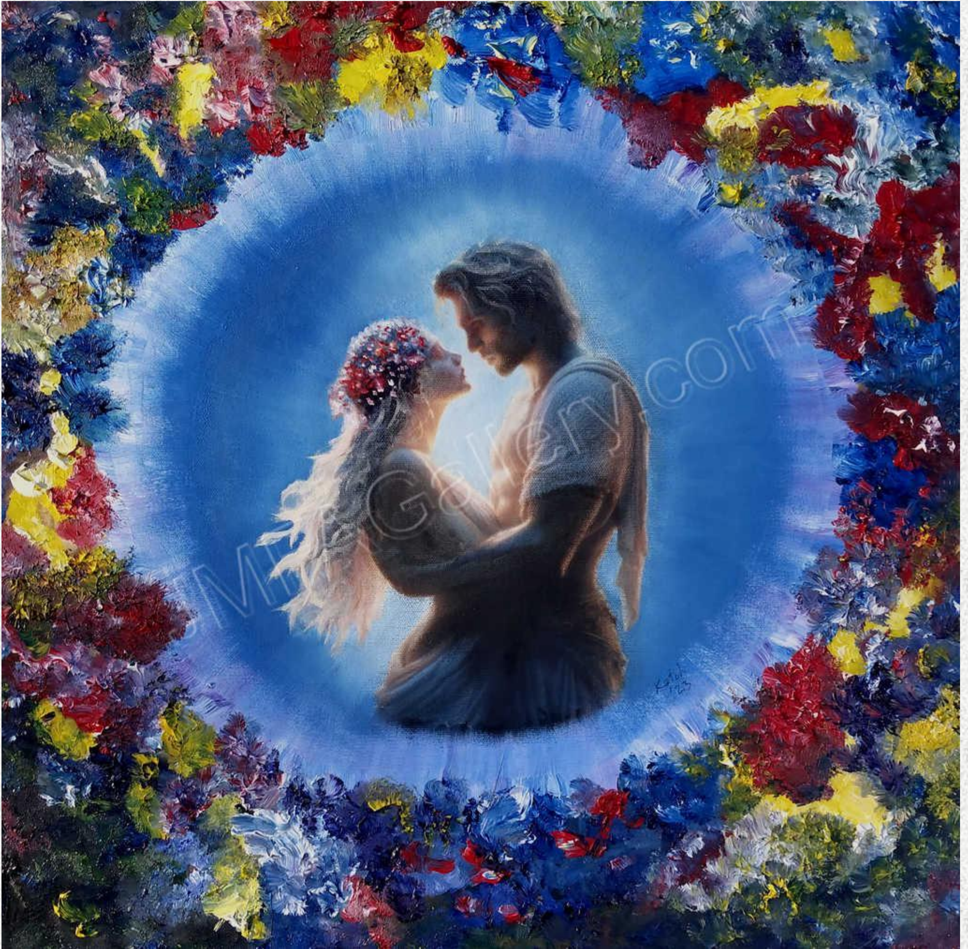
Young Love 24W"x36H"x1"D oil on canvas, 2024

In Ketch's oil-on-canvas painting of Young Love embracing face to face, vibrant colors swirl around them, enveloping their connection in a dynamic, expressive energy. The thick application of paint adds depth and texture, enhancing the intensity of their bond while creating a rich, immersive composition. This piece captures the passion and emotion of love through bold color and its application.