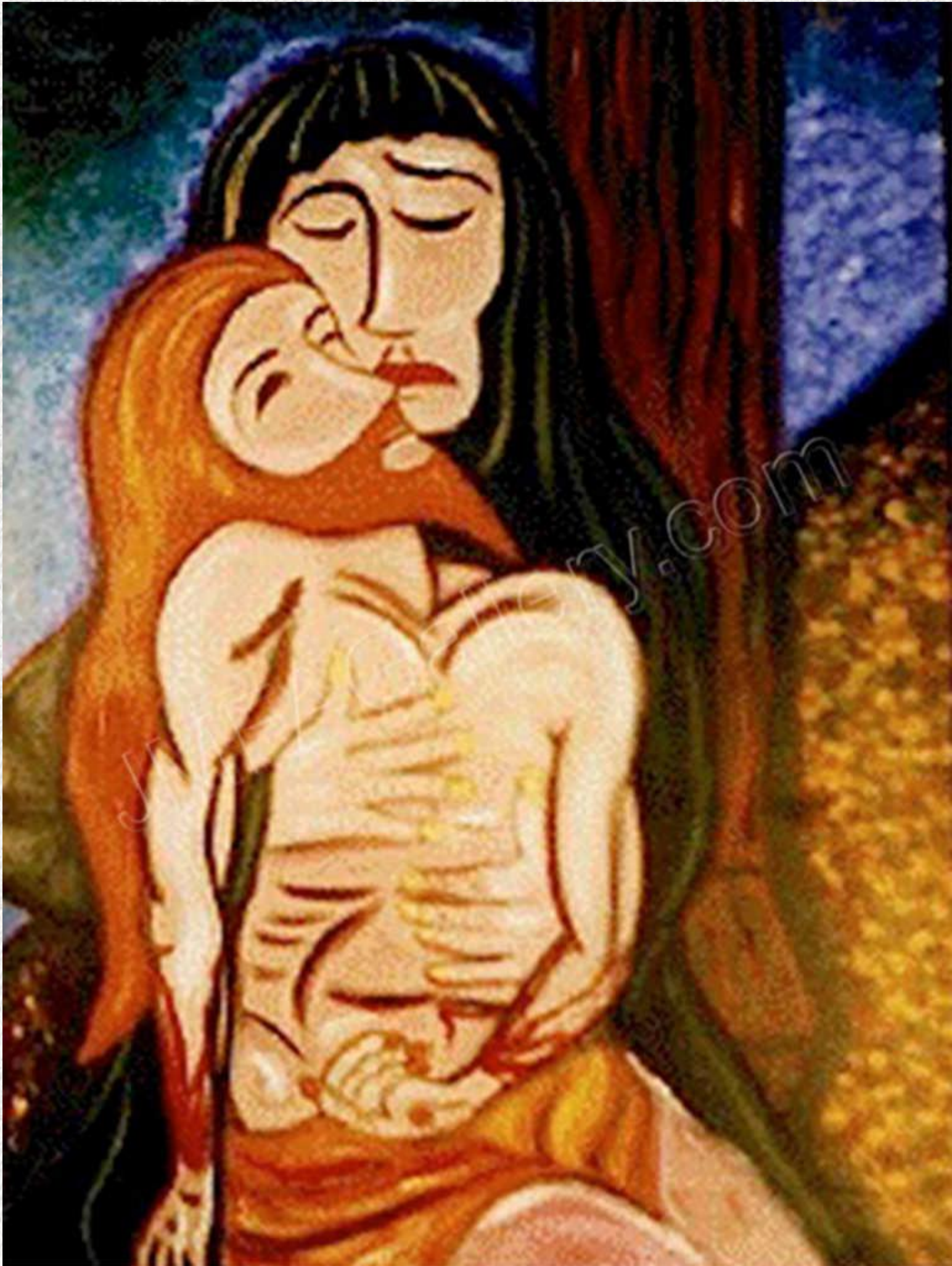
Pieta 30W"x40H"x1"D oil on canvas, 2016

Pieta is part of a thought-provoking series of oil-on-canvas paintings that also includes Adam and Eve , Crucifixion , and Resurrection . These works reinterpret traditional Western religious themes through abstract compositions, bold colors, and stark contrasts, serving as powerful reminders of the profound influence religion has had on our world—for both good and evil.