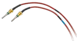
Pocket Short Cable