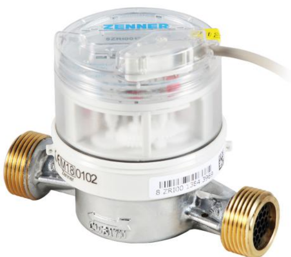
ETKDI-N / ETWDI-N