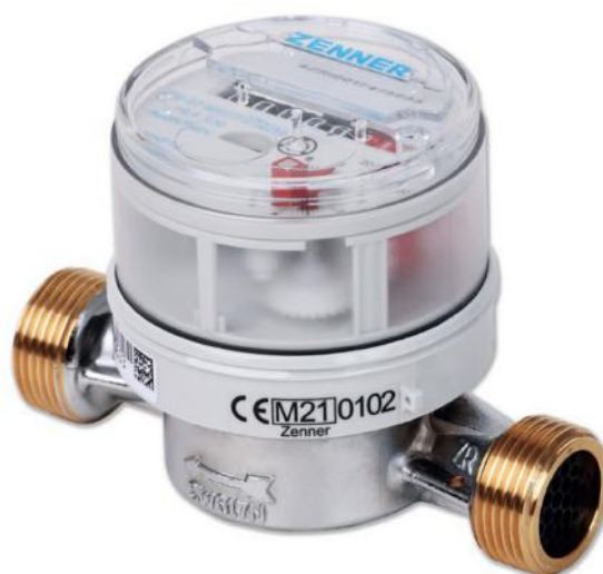
ETKD-N / ETWD-N