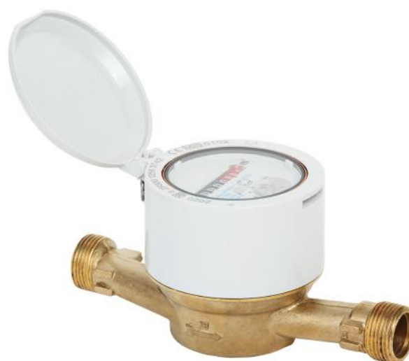
ETKD-M (-CC) / ETWD-M (-CC) ETKDE-M (-CC) / ETWDE-M (-CC)