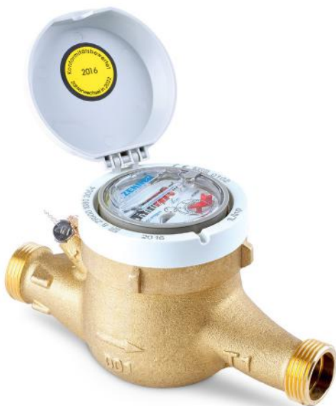
MTKD-M (-CC) MTKD-N

The MTKDI-N is a multi-jet dry-dial meter for cold water with factory-assembled reed pulser.