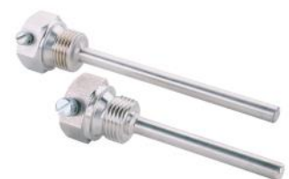
Stainless steel thermowell with 1/2" connection thread