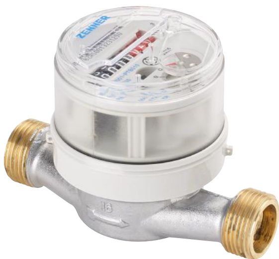
ETKD-M / ETWD-M

The ETKD / ETWD is a single-jet dry-dial water meter for cold and hot water and is available in 3 register variants. The special advantage is its compact design. Due to its very low installation height, the meter can be easily adapted to any installation situation. The meter guarantees reliable recording of meter data for individual consumption billing. All materials, which are used in the drinking water section, comply with the required standards, guidelines and the current German drinking water approval (other country-specific drinking water approvals on request).