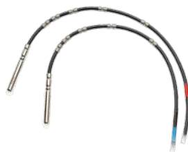
Temperature sensor for heat and cooling meter