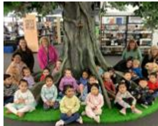
Room for lots of little visitors!