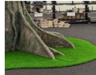
Comfy artificial turf to sit on