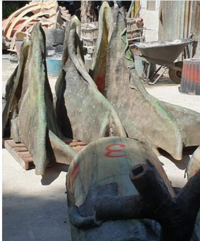
The tree was made in six pieces for easier transport and installation

Another design consideration was the need to distract attention from a prominent air-conditioning duct on the ceiling. We achieved this by careful planning of branches and leaves. Drawing the eye towards the tree rather than the ducting produced a much more visually pleasing effect!