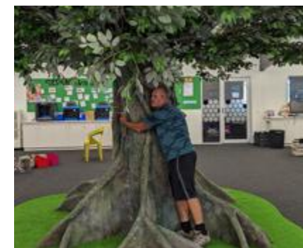
A tree installer or a tree hugger?