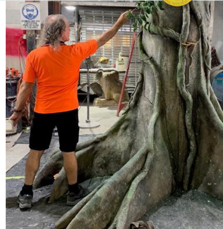
A Natureworks artisan works on the tree trunk in our Brisbane studio