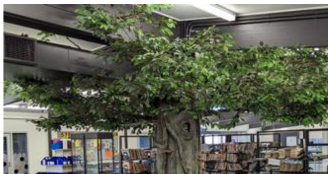
After installation, the tree's foliage helps to conceal the ducting