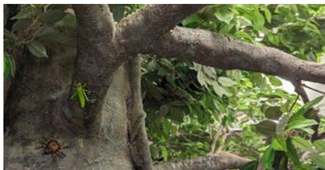
Close-up view of insects on the trunk, and leafy foliage