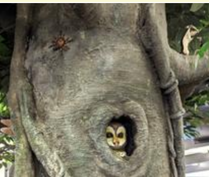
Various creatures to look for!

Deana Cuconits, Parafield Gardens Primary School