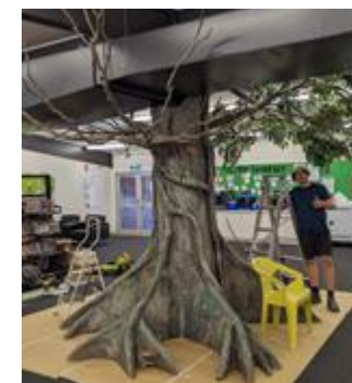
Installing the tree at the school