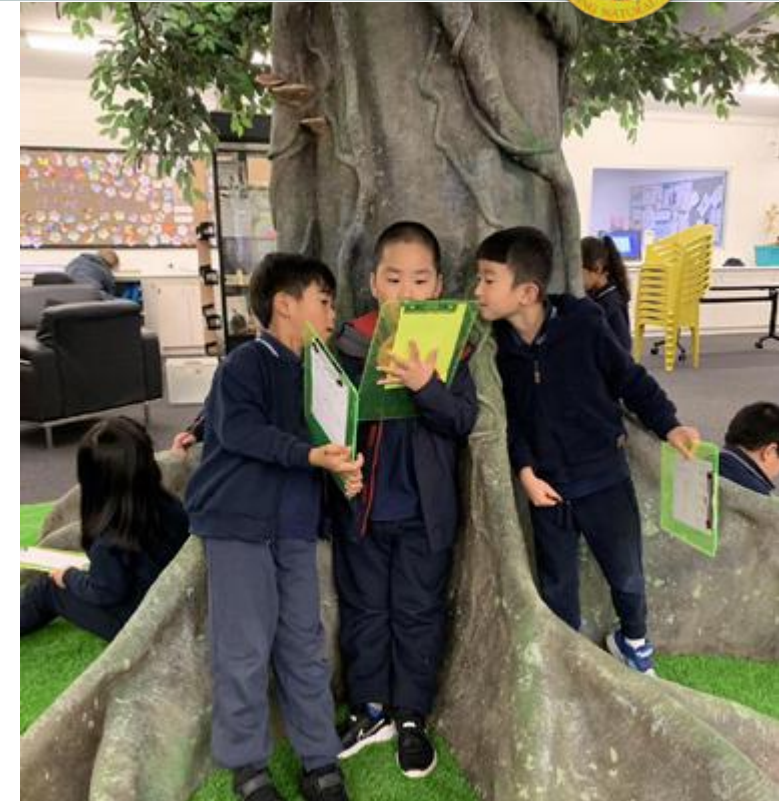
Children under the tree

“Words honestly cannot describe how absolutely blown away I am with what you have all created for us. It is absolutely exquisite and has exceeded anything I had dreamed of having created. I can’t thank you enough for bringing our vision to life.”