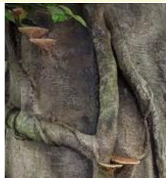
Fungi and vines on the trunk