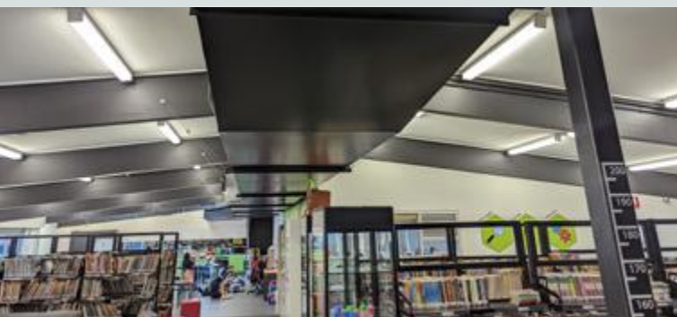
The prominent air conditioning duct (before the tree was installed)