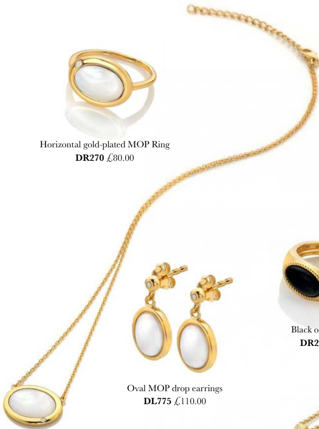
Horizontal gold-plated MOP necklace DN186 £140.00