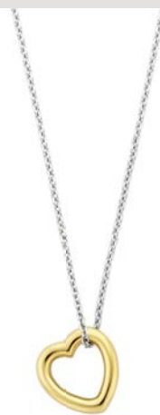
Ti Sento silver and gold plated open heart pendant and 42cm chain 34022SY £109.00