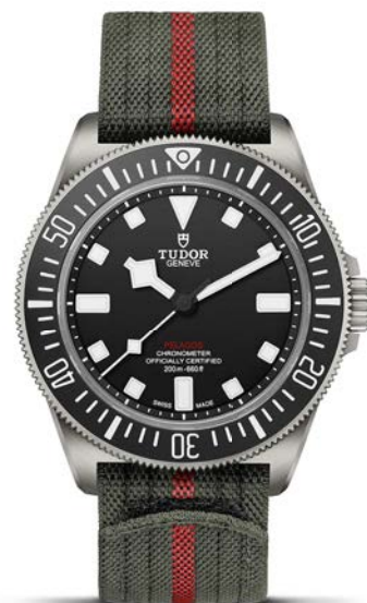
TUDOR Pelagos FXD Green and red strap M25717N-0001 £3,490.00

To celebrate its partnership with Alinghi Red Bull Racing, TUDOR has unveiled two brand-new Pelagos FXD models: a chronograph and a time-only watch, inspired by yacht racing. With cases made from carbon composite, titanium, and stainless steel, and fitted with manufacture calibres, these watches embody the daring spirit that is required to be a contender in the most competitive yacht race in history.