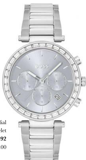
BOSS Andra silver dial steel bracelet 1502692 £249.00