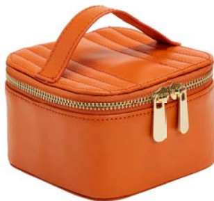
Maria Tangerine Jewellery Cube. Ideal for a frequent traveller, take it with you wherever you go for business, leisure and everything in-between.