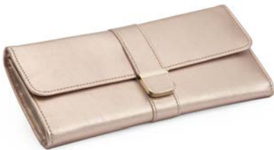
Palermo Jewellery Roll in rose gold. This stunning roll includes 1 ring roll, 13 earring holes, 6 necklace holders and two storage compartments.