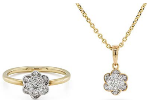
9ct yellow and white gold diamond flower cluster ring .21cts 01050168 £595.00