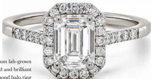
Platinum lab-grown emerald and brilliant cut diamond halo ring 01360038 £3,495.00