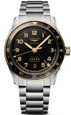
Longines Steel and Yellow Spirit Zulu Time self winding 072120030 £4,100.00