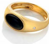
Black onyx oval ring DR257 £95.00