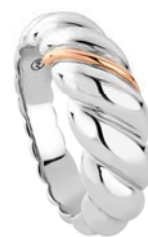
Clogau Lover's Twist ring 3SLTW0655 £169.00