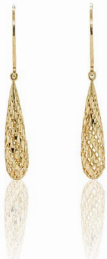
9ct yellow gold diamond cut mesh teardrop earrings 05510484 £135.00