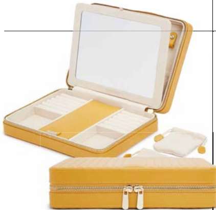
Maria Large Zip Mustard Jewellery Case. Pure sophistication with the right amount of detail and storage facilities including two drawstring pouches, ring rolls and 6 necklace snap on-hook.