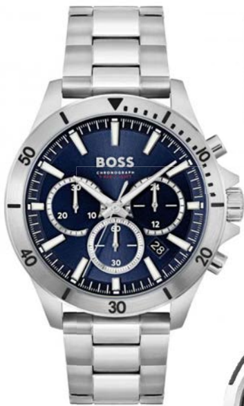
BOSS Troper blue chronograph bracelet 1514069 £249.00