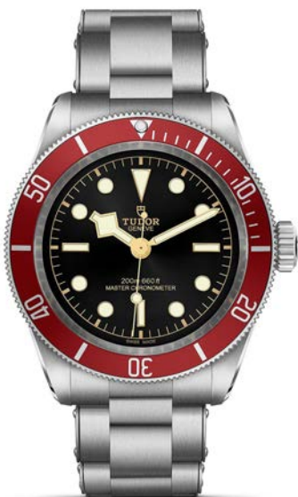
TUDOR Black Bay 41mm Automatic Steel Watch M7941A1A0RU-0001 £3,700.00

Discover our TUDOR men's watches collection; a Swiss watchmaking brand known for its sophisticated style, unwavering reliability, and affordability. Chosen by bold adventurers across different terrains, TUDOR's history boasts a legacy of excellence.