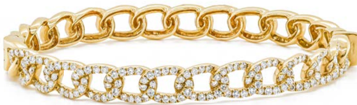
A gorgeous half diamond set and half yellow gold Cuban curb bangle 1.75cts 05460088 £4,500.00

Could a chunky chain be the missing link in your wardrobe? Here's just some of the statement pieces we have on offer.