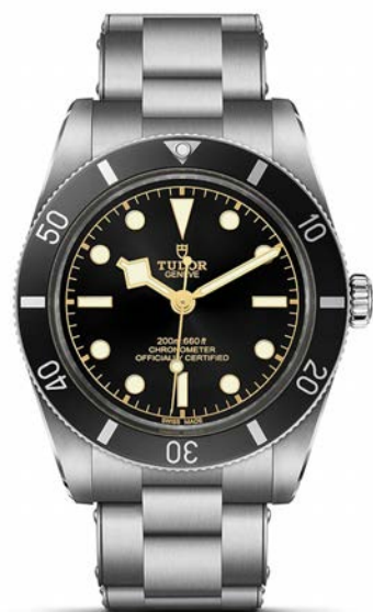
TUDOR Black Bay 54 37mm Black Dial M79000N-0001 £3,260.00