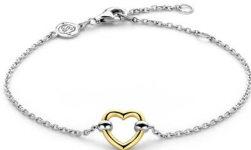
Ti Sento silver and gold plated heart bracelet 23017SY £89.00