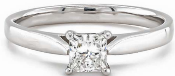
18ct white gold lab-grown princess cut diamond ring 1.50cts 01360024 £3,195.00

Q. WHAT IS THE BEST CERTIFICATION FOR LAB-GROWN DIAMONDS? They are all graded on the 4C's like mined diamonds: carat, cut, clarity and colour. So the best grading for clarity is Flawless (F) which means there are no inclusion's visible under 10x magnification, while a colour between D and F will mean your diamond is colourless so is the best grading for colour.