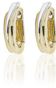
9ct yellow and white gold two-strand curved huggie earrings 05510604 £315.00