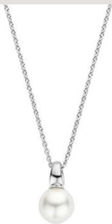
Ti Sento silver pearl and CZ pendant and 42cm chain 34038PW £79.00

Inspired by CLASSIC SHAPES, but never old-fashioned. Created for a LIFETIME AND BEYOND, but never out of style. This is TI SENTO.