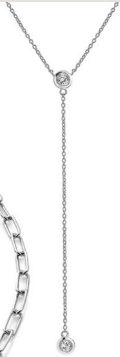
Tender Waterfall necklace DN176 £95.00