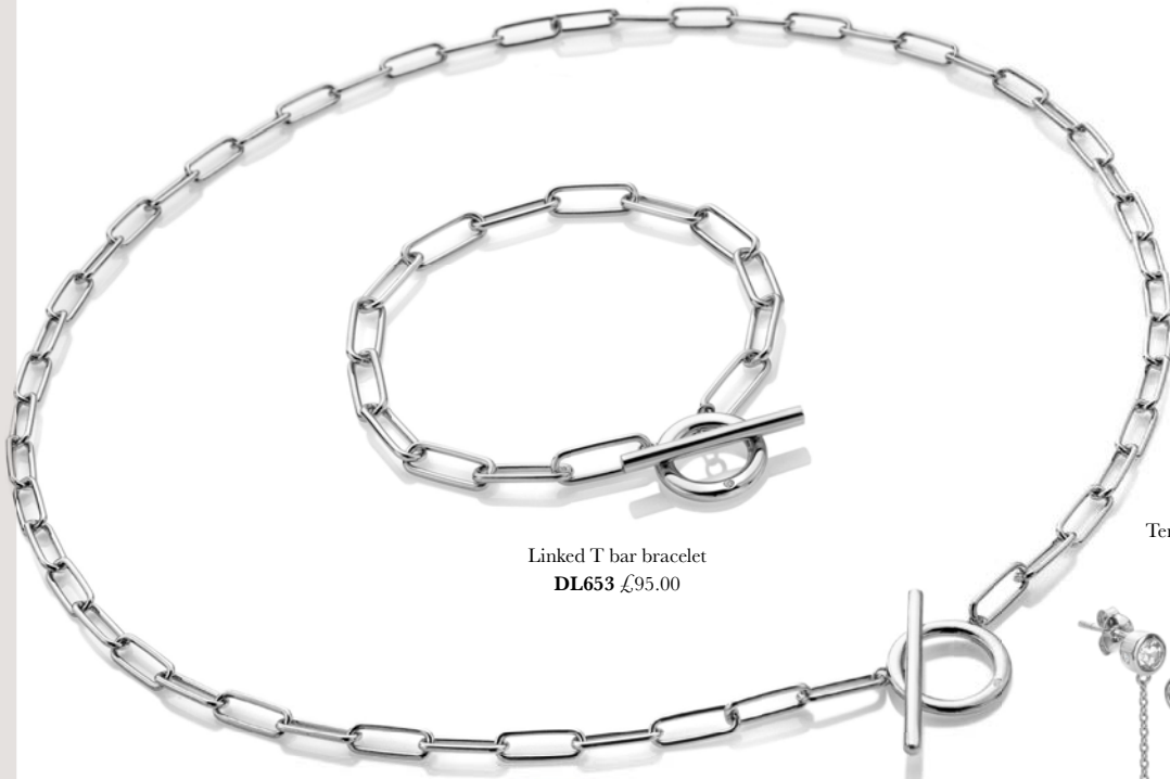
Linked T bar bracelet DL653 £95.00

The discerning choice for a special gift to a loved one, with luxury gift packaging.