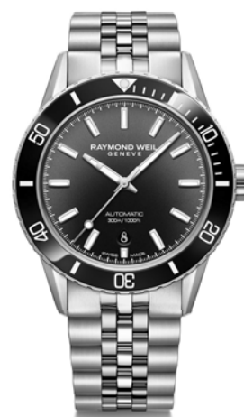
Raymond Weil Freelancer Diver automatic 07610055 £2,095.00