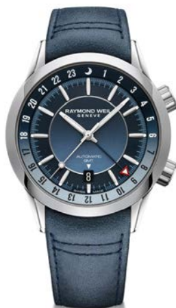
Raymond Weil Freelancer GMT World Timer 41mm blue strap 07610051 £2,295.00