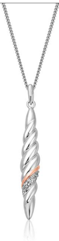
Clogau silver and 9ct rose gold white topaz Lover's Twist pendant with 20" chain 3SLTW0613 £189.00

The LOVER'S TWIST collection romantically symbolises the intimacy of two souls joined together as one. An intricately intertwining body of sterling silver shaped in a classic twist style is embellished with warm 9ct rose gold.