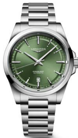
Longines Conquest 41mm Automatic green dial bracelet 072110166 £1,900.00