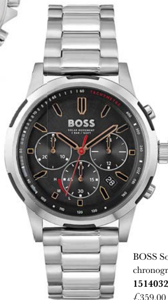
BOSS Solgrade black chronograph steel 1514032 £359.00