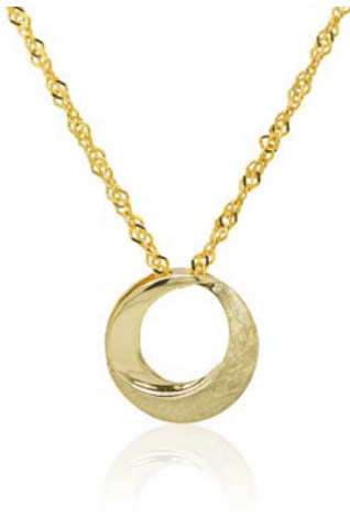
9ct yellow gold polished and satin finished open circle pendant with 16" chain 05180121/05010049 £245.00