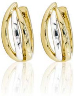
9ct yellow and white gold three-strand huggie earrings 05510605 £385.00