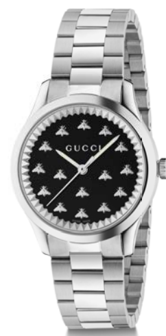
Gucci G Timeless 32mm black bee dial bracelet watch YA1265034 £1,130.00