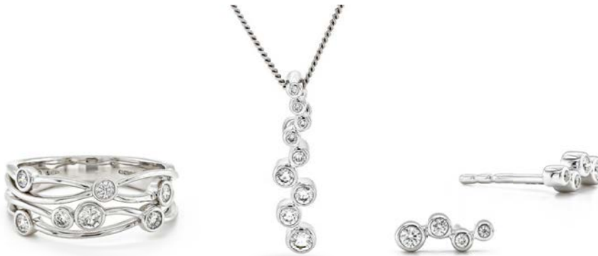
18ct white gold scattered diamond dress ring 04040145 £1465.00