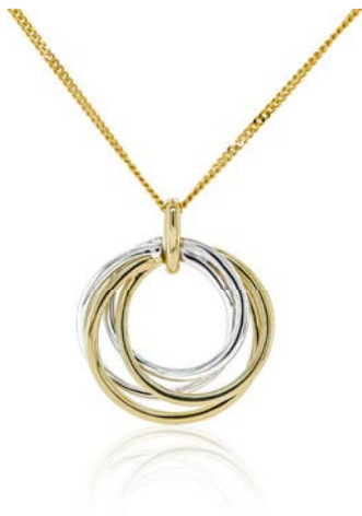
9ct yellow and white gold entwined open circles pendant with 16" chain 05180122 /05010035 £300.00