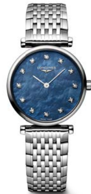
Longines La Grande Classique blue diamond 072150089 £1,700.00