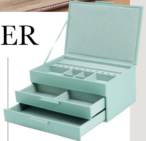
Classic meets contemporary with this Sophia Jade jewellery box with drawers. Keep your treasured items in the many compartments, including 4 ring rolls, 10 storage compartments, charm storage and long necklace storage.