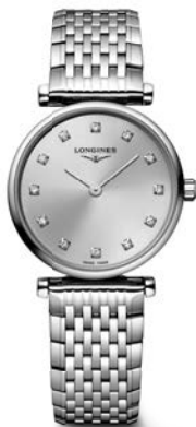
Longines La Grande Classique grey diamond 072150090 £1,350.00