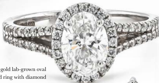
18ct white gold lab-grown oval cut diamond ring with diamond halo and shoulders 01360048 £1,950.00