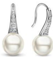
Ti Sento silver pearl and CZ drop earrings 7938PW £75.00