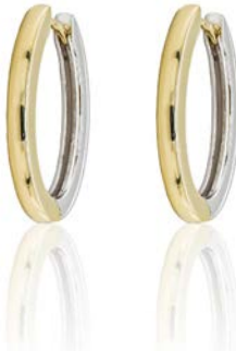
9ct yellow and white gold flat-sided oval hoops 05510130 £435.00