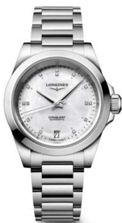
Longines Conquest 34mm Automatic MOP diamonds bracelet 072150091 £2,400.00