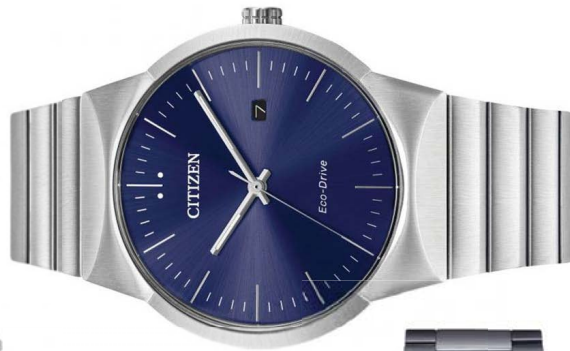
Citizen men's Eco Drive blue dial stainless steel bracelet BM7580-51L £229.00