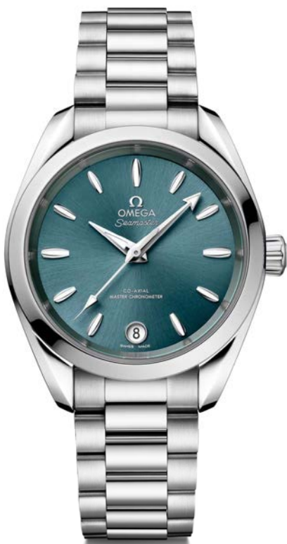
LAGOON GREEN 34mm