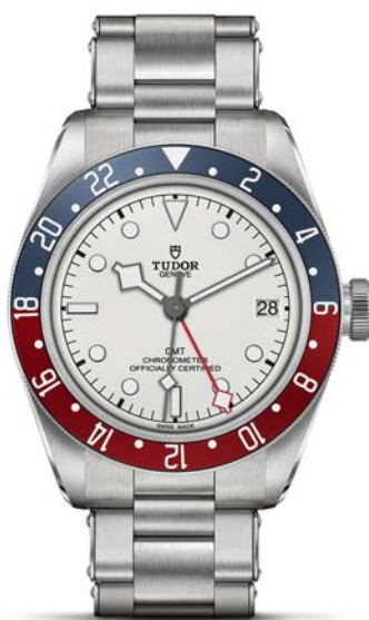
TUDOR Black Bay GMT 41mm Opaline Dial M79830RB-0010 £3,660.00