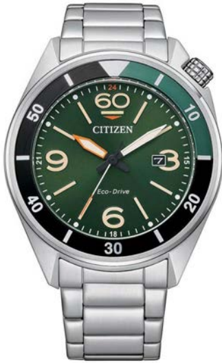
Citizen men's Eco Drive green arabic dial stainless steel bracelet sports watch AW1718-88X £199.00