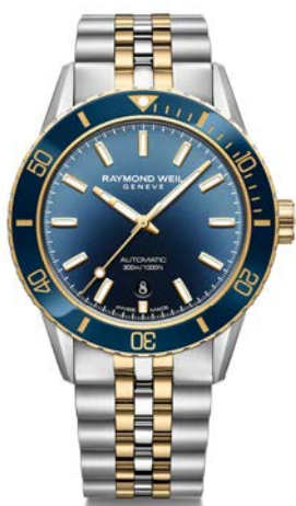
Raymond Weil Freelancer Automatic steel and yellow gold 07620014 £2,195.00