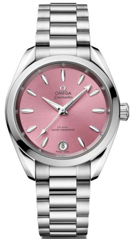
SHELL PINK 34mm