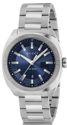
Gucci GG2570 blue dial bracelet watch YA142303 £1,040.00