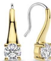
Ti Sento silver and gold plated brilliant cut CZ drop hook earrings 7947ZY £75.00