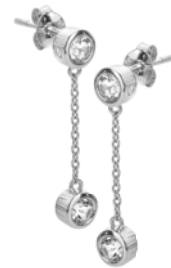
Tender Waterfall drop earrings DE750 £70.00