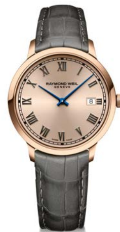
Raymond Weil Toccata 39mm rose dial strap 07630005 £895.00