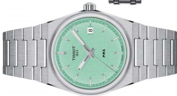
Tissot PRX 35mm quartz T137.210.11.091.00 £335.00