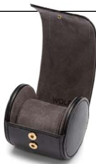
A black vegan leather single watch roll, which is the perfect travel companion for your watch, or for keeping in a safe. 529080 £70.00