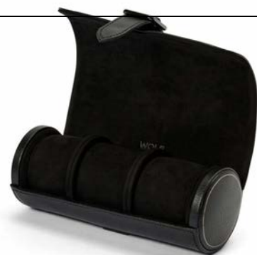
British Racing black triple watch roll, featuring space for three watches, with two watch guards, and a hidden capsule inside the watch roll, with compartments to keep cufflinks and rings. 792902 £275.00