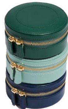
The Sophia Round Zip Case is designed to protect jewellery with style and function in mind. Shown here in forest green, jade and indigo.