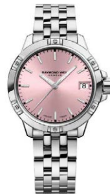
Raymond Weil Tango Classic 30mm pink dial bracelet 07650024 £995.00