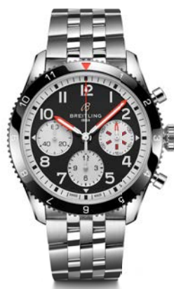
Breitling Classic AVI Chronograph 42 Mosquito Y233801A1B1A1 £5,300.00