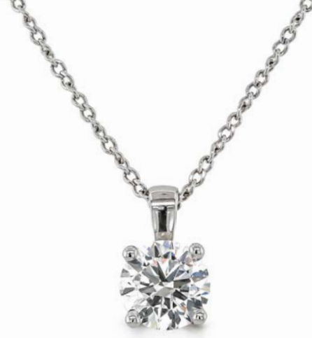
18ct white gold round brilliant cut lab-grown diamond pendant 1.50cts 01350026/05080038 £2,325.00