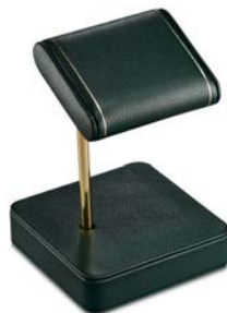
British Racing green static watch stand. Made from vegan leather, this watch stand features a soft padded top cushion - keeping your watch safe, scratch free and accessible. 486441 £89.00