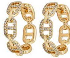
18ct yellow gold hoops featuring long oval diamond set links set with a diamond set bar through the centre of the loop .23cts 05530736 £1,275.00