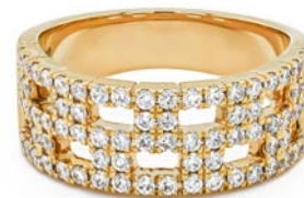
18ct yellow gold brilliant cut diamond wide patterned band 04040213 £2,535.00