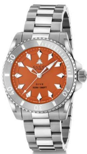
Gucci Dive 40mm orange dial bracelet watch YA136355 £1,640.00