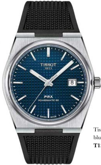
Tissot PRX Powermatic 80 blue dial black rubber strap T1374071704100 £640.00