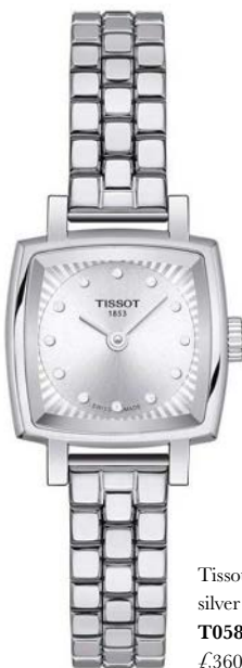
Tissot T-Lady square silver diamond dial T0581091103601 £360.00