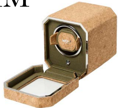
The Cortica watch winder is handmade from sustainably grown Portuguese cork. With its octagonal shape and smooth edges, the khaki green interior gives it a unique and natural style. 668161 £605.00