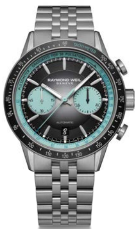
Raymond Weil Limited Edition Pop chronograph bi-compax 07610054 £3,495.00