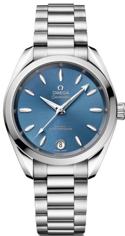
SEA BLUE 34mm