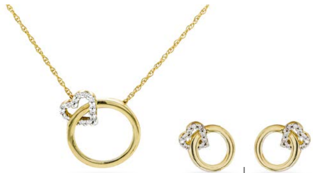
9ct yellow gold diamond open circle and heart pendant with 9ct 18" chain 05190599/05020092 £420.00