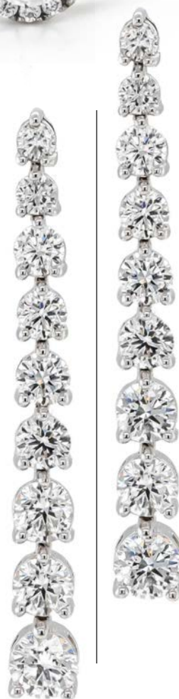
18ct white gold lab-grown graduated brilliant diamond drop earrings 1.50cts 01370004 £1,750.00