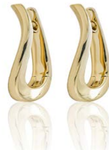
9ct yellow gold curved huggie style earring 05510260 £325.00