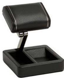
Travel watch stand. Take this accessory away with you to keep your watch by your bedside. The watch stand conveniently folds down to fit into a bag. 485402 £119.00