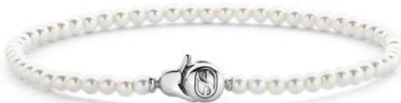
Ti Sento silver simulated pearl bracelet 2965PW £69.00