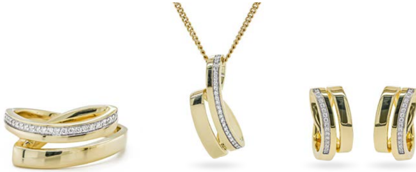
9ct yellow gold split diamond set band 04040221 £715.00

Jewellery suites with two or three matching items are the perfect way to make a statement.