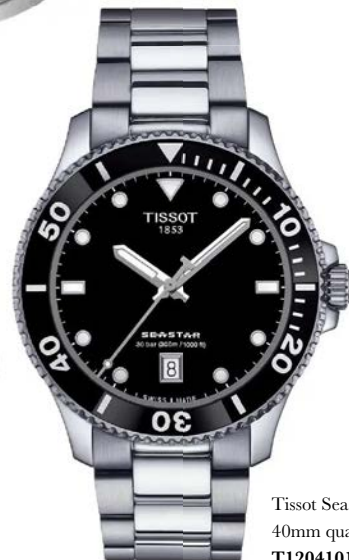
Tissot Seastar 1000 40mm quartz black dial T1204101105100 £425.00