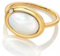
Horizontal gold-plated MOP Ring DR270 £80.00