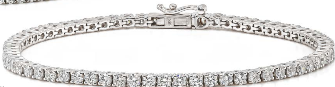
18ct white gold lab-grown brilliant diamond line bracelet 4.00cts 01380002 £3,995.00