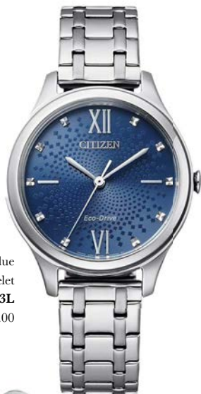
Citizen Elegance blue dial bracelet EM0500-73L £149.00