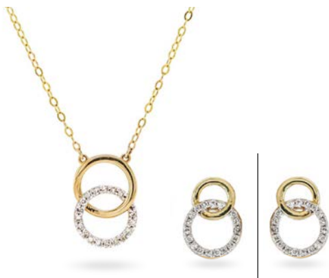
9ct yellow gold entwined circles diamond set pendant and chain 18" 05190656 £415.00