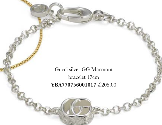
Gucci silver GG Marmont bracelet 17cm YBA770756001017 £205.00