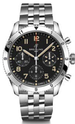
Breitling Classic AVI Chronograph 42 Mustang A233803A1B1A1 £5,200.00