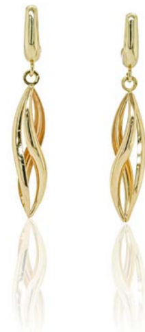
9ct yellow gold torpedo twist drop earrings 05510495 £125.00