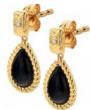
Black onyx dropper earrings DE738 £110.00