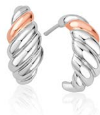
Clogau silver and rose gold Lover's Twist earrings 3SLTW0614 £199.00