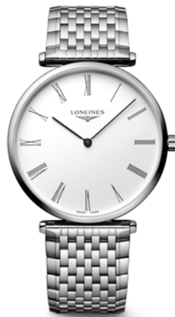
Longines La Grande Classique 38mm white roman dial 072110158 £1,200.00