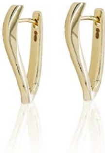
9ct yellow gold wavy Creole earrings 05510608 £425.00