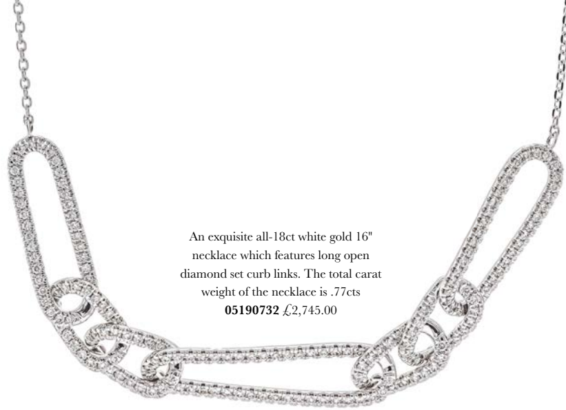
An exquisite all-18ct white gold 16" necklace which features long open diamond set curb links. The total carat weight of the necklace is .77cts 05190732 £2,745.00