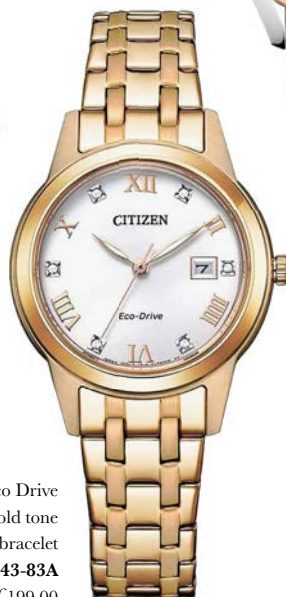
Citizen women's Eco Drive stainless steel gold tone silhouette crystal bracelet FE1243-83A £199.00