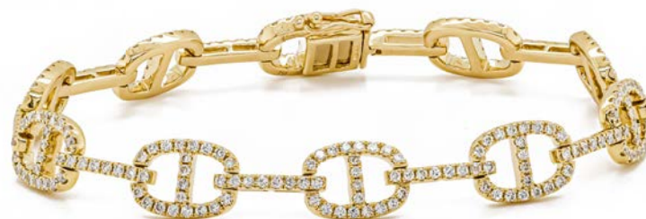
18ct yellow gold oval bar set diamond pavé link bracelet 2.25cts 05450170 £4,195.00