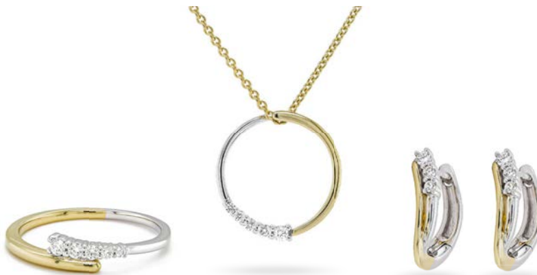
9ct yellow and white gold split graduated diamond dress ring 04040218 £485.00