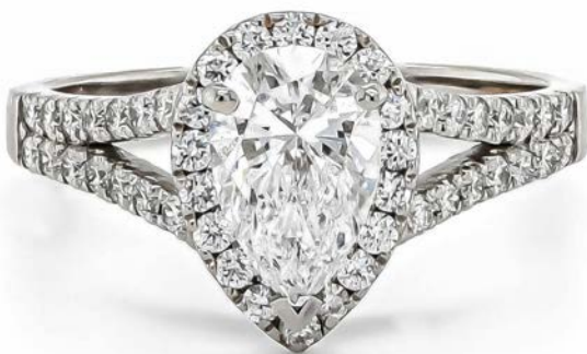
Platinum lab-grown pear and brilliant cut diamond ring 01360039 £2,425.00