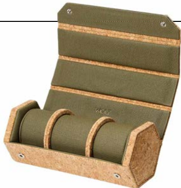
Perfect for travel or for the bedside table at home. The Cortica collection is handmade from Portuguese cork, and has a striking khaki green interior. The watch roll holds three watches, and has a hidden jewellery compartment on the inside. 668361 £355.00