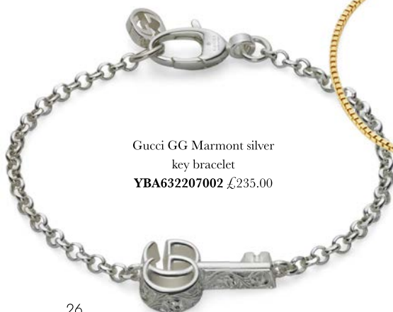
Gucci GG Marmont silver key bracelet YBA632207002 £235.00