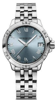
Raymond Weil Tango 30mm blue dial steel 07650022 £995.00