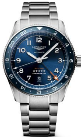
Longines Spirit automatic bracelet 072110169 £3,000.00