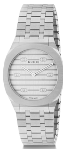
Gucci 25H 30mm silver dial bracelet watch YA163501 £1,090.00