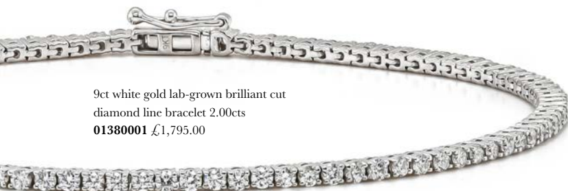
9ct white gold lab-grown brilliant cut diamond line bracelet 2.00cts 01380001 £1,795.00

Here's a small selection of the wide collection of LAB-GROWN DIAMOND JEWELLERY we have on offer.