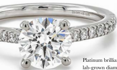
Platinum brilliant cut lab-grown diamond ring with lab-grown diamond shoulders 01360020 £2,895.00