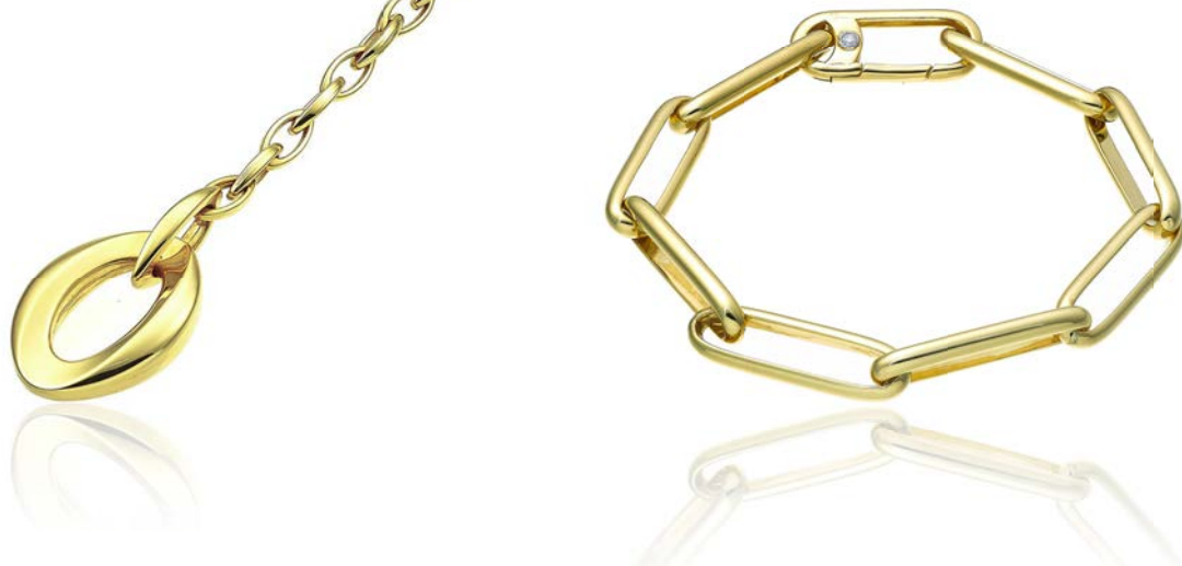
18ct yellow gold diamond link Sensi necklace 05190709 £3,060.00