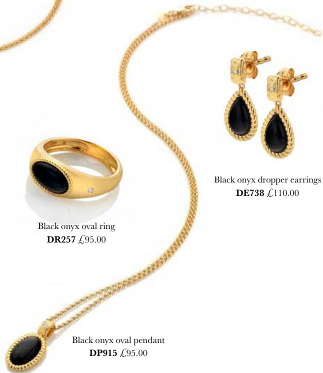
Black onyx oval pendant DP915 £95.00