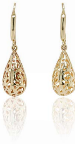
9ct yellow gold fancy teardrop earrings 05510542 £195.00