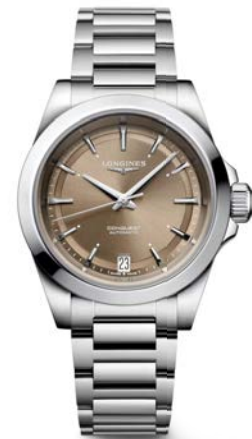
Longines Conquest 34mm Automatic brown dial bracelet 072150092 £1,900.00