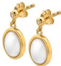
Oval MOP drop earrings DL775 £110.00