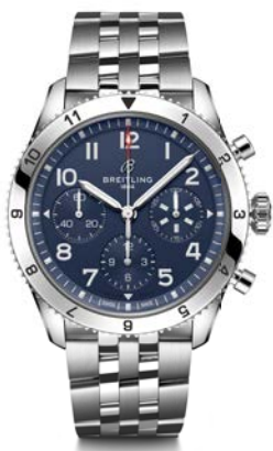
Breitling Classic AVI Chronograph 42 Tribute to Vought F4U Corsair A233801A1C1A1 £5,200.00