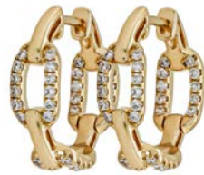
A beautiful pair of 18ct yellow gold hoop earrings which feature long open gold and diamond set links .34cts 05530735 £1,025.00