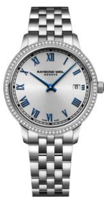
Raymond Weil Toccata 34mm quartz 07650025 £1,795.00