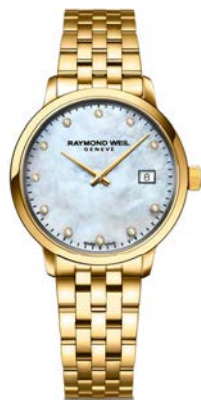
Raymond Weil Toccata 29mm yellow PVD bracelet 07670005 £1,150.00