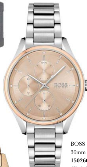
BOSS Grand Course 36mm bracelet 1502604 £219.00