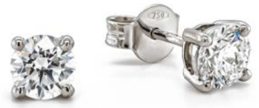
18ct white gold brilliant cut lab-grown diamond earrings 1.20cts 01370001 £1,500.00