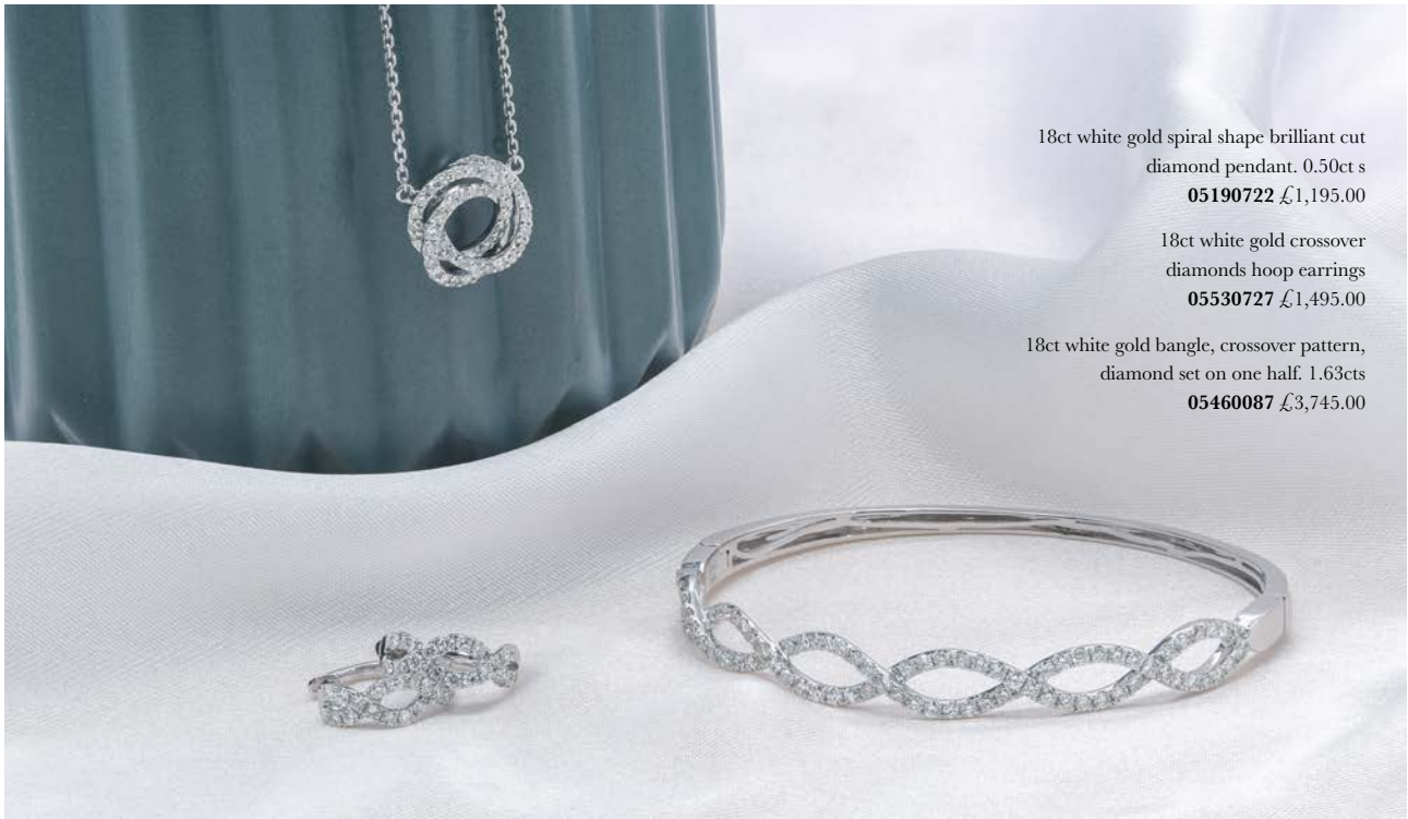
18ct white gold spiral shape brilliant cut diamond pendant. 0.50ct s 05190722 £1,195.00