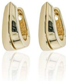
9ct yellow gold two-strand huggie earrings 05510606 £425.00