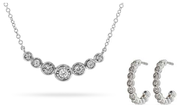
9ct white gold brilliant cut diamond illusion rubover set graduated necklace 05190669 £755.00