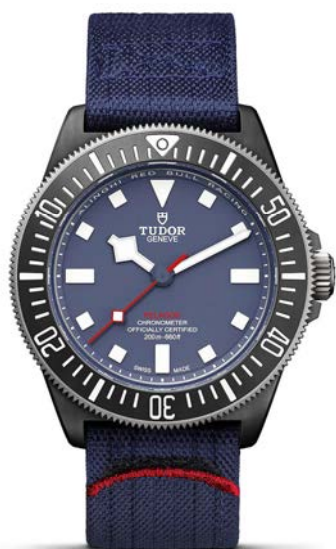
TUDOR Pelagos FXD Alinghi Red Bull Racing Edition M25707KN-0001 £3,130.00