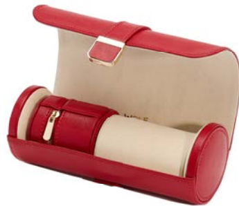
Palermo Red Double Watch and Jewellery Roll. Store your favourite watch and jewellery pieces in this sumptuous roll. Ideal for storing two watches, with small jewellery storage in a zip pouch and a hidden capsule for storing even smaller items.