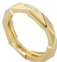
Gucci Link to Love 18ct yellow gold 4mm studded ring YBC662177001013 £1,200.00