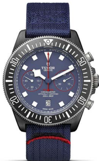
TUDOR Pelagos FXD Chrono Alinghi Red Bull Racing Edition M25807KN-0001 £4,340.00