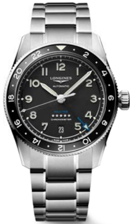
Longines Spirit Zulu Time automatic bracelet 072110168 £3,000.00