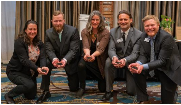
Public policy group 'Incentivizing the Use of Biochar in Government-Funded Projects.'