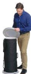
Apply the counter top