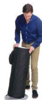
Insert case into wooden base