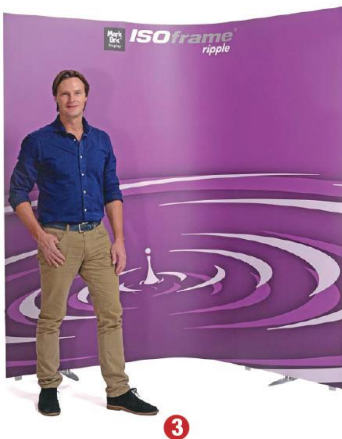
A complete 3-section display wall