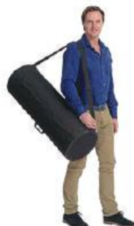
Shock-proof carry bag with cardboard inner tubing