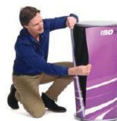
Wrap around the graphic