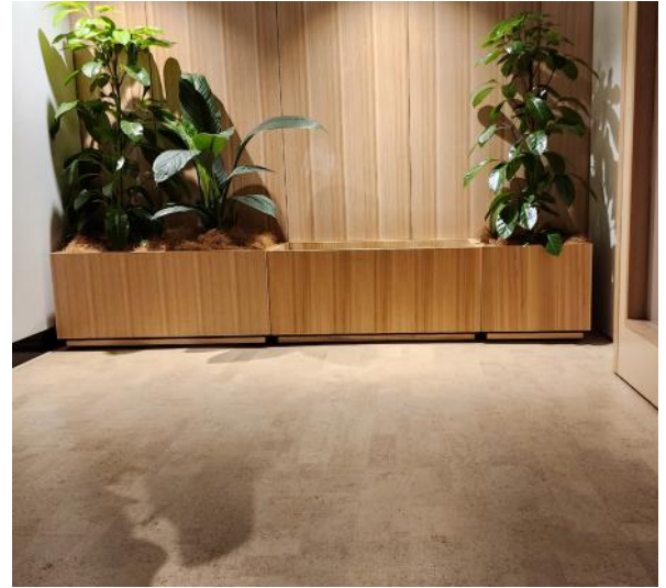
Photos of the Cork flooring installed in the ANZ trial program

Woodcrete are the Australian agents for Cork Art which hails from Portugal and boasts a rich history. The quality of Cork Art's products is self-evident, and the natural, recyclable, and biodegradable properties of cork, coupled with its exceptional insulating and acoustic features, make it an increasingly popular choice.