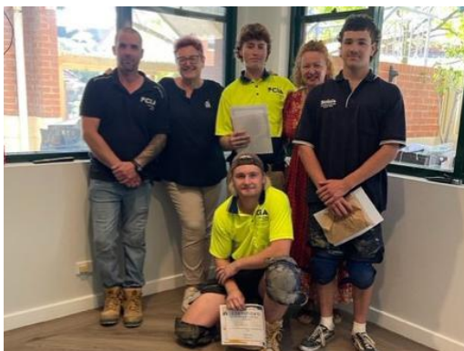
Photos from the workshop at Ronald Macdonald House Randwick

For those seeking more information on these transformative workshops, please direct inquiries to info@fcia.org.au . FCIA remains committed to fostering growth, skills, and compassion within the flooring community.