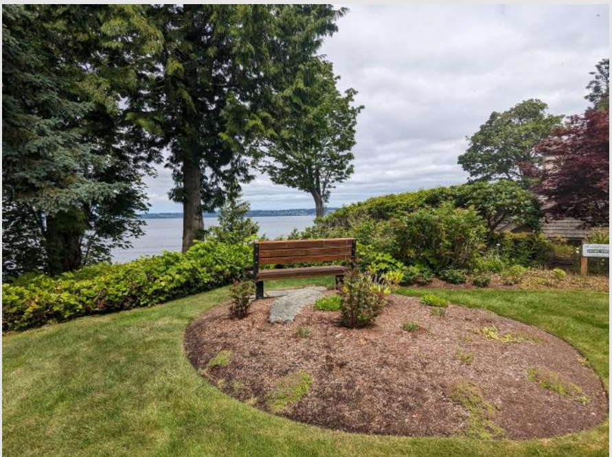
Boundary Ridge Park and scenery—June, 2024