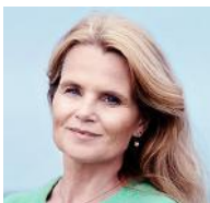
TORBJØRG KLARA FOSSUM VP Global CCS Solutions Equinor