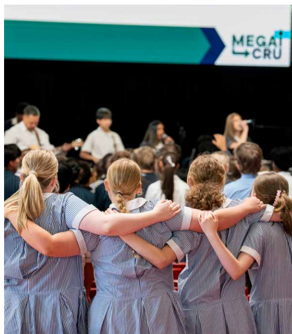
Students at Western Sydney MegaCRU