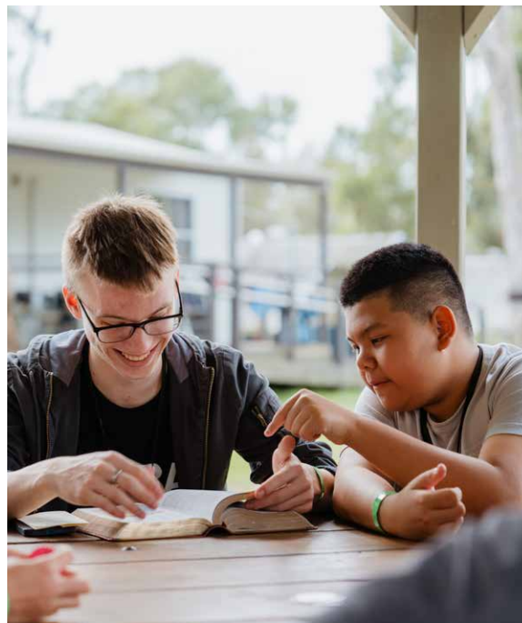
Campers exploring the Bible on camp

in turn allows for greater connection following on from camp. The team strive to create both a safe space for campers to explore and ask questions as well as opportunities to get out of their comfort zone and be challenged.