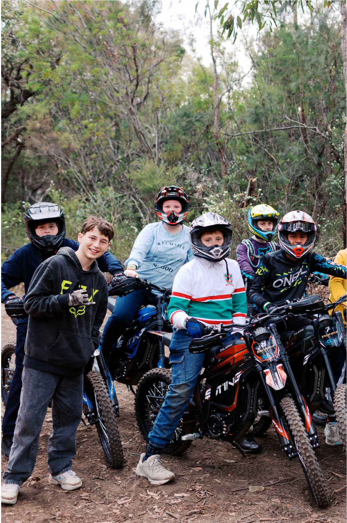
Campers on Dirt Action, winter 2025