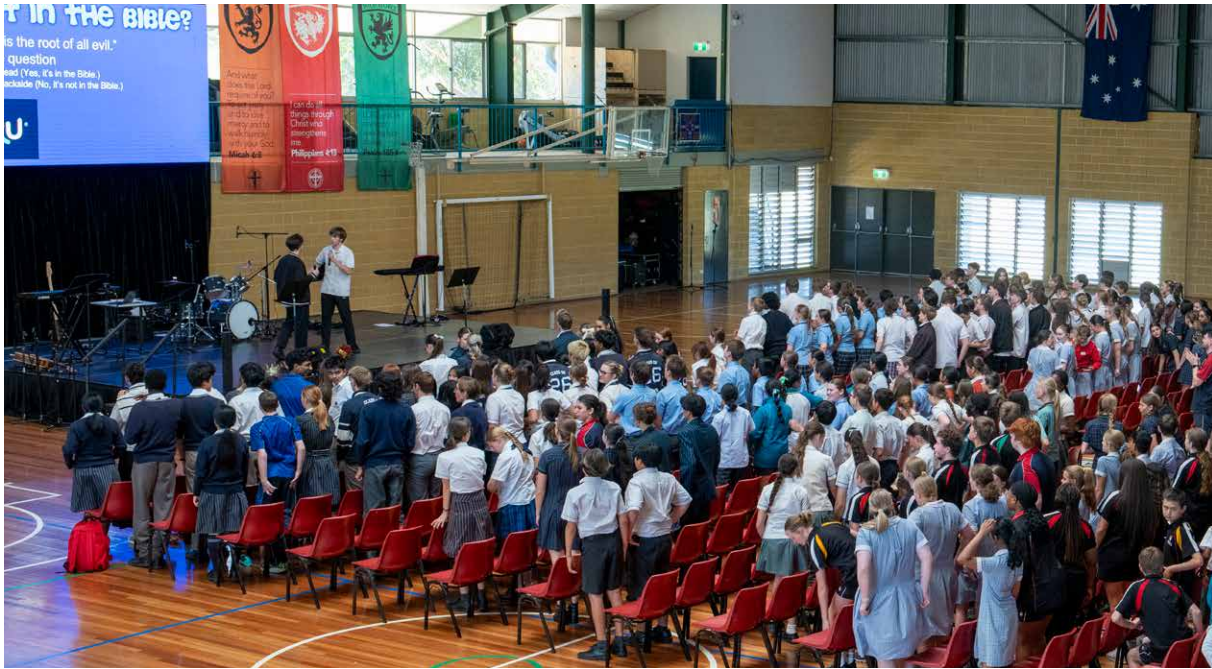
Western Sydney MegaCRU at St Paul's Grammar in Term 4, 2025