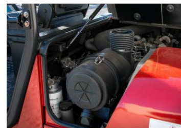
Donaldson Air Cleaner with Safety Element