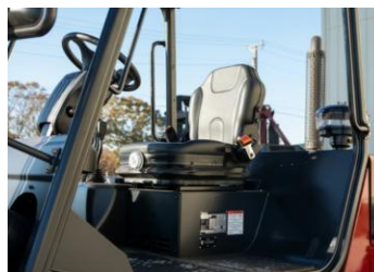
Adjustable Black Vinyl Mechanical Suspension Seat. Adjustable Weight Range to 370 lbs