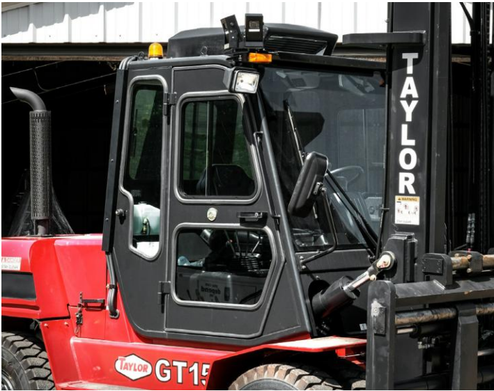
Optional Fully Enclosed & Partial Cabs Available