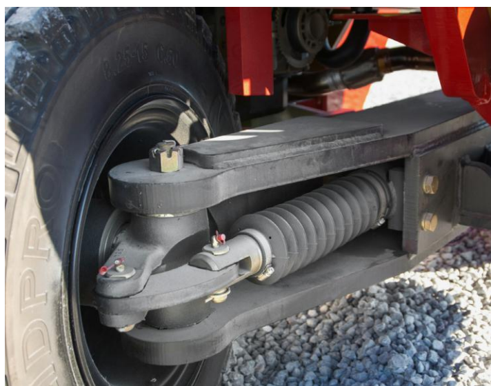
Heavy Duty Steer Axle Mounted on Rubber Isolators. Toughest Steer Axle Profile Available