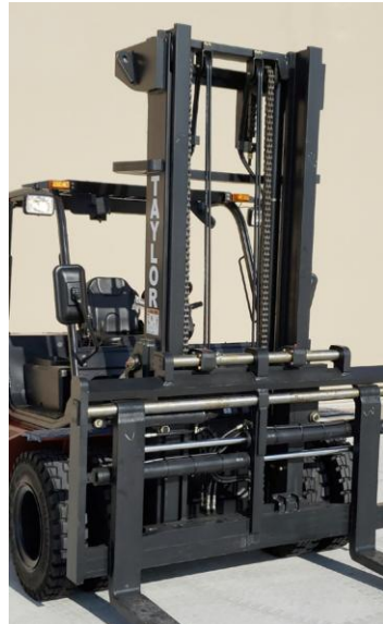
Durable Nested I-beam Design Yields Optimal Visibility