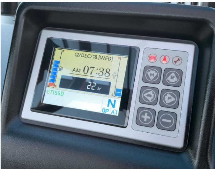
Weather Sealed High Visibility LCD Diagnostic Display Includes Fault Code Storage and is Password Protected

Taylor Machine Works was founded on the promise of meeting our customer's needs. The sign on our original facility in 1927 stated "We Engineer and Build What You Need" and those ideals still ring true today! From multiple Mast, Carriage and Fork configurations to Special Attachments that are unique to your business, we will step forward to meet the challenge. With hundreds of options readily available for our trucks, and the ability to custom engineer any other need that arises, Taylor Machine Works is here ready to serve.