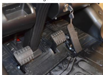
Two Pedal Hydraulic Inching & Brake and Moulded Rubber Floormat