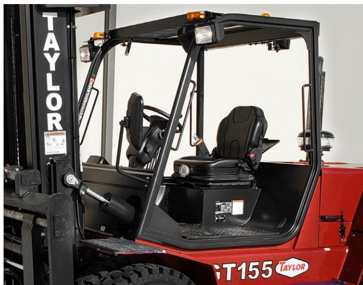
Isolation Mounted Open Operator Base with Overhead Guard