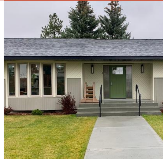
Gambal House — This generously donated home was moved to Main Street in Driggs to address the local childcare crisis.