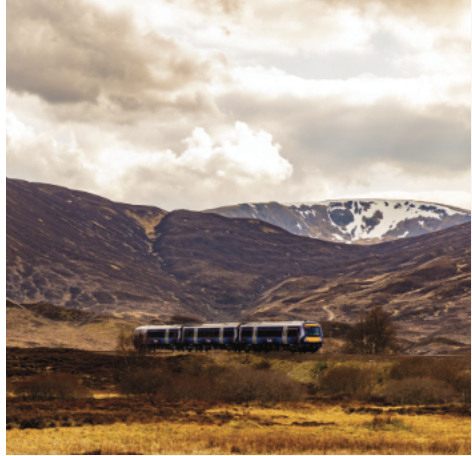
of a ScotRail train in the Cairngorms

Railway Mission is a registered charity in England and Wales (1128024) and in Scotland SC045897). A company limited by guarantee in England and Wales (06519565)