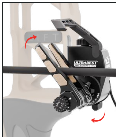
EASY LOCK & LOAD

With the convenient thumb lever, quickly load and cock the arrow into the capture position. The arrow is now fully contained.