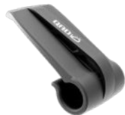
LIZARD TONGUE GUARD