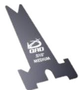
REPLACEABLE LIZARD TONGUE