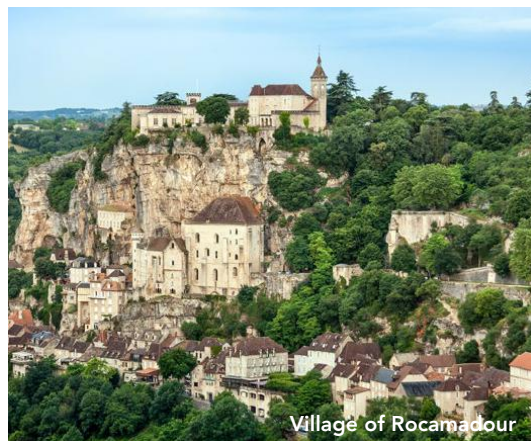
Village of Rocamadour

Activity Level: Activities are generally not very strenuous, however, we expect that guests can enjoy two hours or more of walking each day, are sure-footed on cobbled and unpaved surfaces, and can walk up and down stairs without assistance. The Château de Mercuès was constructed in the 13th century. While it has been updated to modern standards, its original structure means guests will find stone floors and steps that may not have railings. There is an elevator, but it does not access every floor.