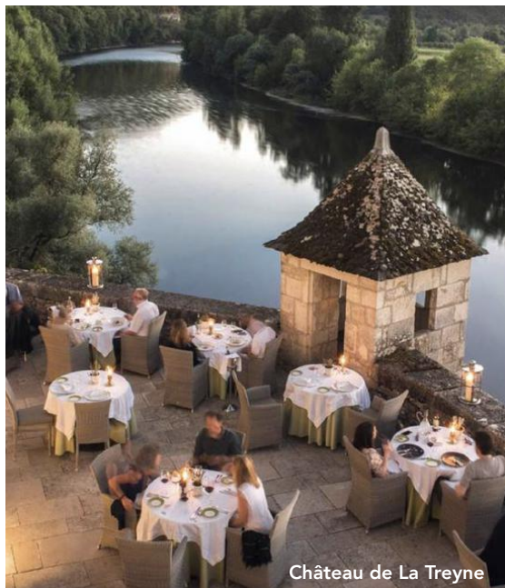
Château de La Treyne