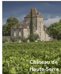
Château de Haute-Serre