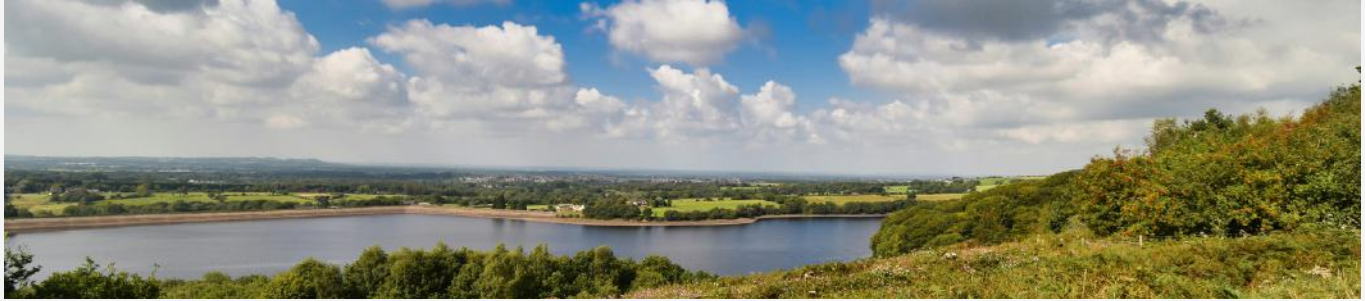
Central Lancashire Green Belt and Other Open Land Designations Review