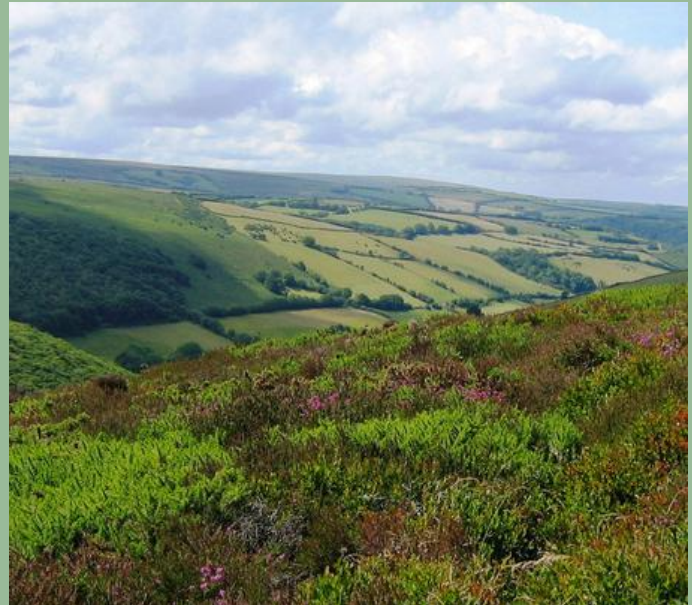
Exmoor Planning Policy Appraisal

LUC works closely and collaboratively with clients to cultivate a deep understanding of a project's context and needs, from national to local, to create strategic plans that set out ambitious and inspiring visions, clear objectives, and actionable plans.