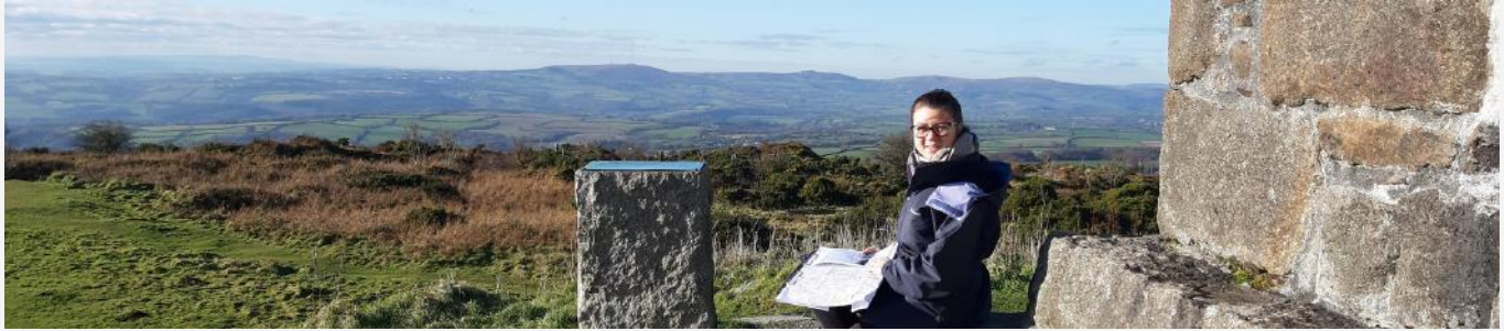
Tamar Valley LCA Review