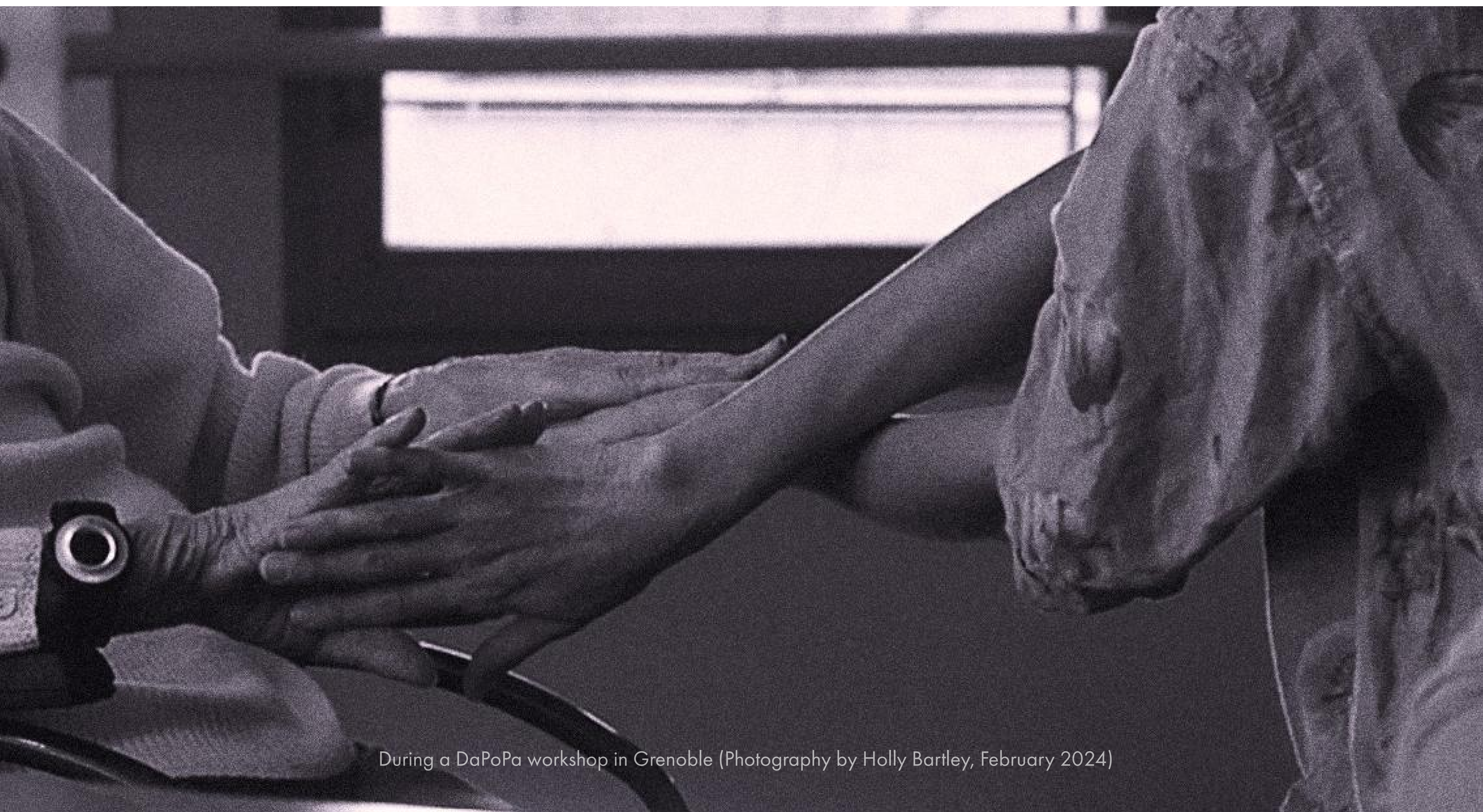
During a DaPoPa workshop in Grenoble (February 2024)