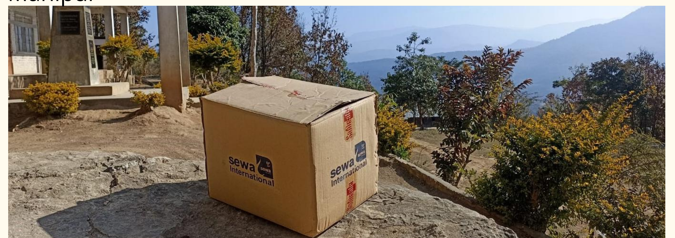
Sewa's help reached the village of Kharasom, district, Ukhrul, Manipur

Despite the religious conflict in Manipur recently, the three schools managed to stay operational due to the dedicated efforts of local teachers and the positive support from parents. However, the schools require funds for various purposes such as recurring expenditures, infrastructure development, educational materials, sports equipment, science and computer labs, and more. Sewa supports by raising funds through its Sponsor a Child program, and donors can participate in it by contributing INR 15,000 per student annually to help a child receive quality education. Donors can support this initiative by following this link: https://sewaua.org/SupporttoOjaShankarVidyalayaKharasomManipur