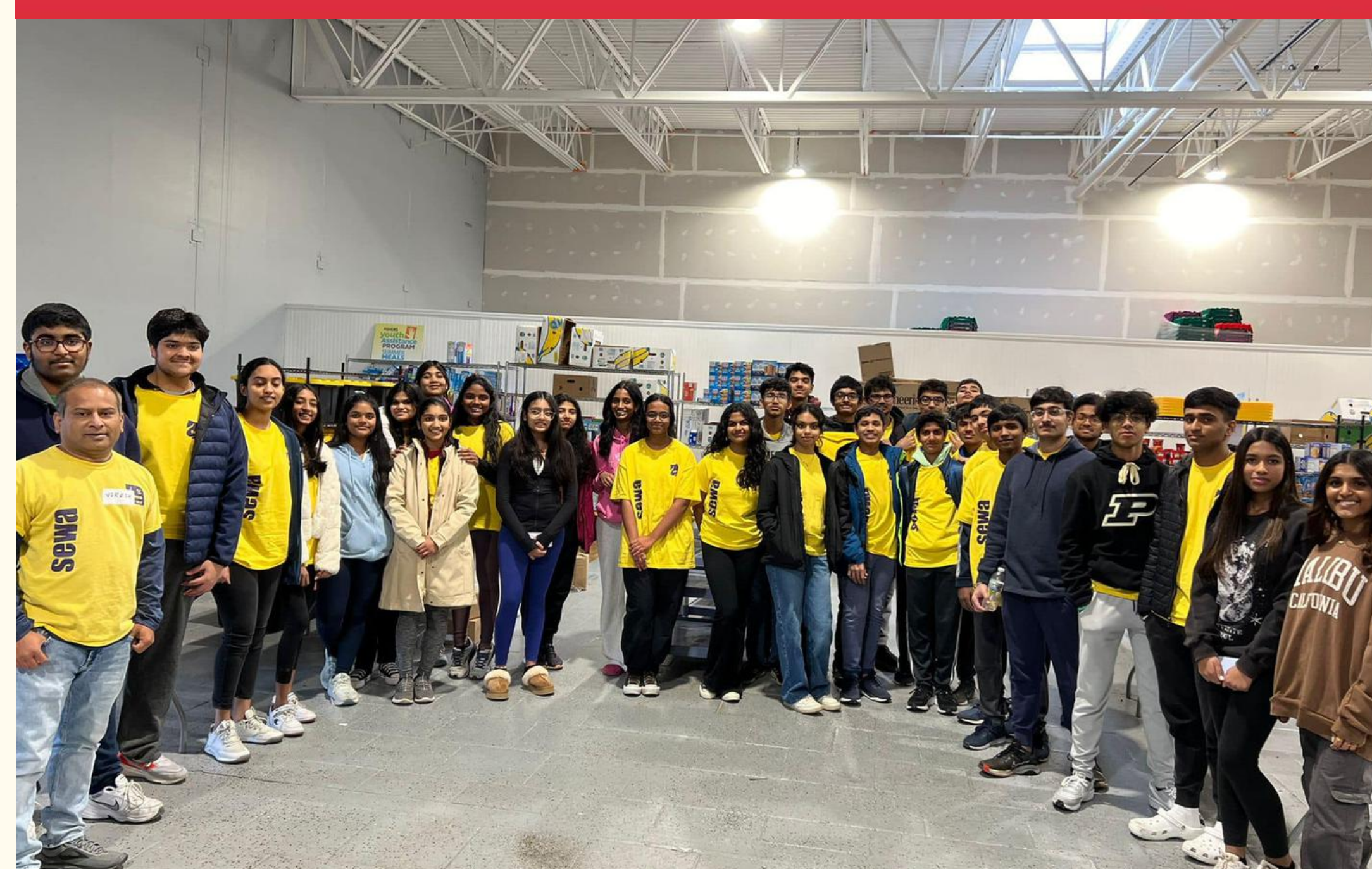
The Sewa Indianapolis chapter celebrated MLK Jr. Day

The Sewa Indianapolis chapter celebrated Martin Luther King Jr. Day as a National Day of Service. A team of 32 Sewa volunteers dedicated their day to unloading, sorting, and packing food items, contributing to the community's welfare. Sewa thanked Fishers Parks and the Fishers Indiana Government for providing this opportunity.