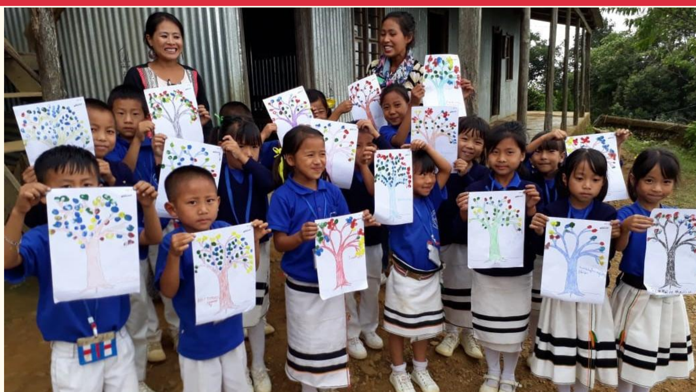
Kids of Pou Shankar Kane Vidyalaya, Tamenglong, Manipur displayed their art

Purva Seema Vikas Pratishthan (PSVP), a partner organization of Sewa International, runs three schools, including Oja Shankar Vidyalaya, catering to around 350 students from communities such as Rongmei, Zemei, Liangmei, Tangkhul, and the Kuki in the state of Manipur, bordering Myanmar. A team of 32 teachers supports these schools, offering classes ranging from pre-primary to the eighth grade, and over 2,500 students have benefitted.