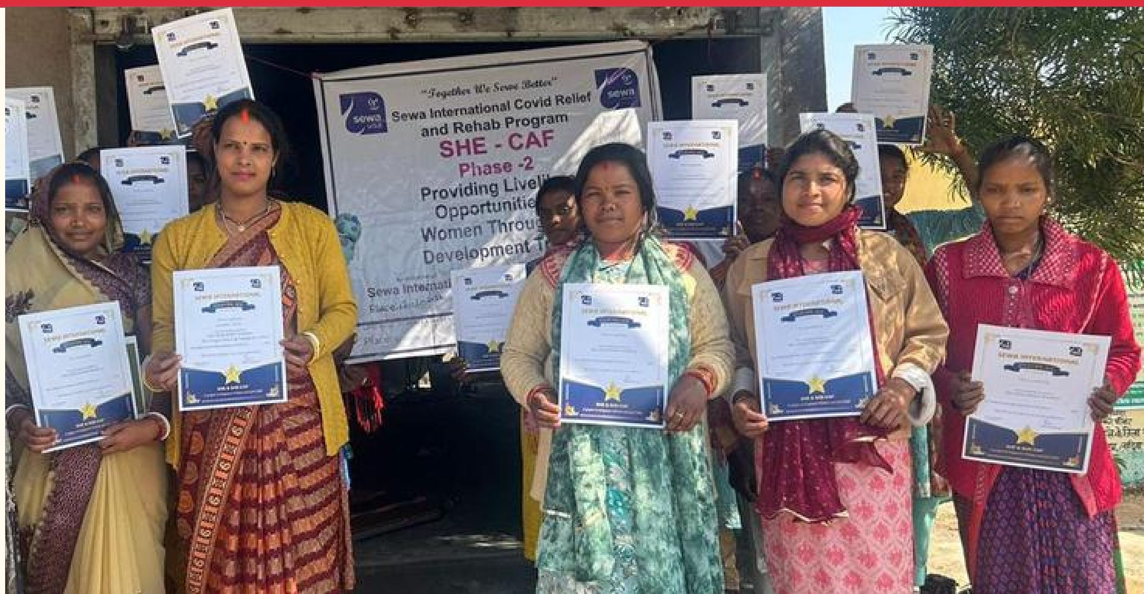
Beneficiaries of SHE-CAF Phase 2 program displayed course completion certificates

Sewa's Sanitation, Hygiene, and Empowerment Project for the Girl Child (SHE) and Covid Affected Families (CAF) Phase 2 program helped 4,328 people across seventeen states in India. Among them, 146 beneficiaries are undergoing training.