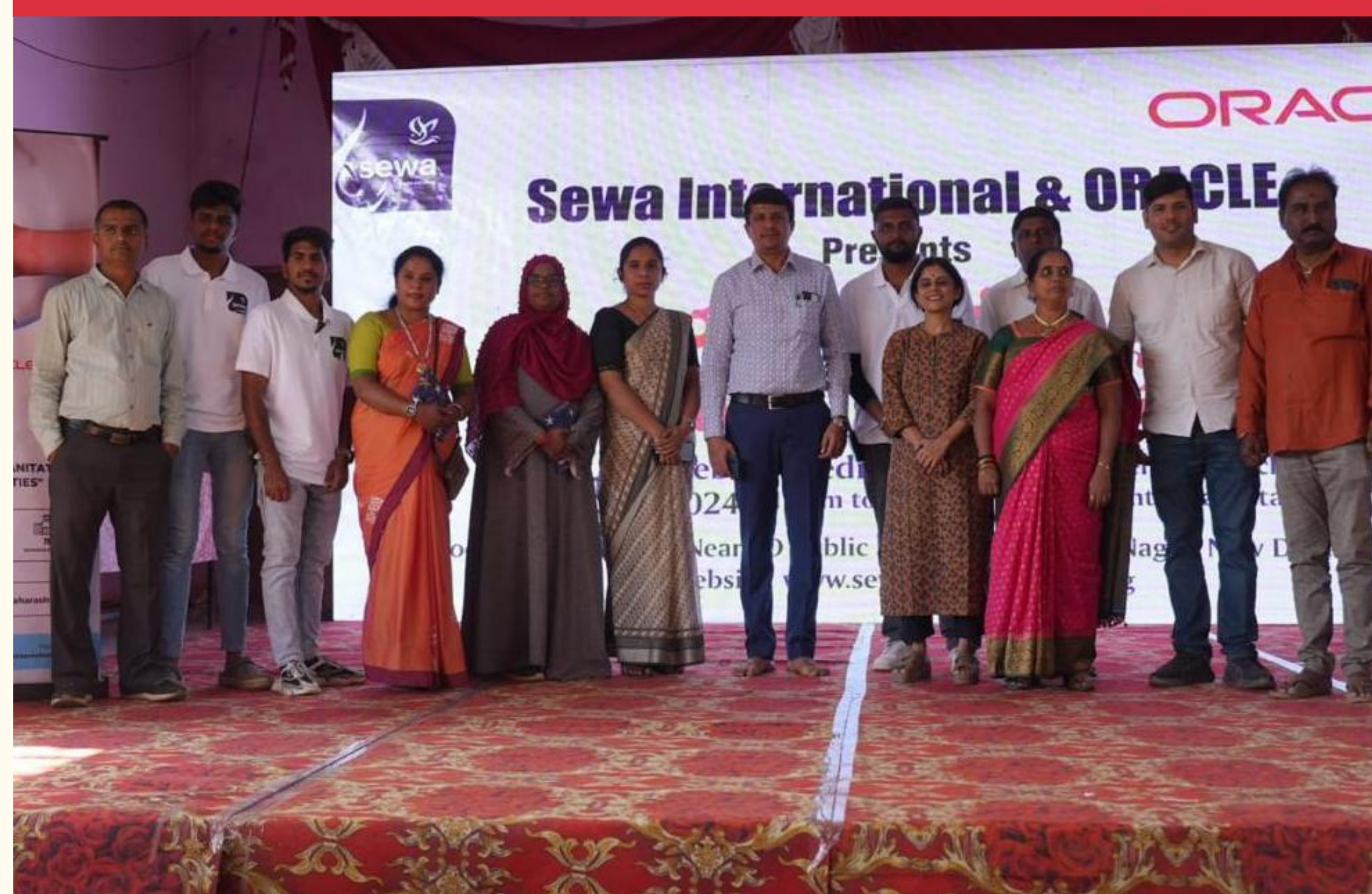
SHE team with guests at Yuva Mahotsav in Magadi, Karnataka

Over 1,200 students and teachers from twenty schools attended Yuva Mahotsav in Magadi, Karnataka. Oracle funds supported the event. Sewa's Sanitation, Hygiene, and Empowerment Project for the Girl Child (SHE) team organized a program with cultural performances by students, a walkathon, sapling plantation, and inspirational talks by distinguished guests. Additionally, the Sewa team shared insights on its collaboration with Oracle over the past four years.