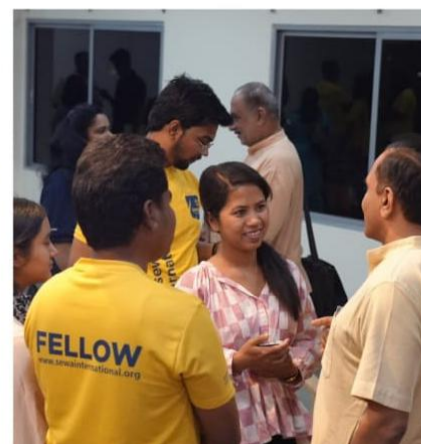
Participants engaged in one-on-one and group discussions with the resource persons during the workshop in Nagpur