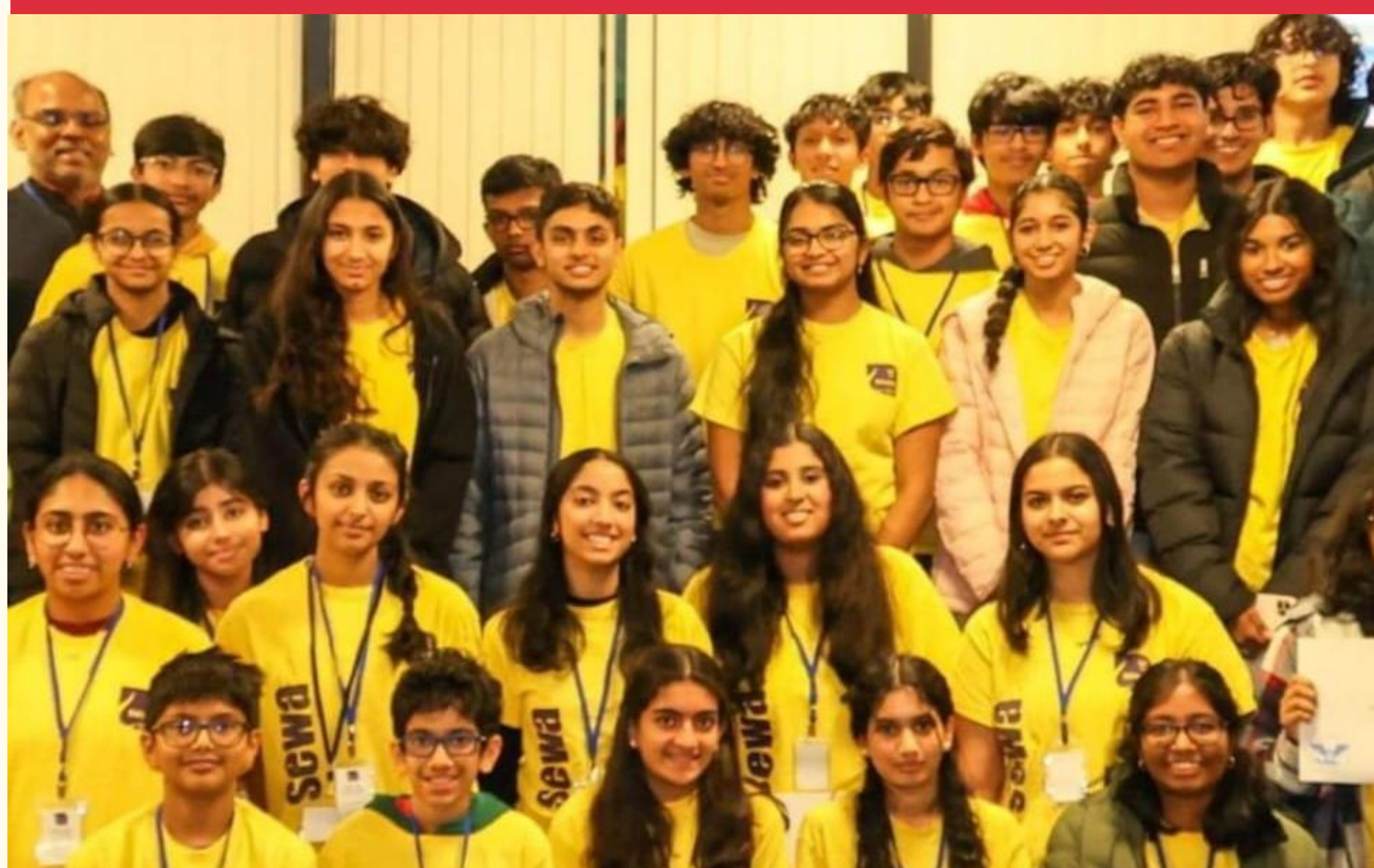
Sewa honored the 2023 LEAD youth volunteers in its Sewa Milan event in Schaumburg, IL

Sewa International celebrated its annual Sewa Milan event in Schaumburg, IL. The event honored the 2023 Leadership, Education, and Development (LEAD) youth volunteers and welcomed the new 2024 team. The 2023 LEAD volunteers dedicated over 7,200 hours of service, partnering with more than 40 community organizations in Chicagoland (Chicago Metropolitan Area). The event organizers thanked volunteers, parents, and community partners for their support in making Sewa initiatives successful.