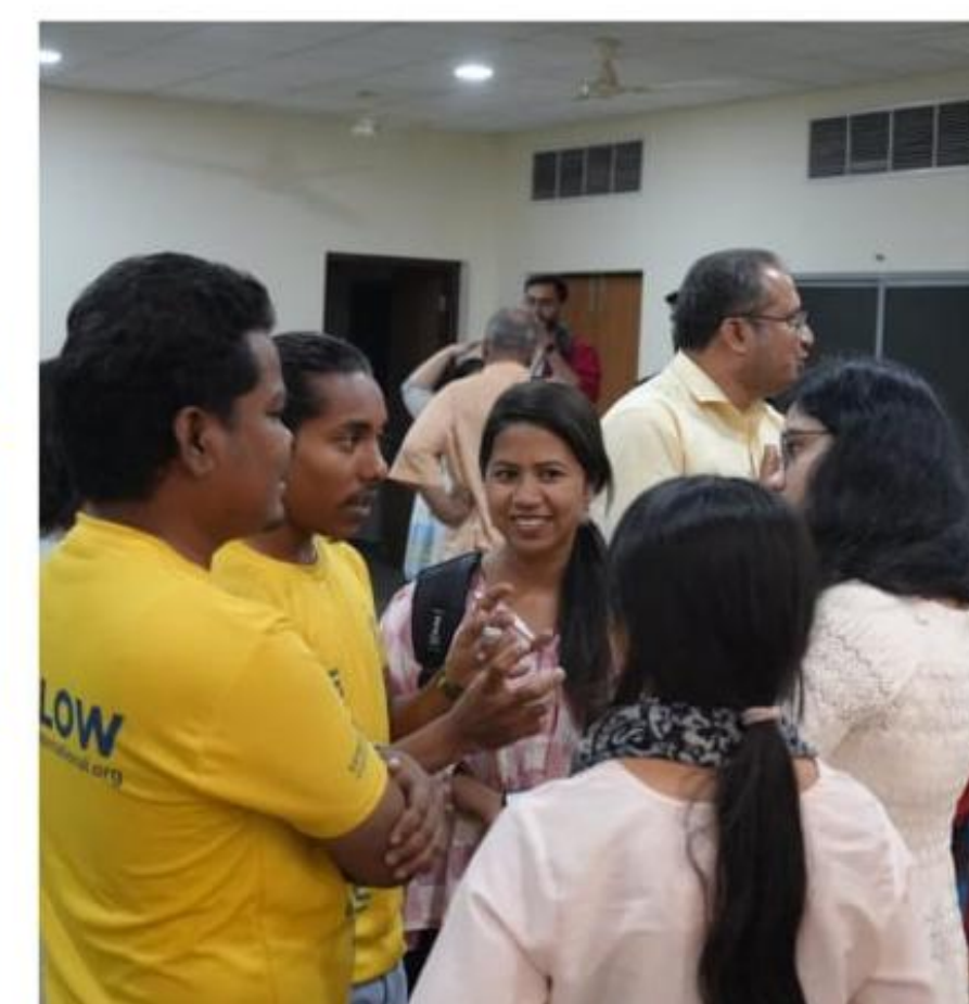
Interactive sessions, friendly chat and yummy food at the MOS Workshop, Nagpur