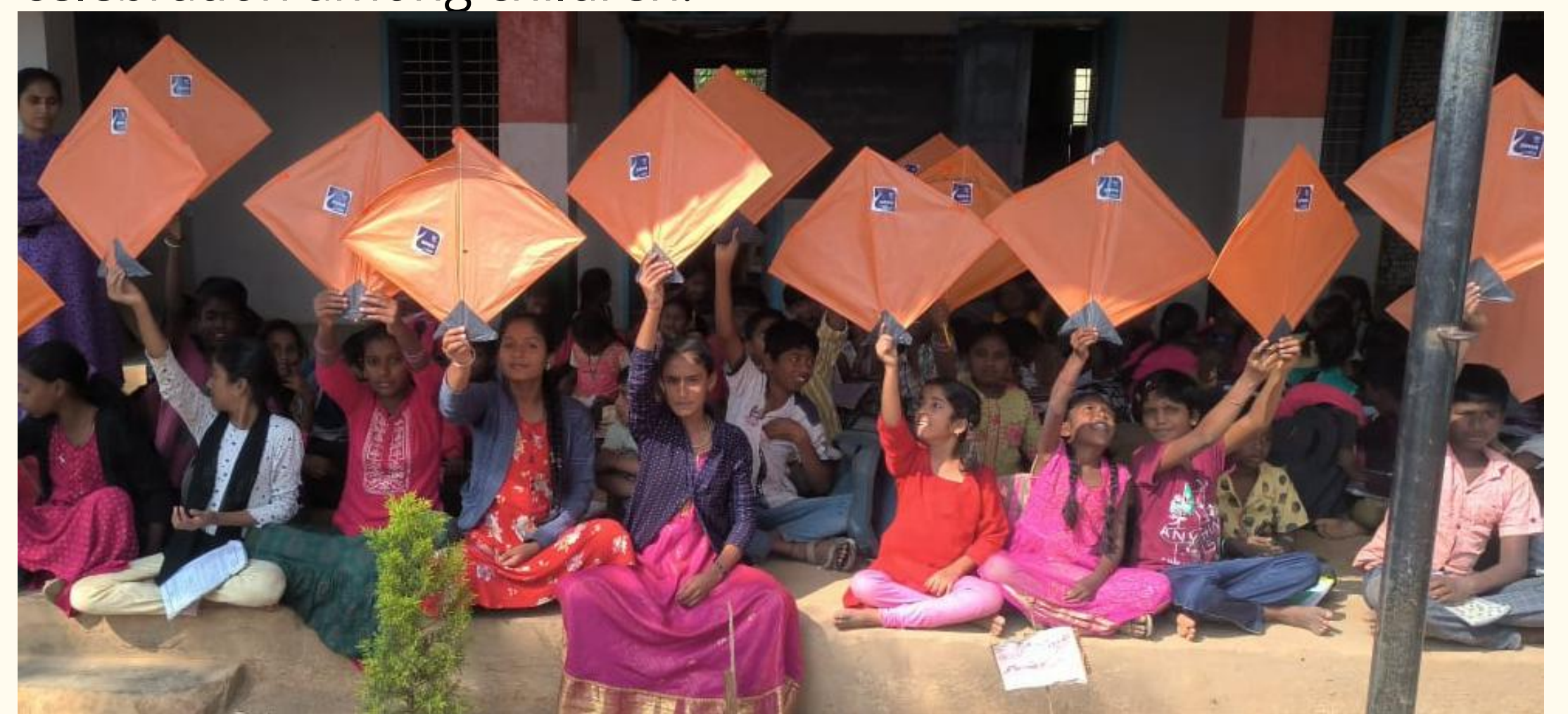
High school Students of Horanadu, Karnataka, displayed kites which they made for Makar Sankranti/Pongal festival

Beneficiaries of SHE and SHE-CAF programs celebrated Makar Sankranti and Pongal festivals through rituals, festivities, and kite-flying in Bihar, Chhattisgarh, Jharkhand, Tamil Nadu, and Karnataka, fostering cultural knowledge and the joy of celebration among children.