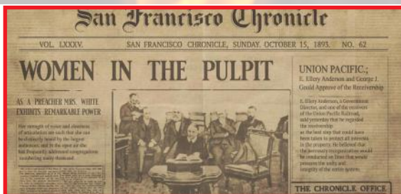
A newspaper article about Ellen G. White preaching in October 1893

The second focus of Ellen White's life was the Bible. The Bible played a foundational role in her personal experience and in her ministry. Her writings are full of Scripture. Her prophetic ministry was to uplift the Word of God. Mrs. White wrote, "You are not familiar with the Scriptures. If you had made God's word your study, with a desire to reach the Bible standard and attain to Christian perfection, you would not have needed the testimonies. It is because you have neglected to acquaint yourselves with God's inspired Book that He has sought to reach you by simple direct testimonies...The written testimonies are not to give a new light, but to impress vividly upon the heart the truths of inspiration already revealed." She also wrote this, "Let all prove their positions from the Scriptures and substantiate every point they claim as truth from the revealed Word of God..." Testimonies for the Church 2, 605; Evangelism, 256 In her last message to the entire Seventh-day Adventist Church at the General Conference Session in 1909 she held up her Bible and stated, "Brethren and sisters, I commend unto you this Book."