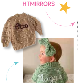
PERSONALISED, HANDMADE BABY CARDIGAN, WORTH UP TO £50 WWW.ETSY.COM/SHOP/ LOVELYLITTLECARDIS

CHILDREN'S MIRROR FROM HT MIRRORS, WORTH £149.99 WWW.ETSY.COM/SHOP/