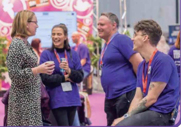
Exhibit the right way

The right audience and the perfect opportunity to shout about your business