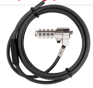
Single Serialised – ASP66GLX-S