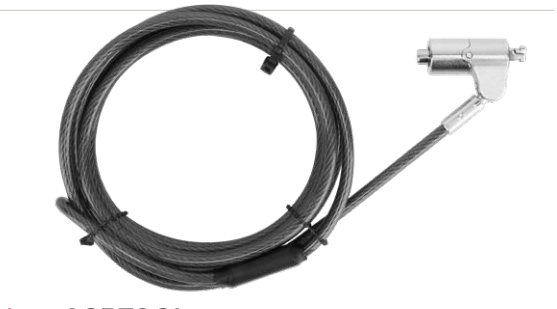
Single – ASP70GL