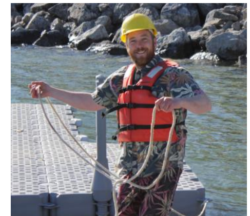
Floating dock installation!

For a worldwide map of Little Free Library locations go to https://littlefreelibrary.org