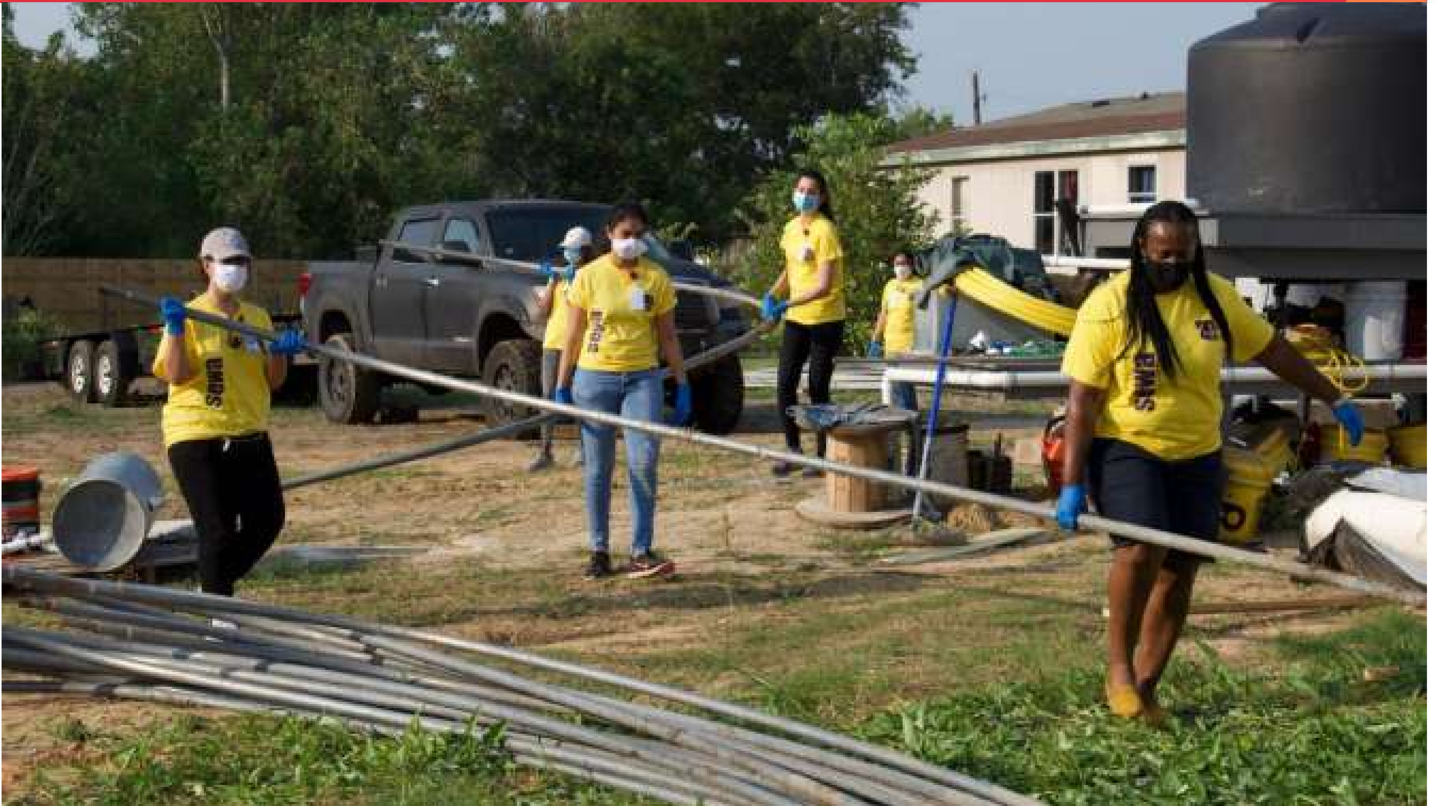
Sewa AmeriCorps Volunteers at work in Rosharon, TX. Sewa helped rebuild the Rosharon community after Hurricane Harvey hit Houston in 2017.

In its Partner Spotlight section of their 2021 annual report, OneStar Foundation has featured our Houston Chapter's AmeriCorps program. The report celebrates the resilience of Texas communities addressing the COVID-19 pandemic and winter storm Uri. The OneStar Foundation administers the AmeriCorps program in Texas.