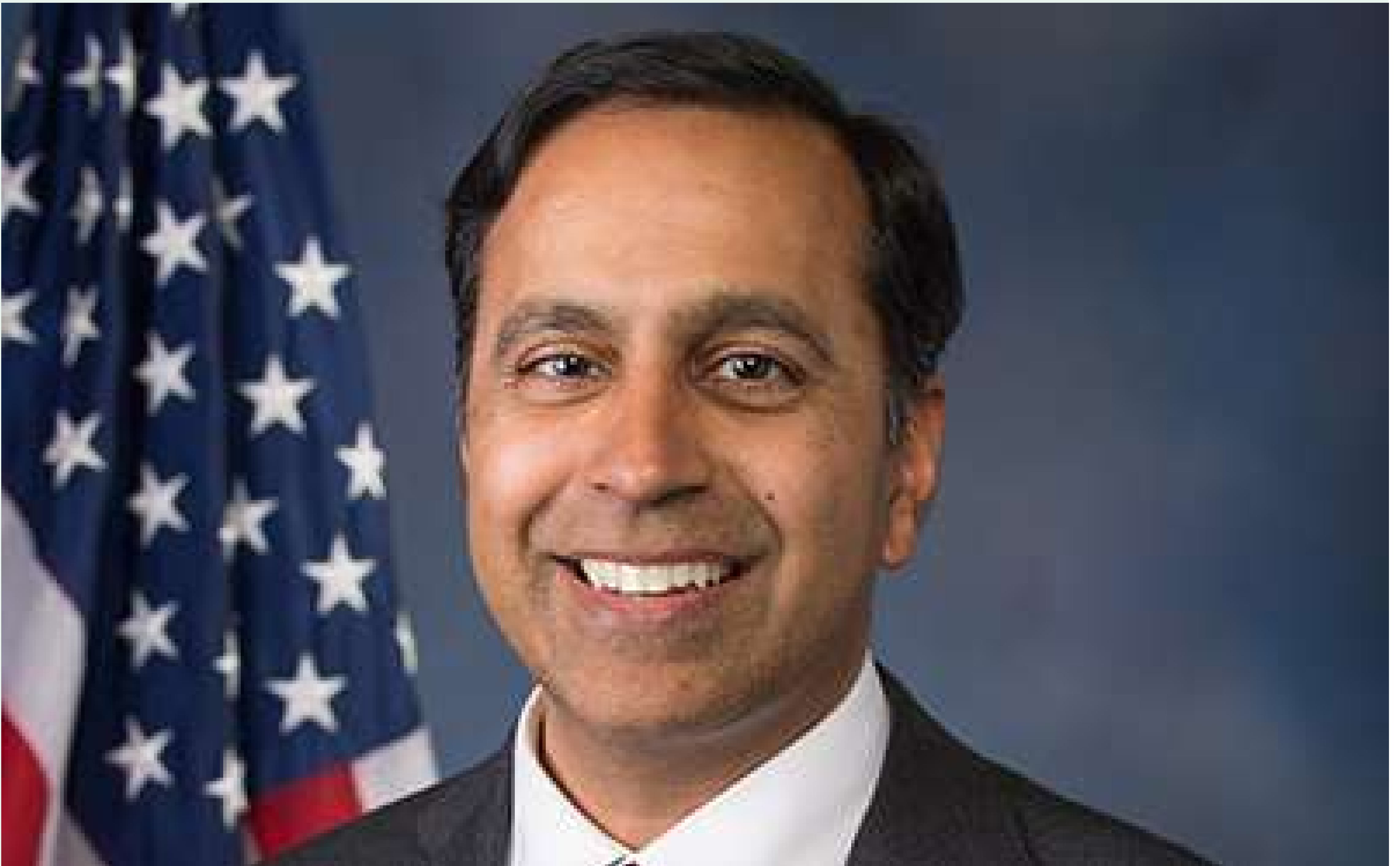
Congressman Raja Krishnamoorthi