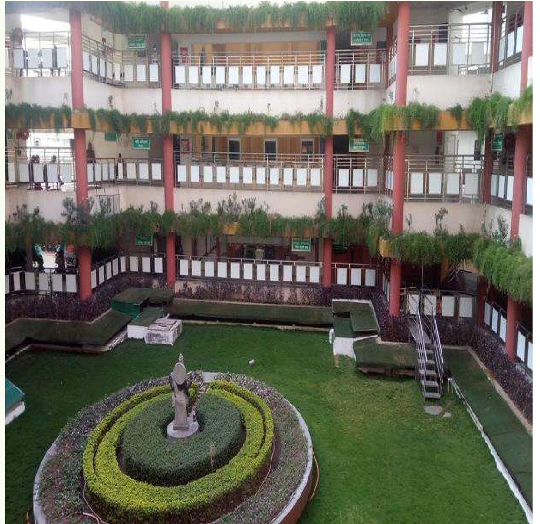
Dr. Hedgewar Multispecialty Charity Hospital in Sambhaji Nagar (Aurangabad)