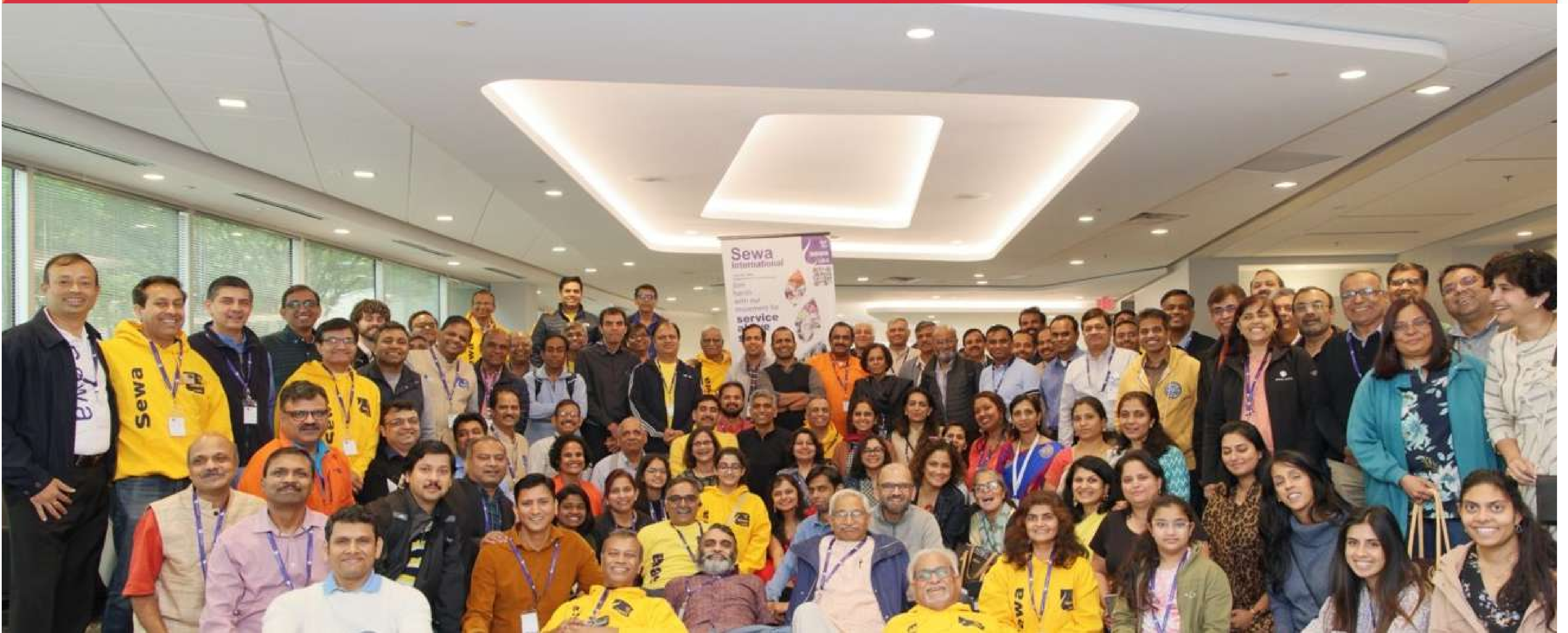
Attendees at the Sixteenth Annual Sewa Conference in Washington, DC.

In the backdrop of monumental relief work done during the COVID-19 pandemic in the US, and the second wave of the pandemic in India in 2020-2021, Sewa International volunteers gathered for Sewa's 16th Annual National Conference on May 7 and 8 in Washington, DC.