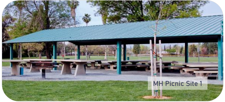
MH Picnic Site 1

Meadow Homes Park (MH) is a 12-acre park that offers a spray park featuring water play areas for tots, tweens, and teens during designated hours. Also located in the park are a playground, multi-use sports fields, and basketball courts.