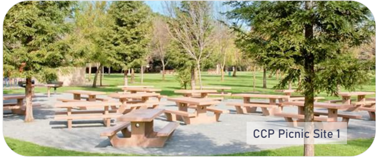
CCP Picnic Site 1