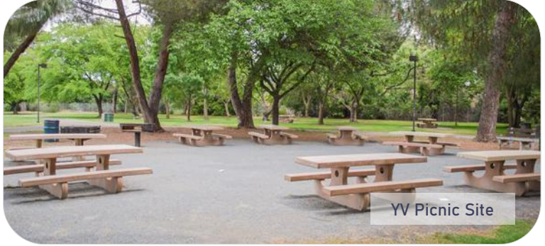
YV Picnic Site