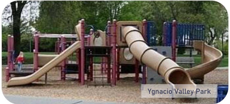
Ygnacio Valley Park