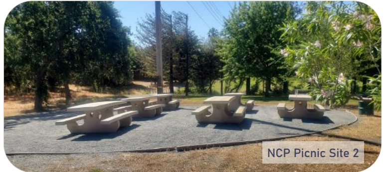
NCP Picnic Site 2