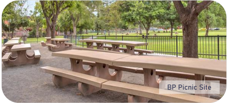
BP Picnic Site

Baldwin Park (BP) is an 18-acre park with a playground, softball fields, basketball courts, bocce ball courts, dog park, running water, and shade trees. Park features are open to general public and not guaranteed.