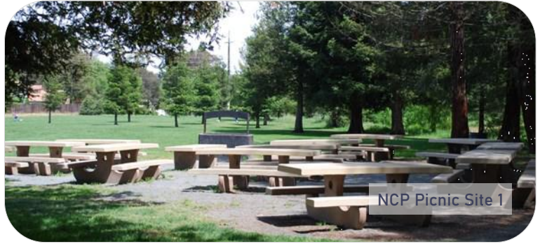
NCP Picnic Site 1

Newhall Community Park (NCP) is a 122-acre park along Galindo Creek with ball fields, ponds, dog park, a play structure, and open space trails for hiking and equestrian use.