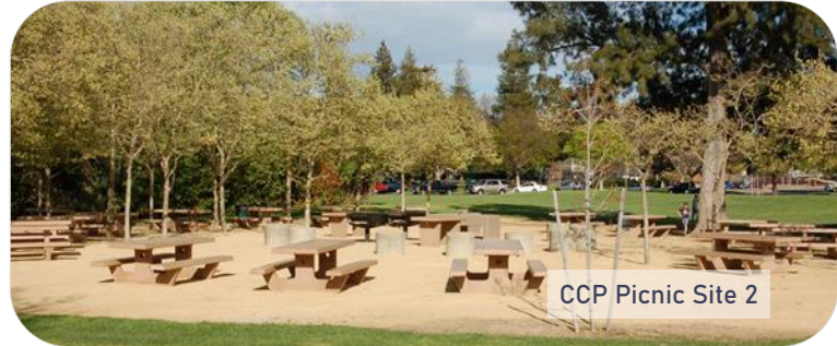
CCP Picnic Site 2