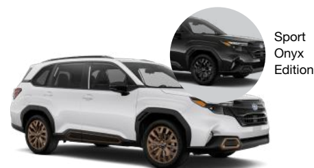
Sport Onyx Edition