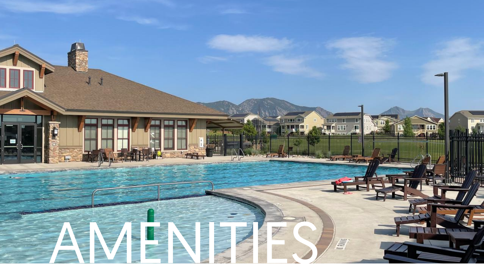
Candelas Swim & Fitness Center, Parkview

Candelas residents are lucky to choose from one of two LEED Gold Certified swim and fitness centers located in Townview and Parkview. Each center has a pool, clubhouse and gym. The clubhouses are available to rent for private parties for an additional fee.