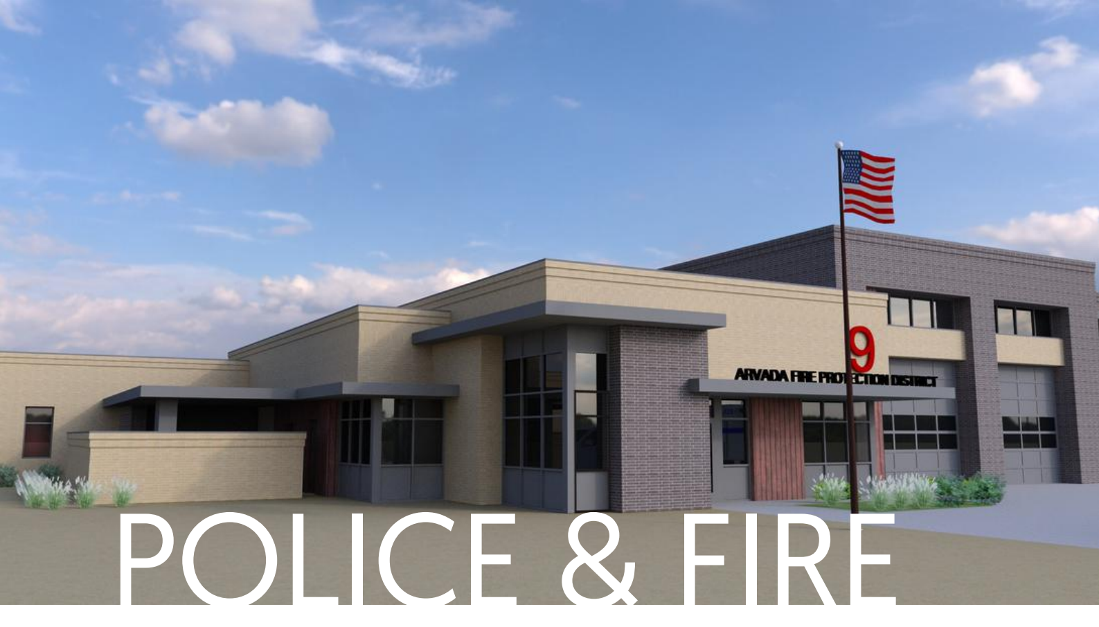
Arvada Fire Protection District Station 9 Architectural Rendering