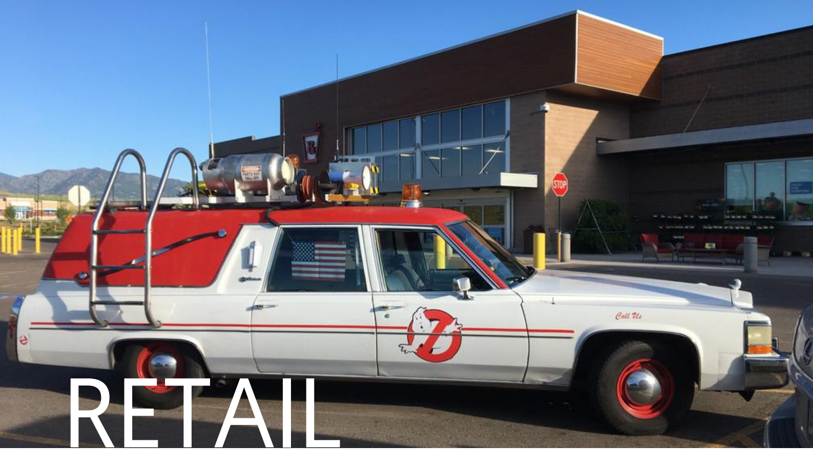
The Ghost Busters visit King Soopers.

Candelas residents have two shopping centers to choose from right in the neighborhood: 1) Candelas Marketplace, anchored by the largest King Soopers in the state of Colorado and 2) Candelas Point, anchored by Resolute Tap & Cellar and Bluegrass Lounge. Both offer a wide variety of shopping, dining and professional services.