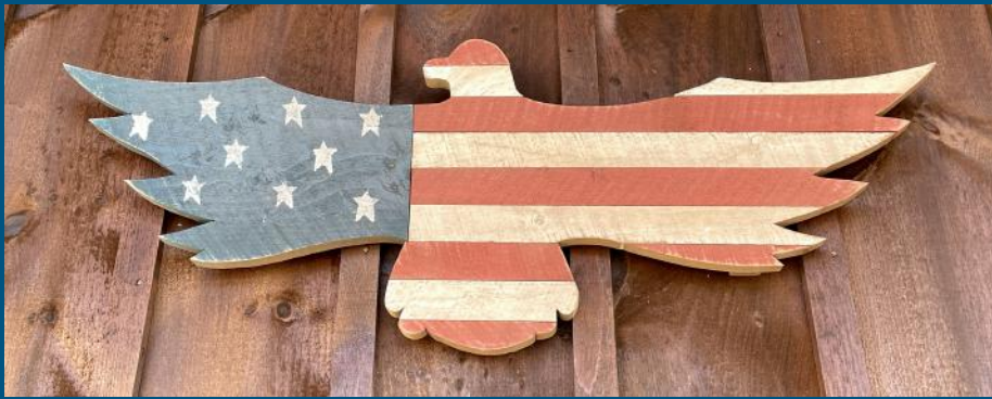
BALD EAGLE FLAG | 19" x 48" x 2" Item: 1153 | Wholesale: $25.50