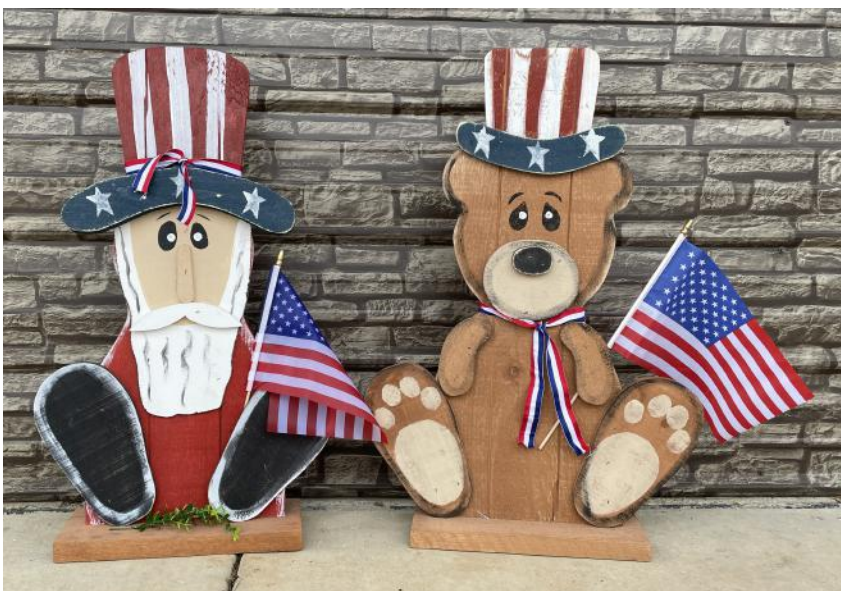
UNCLE SAM SITTER

1776 WELCOME FLAG 13" x 36" x 2" | Item: 1150 Wholesale: $19.00