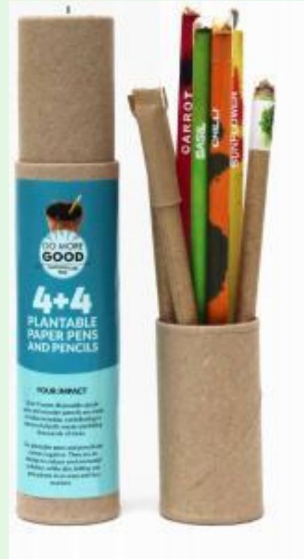
"Seed Pen & Seed Pencil Combo (5 Eco Seed Pens + 5 Seed Pencils)"