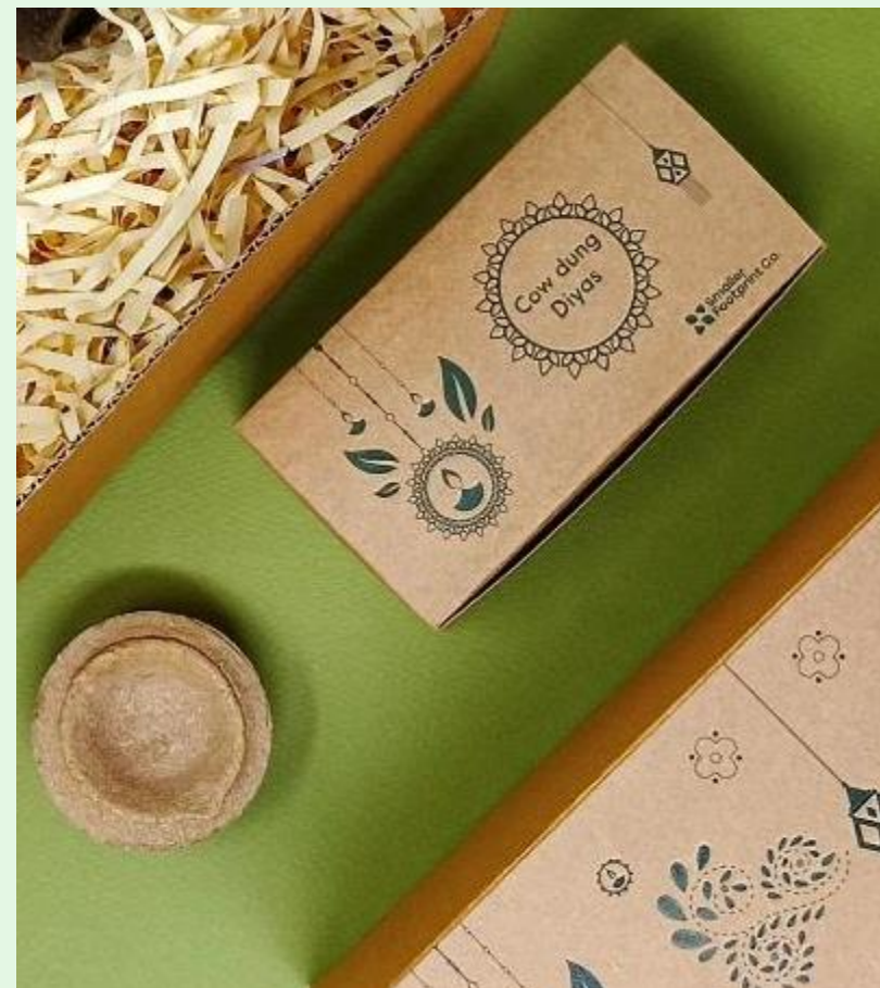
Organic Bio-degradable Cow Dung Diya