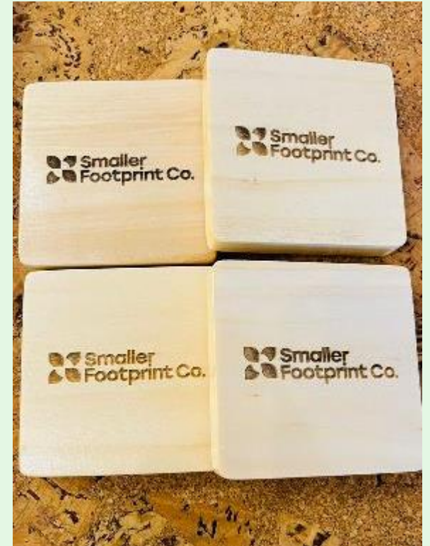
Wooden Coasters (Set of 4)