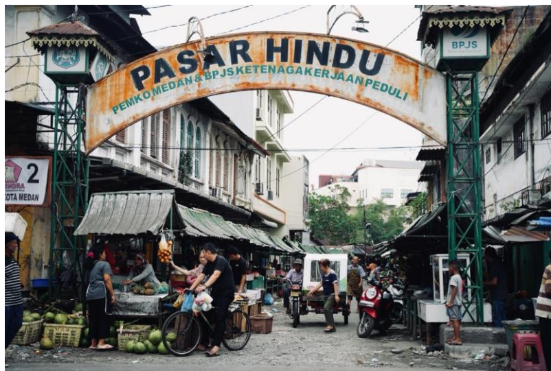
Another local attraction, Pasar Hindu, is famous for its markets selling food and groceries. A tip when visiting here: please speak in their language and you will get a good bargain.

A trip to Medan would not be complete without taking a stroll through Kesawan Square, considered to be the city's principal historical centre. Kesawan Square is a monument to Medan's eclectic background, with influences from Malay, Chinese, Indian, and Dutch cultures obvious at every turn. It is surrounded by buildings that date back to the colonial era and lively shops. The 'Tjong A Fie Mansion' is a magnificent example of Chinese-Dutch architecture, and visitors have the opportunity to admire its magnificence. Additionally, they may browse the colourful stalls of Pasar Raya, one of the oldest markets in Medan. In addition, Kesawan Square is home to a wide variety of street vendors that serve traditional snacks and beverages, making it the ideal location to enjoy the flavours of Medan while taking in the bustling atmosphere of this dynamic region.