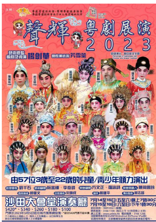
Performance by Children and Young Cantonese Opera Performers