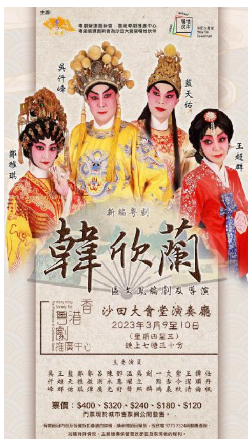
Newly Composed Cantonese opera Work

Apart from organizing large-scale promotional events related to Cantonese opera, the association also consistently mobilizes and produces numerous professional performances. They collaborate with over 13 local Cantonese opera troupes each year to stage more than 60 professional Cantonese opera performances at the Sha Tin Town Hall. The productions not only present traditional Cantonese opera works, but also innovative new Cantonese operatic works. The aim is to provide a fresh experience for veteran fans and at the same time actively engage with younger audiences, thus expanding and passing on the art and culture of Cantonese opera performances. In 2023, the association collaborated with thirteen Cantonese Opera troupes (in alphabetical order): Alis Art Centre, Eurana Operatic Arts Assembly, Evergreen Opera Troupe, Forever Excellence Opera Troupe, Hong Kong Society For The Promotions of Cantonese Opera, Jong Yuen Hung Cantonese Opera Troupe, Lung Kui Kam Yuen Court, Ming Fai Cantonese Opera Association, Nan Art Workshop, Prosperity Cantonese Opera Production Studio, Sum Mei Cantonese Opera Songs Association, Sing Fai Cantonese Opera Promotion Association Limited, and Wing Cheong Cantonese Opera Promotion Association. They produced a total of 61 performances, reaching 44,500 audience, with an attendance rate of over 70% in average.