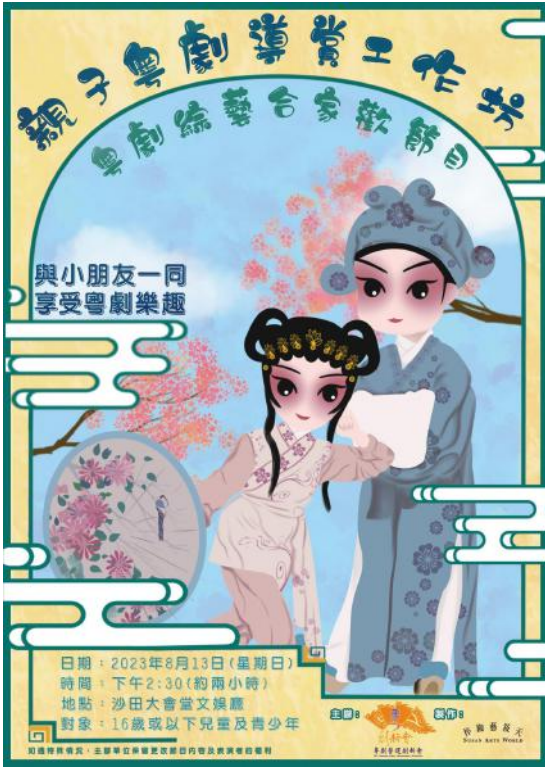
Cantonese Opera Appreciation Workshop for Families