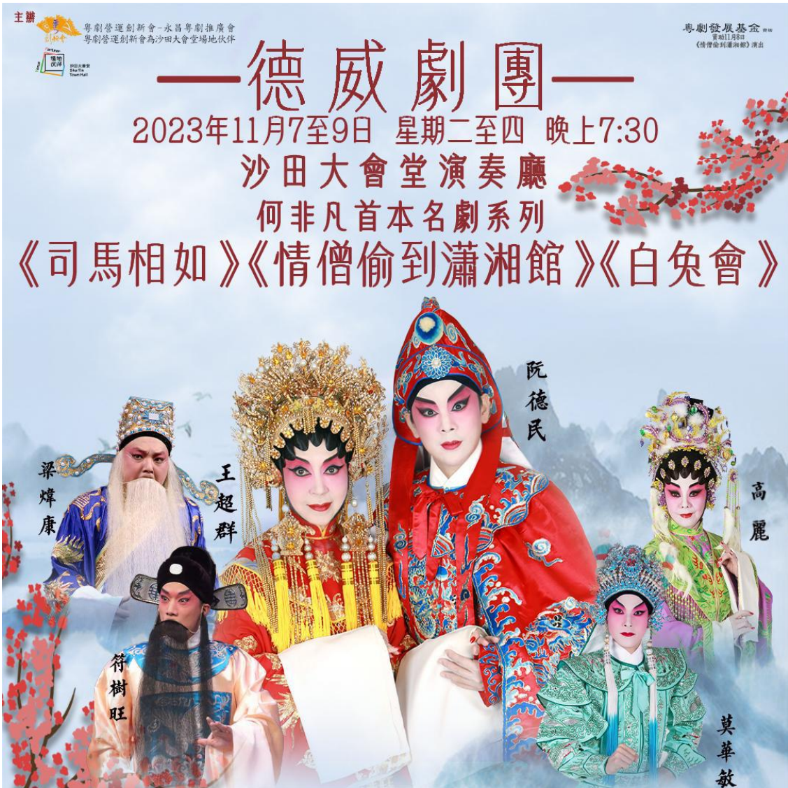
Traditional Cantonese Opera Works