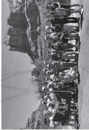
Traveling Aggies on Obridge's Southwest National Parks 2022 travel program.

Traveling Aggies The Association of Former Students 505 George Bush Drive College Station, TX 77840