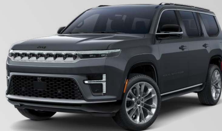
Limited Reserve in Baltic Gray Metallic