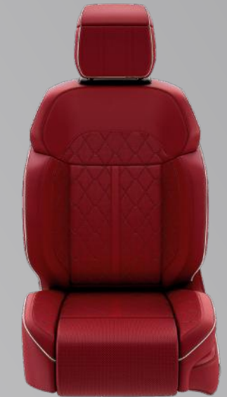
Ventilated Palermo Leather-Trimmed with Quilted Registered Perforations and Ruby Red / Burnished Copper / Smoke Accent Stitching, Arctic Piping - Global Black / Ruby Red (Late Availability)