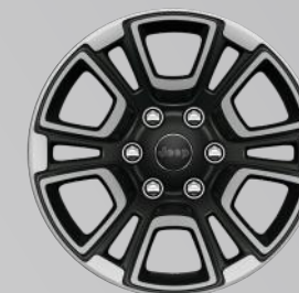
18-inch Machined-Face Aluminum with Black Noise Pockets (Late Availability)