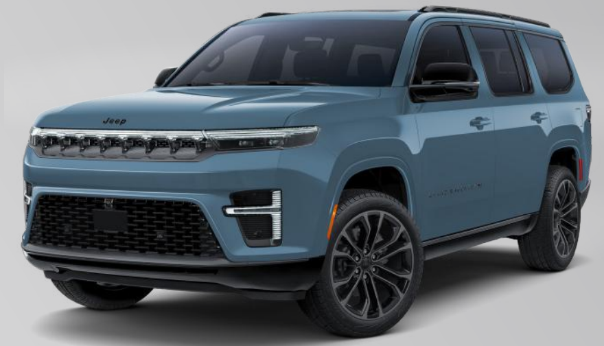
Summit Obsidian in Steel Blue