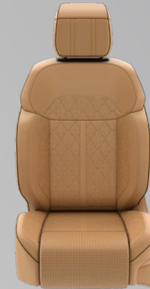
Ventilated Palermo Leather-Trimmed with Quilted Registered Perforations and Tupelo / Terra Cotta Accent Stitching, Global Black Piping — Tupelo / Global Black (Standard)