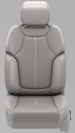
Ventilated Nappa Leather-Trimmed with Axis II Perforations and Sea Salt / Basil Accent Stitching – Sea Salt / Global Black (Standard)