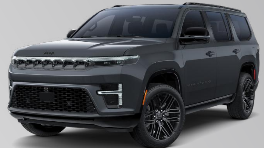
Limited Reserve with Black Appearance Package in Baltic Gray Metallic