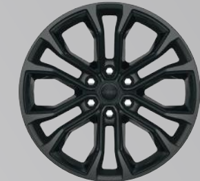
22-inch Aluminum Painted Black Noise with Gloss Black Inserts (Standard with Black Appearance Package)