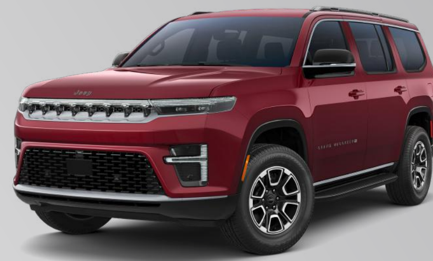
Grand Wagoneer in Velvet Red Pearl