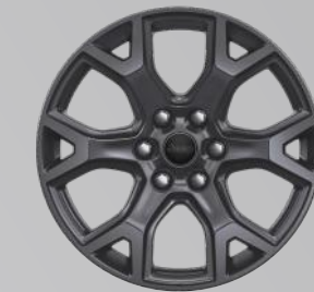
20-inch Aluminum Painted Luster Gray Metallic (Standard)