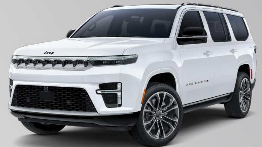
Summit in Bright White