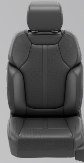
Ventilated Nappa Leather-Trimmed with Axis II Perforations and Global Black / Smoke Accent Stitching – Global Black (Standard)