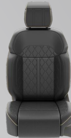
Ventilated Palermo Leather-Trimmed with Quilted Registered Perforations and Global Black / Terra Cotta Accent Stitching, Sea Salt Piping — Global Black (Standard)