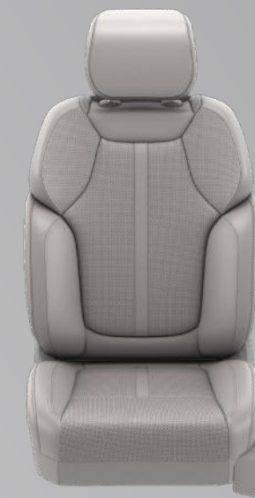
Ventilated Capri Leather-Trimmed with Axis II Perforations and Sea Salt / Basil Accent Stitching – Sea Salt / Global Black (Standard)