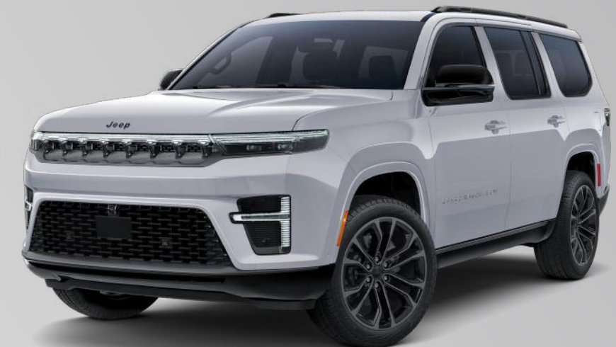
Summit Reserve with Black Appearance Package in Silver Zynith