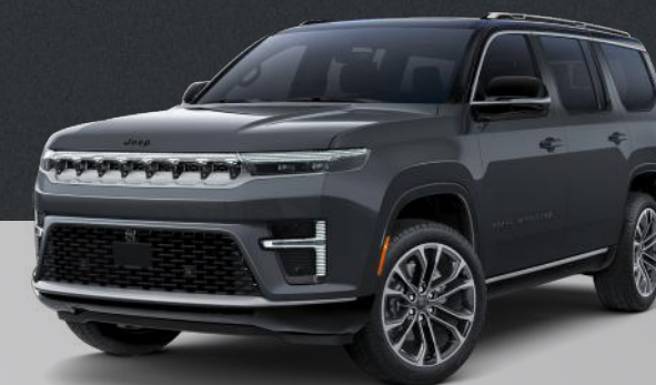
Baltic Gray Metallic