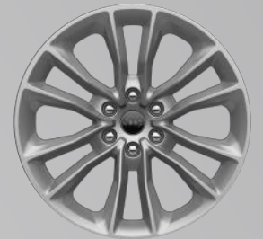
22-inch Painted Satin Carbon Aluminum (Available)