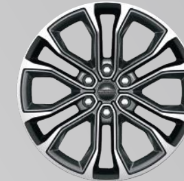
22-inch Machined-Face Aluminum with Black Noise Pockets and Textured Inserts (Standard)