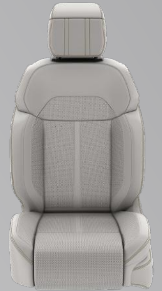
Ventilated Nappa Leather-Trimmed with Axis II Perforations and Sea Salt / Cognac Accent Stitching – Sea Salt / Global Black (Standard)