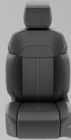
Ventilated Nappa Leather-Trimmed with Axis II Perforations and Global Black / Smoke Dual Accent Stitching – Global Black (Standard)