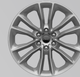
22-inch Painted Satin Carbon Aluminum (Late Availability)