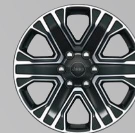
20-inch Machined-Face Aluminum with Gloss Black Pockets (Available; Required Option at Launch)