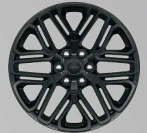
22-inch Painted Gloss Black Aluminum (Standard)