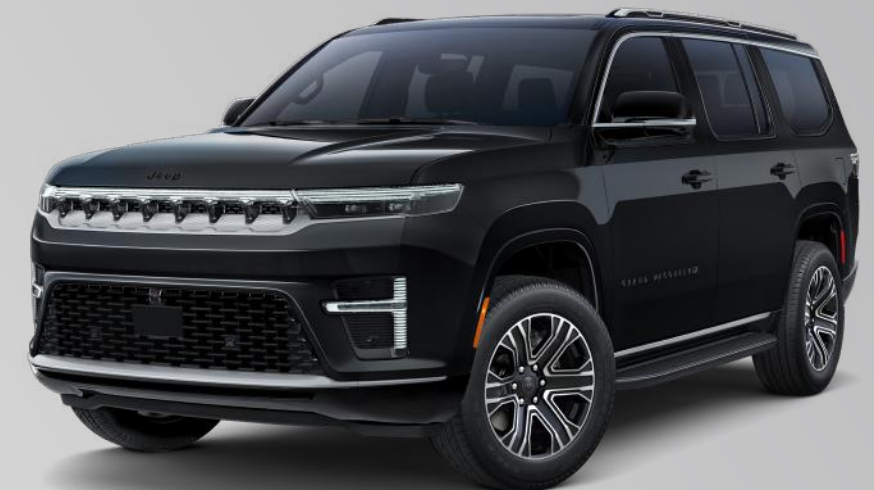
Limited in High-Gloss Black