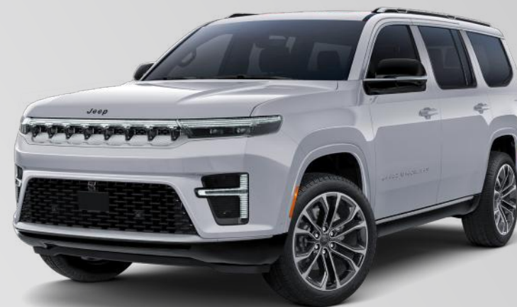
Summit Reserve in Silver Zynith