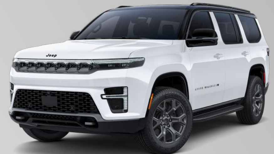
Upland in Bright White