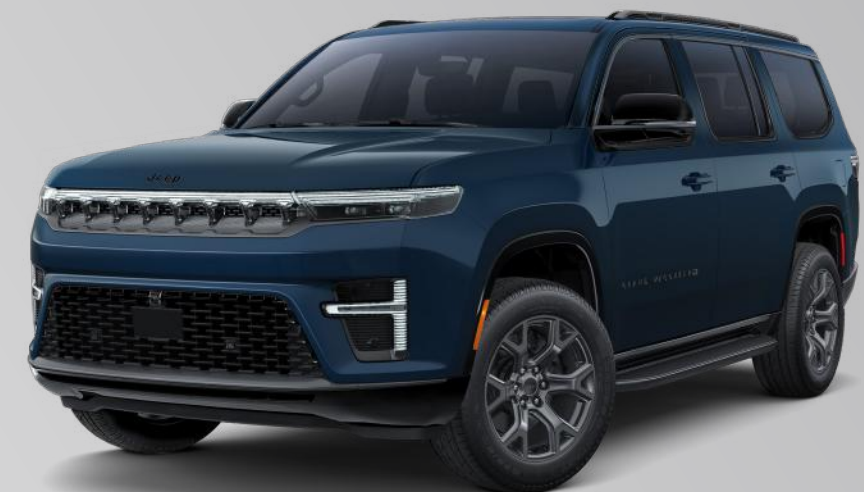
Limited Altitude in Fathom Blue Pearl