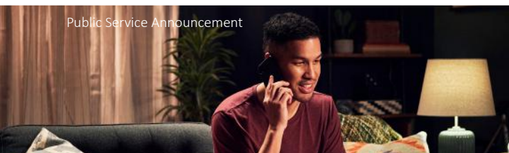
Public Service Announcement

The PSA and related stories can be viewed at kidney.ca/withyou .