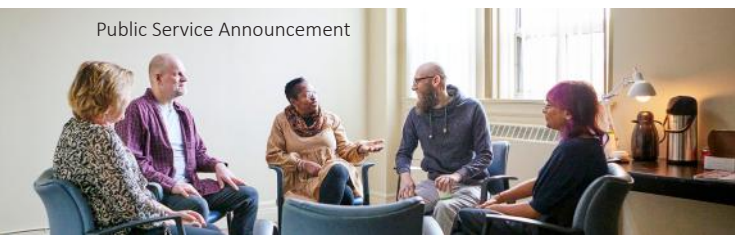
Public Service Announcement