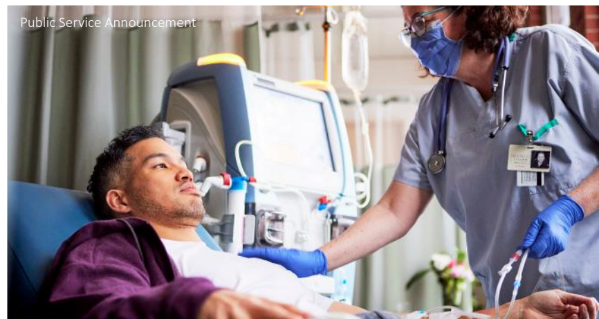
Public Service Announcement