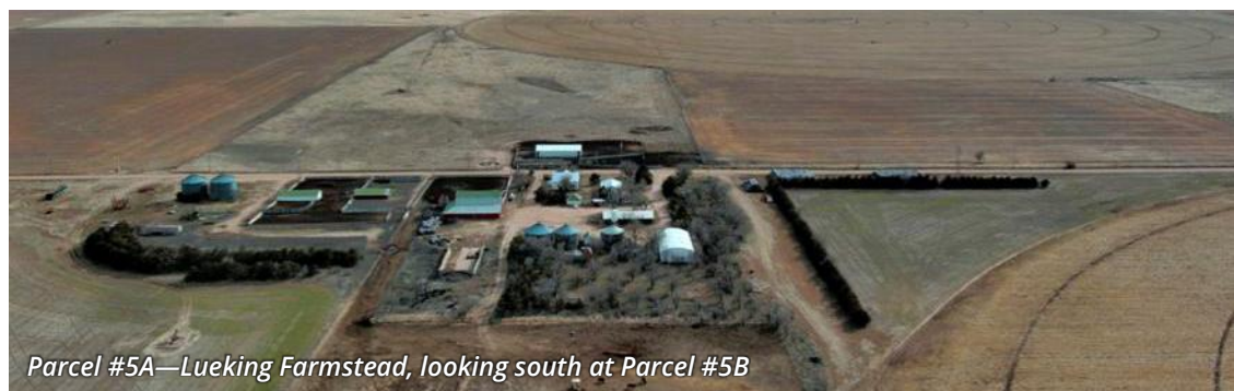
Parcel #5A—Looking Farmstead, looking south at Parcel #5B