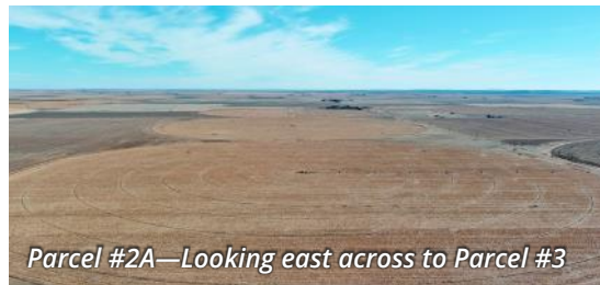
Parcel #2A—Looking east across to Parcel #3