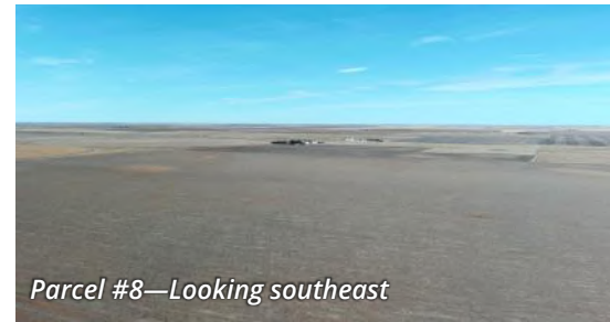
Parcel #8—Looking southeast