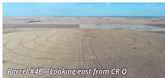
Parcel #4B—Looking east from CR Q