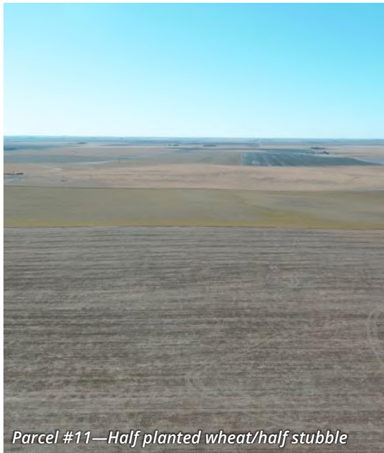
Parcel #11—Half planted wheat/half stubble