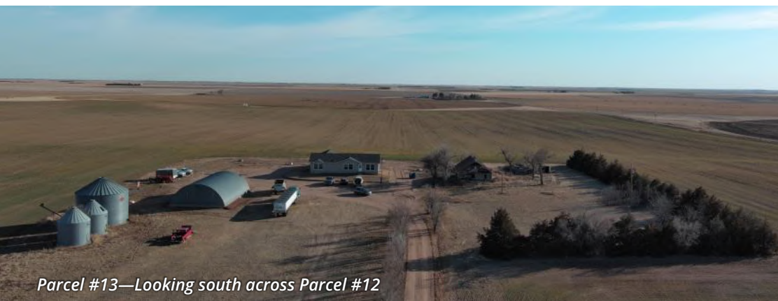
Parcel #13—Looking south across Parcel #12

6.2± ac improvement site Located on Co Rd 56 (north) R/E Taxes: $1,293.00 Improvements: House w/ garage & basement, shop, bins, domestic well & septic; Surveyed Address: 11132 CR 56, Yuma, CO