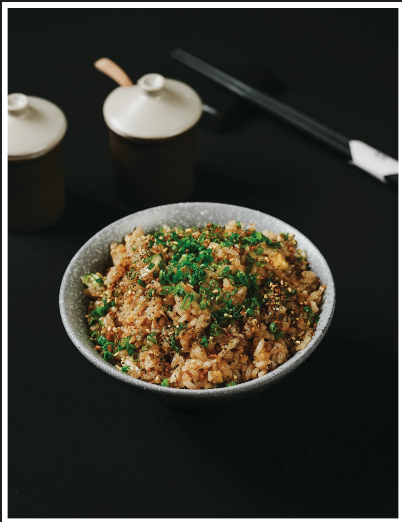
Garlic & Egg Yakimeshi