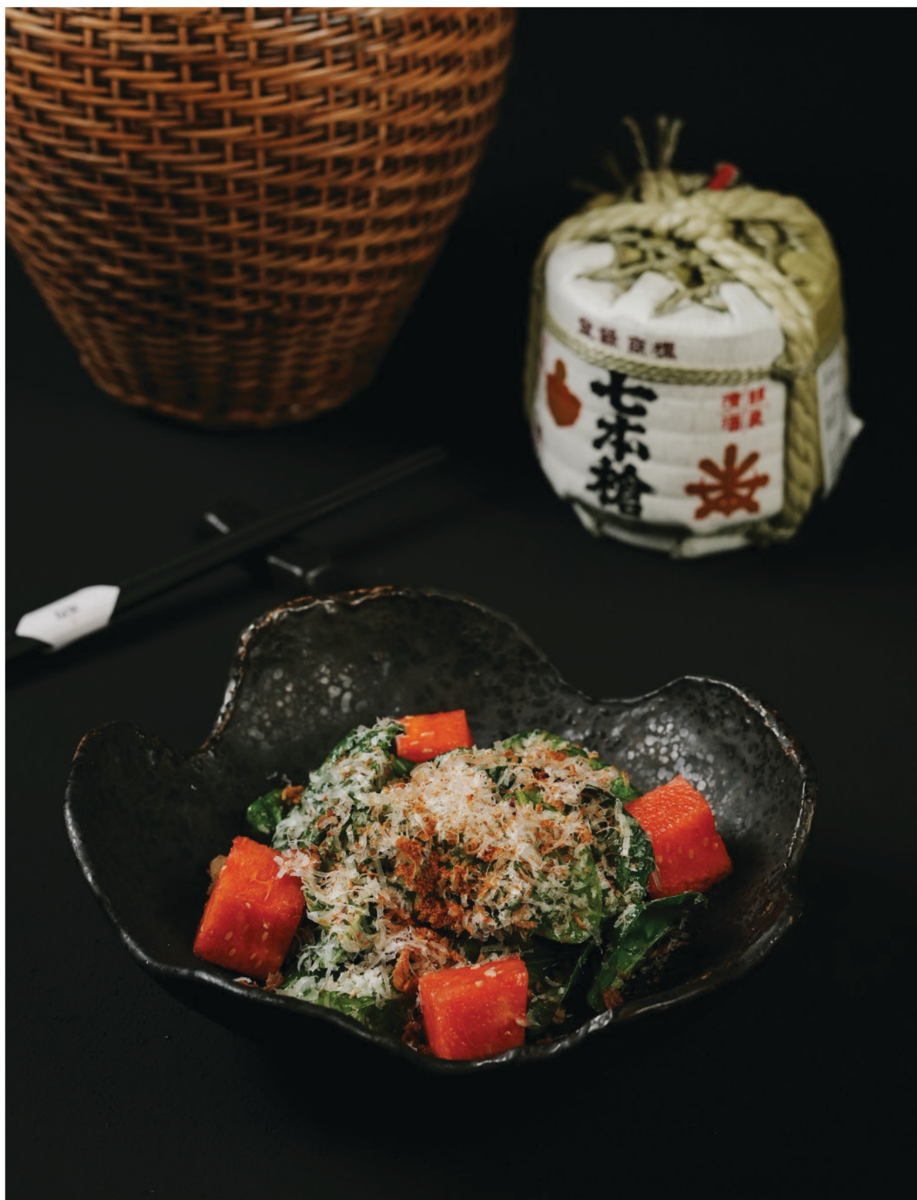
Baby Spinach & Compressed Watermelon