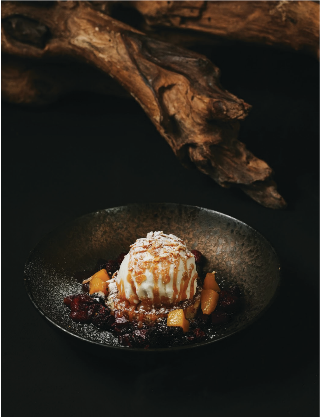
Vanilla Toffee Toast