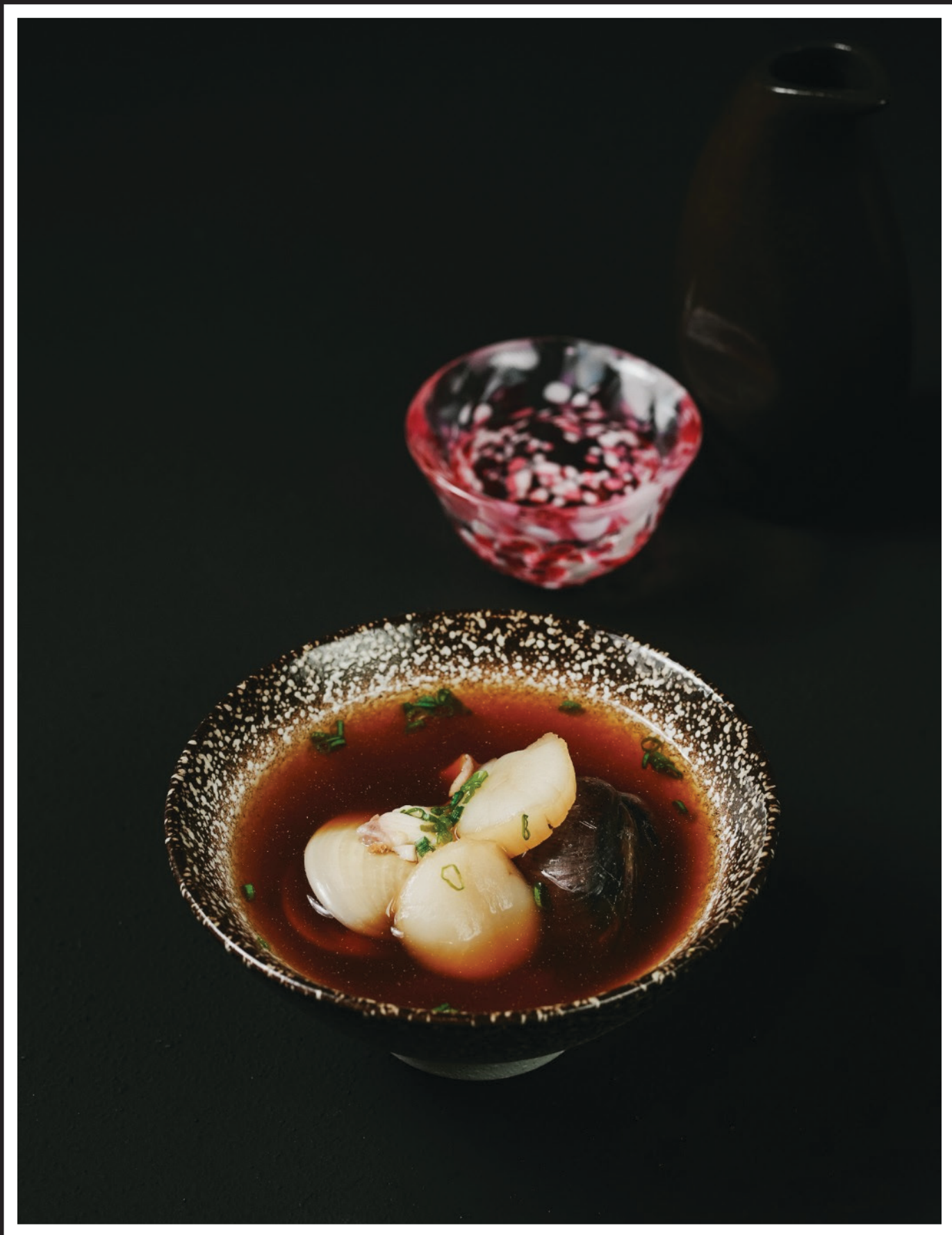
Seafood Clear Soup