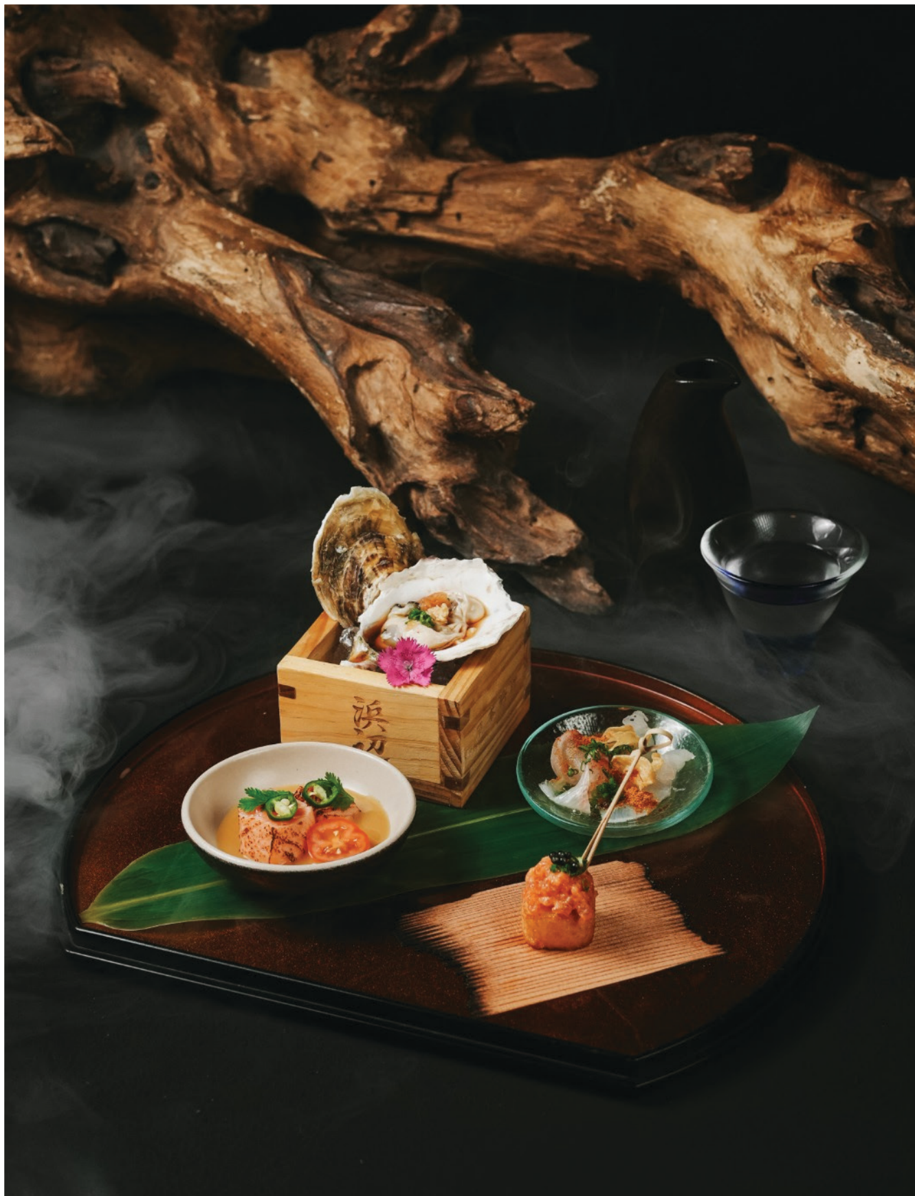
Sashimi 4 Ways