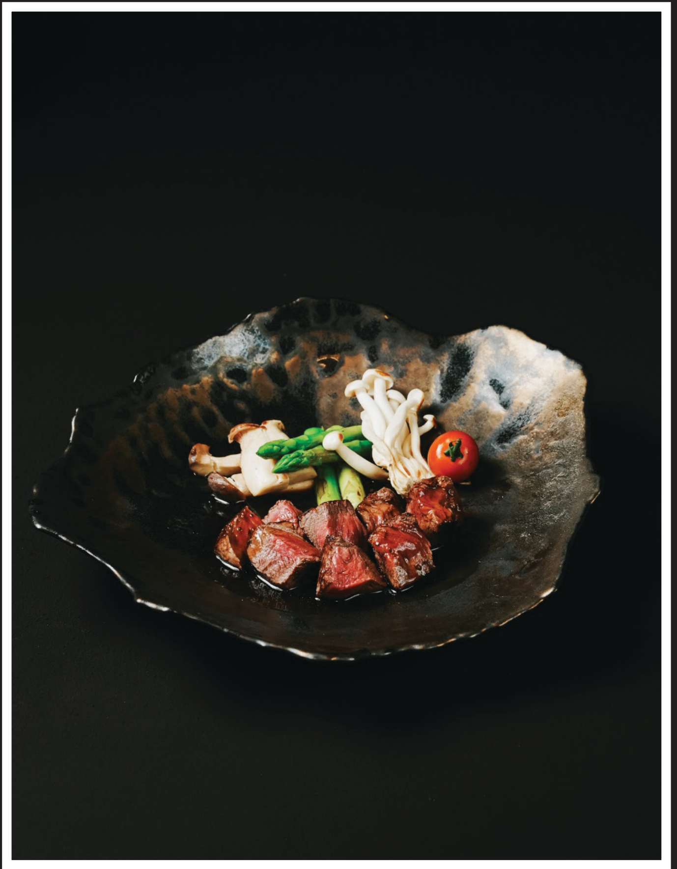
31-Day Dry Aged Sher Wagyu Tenderloin