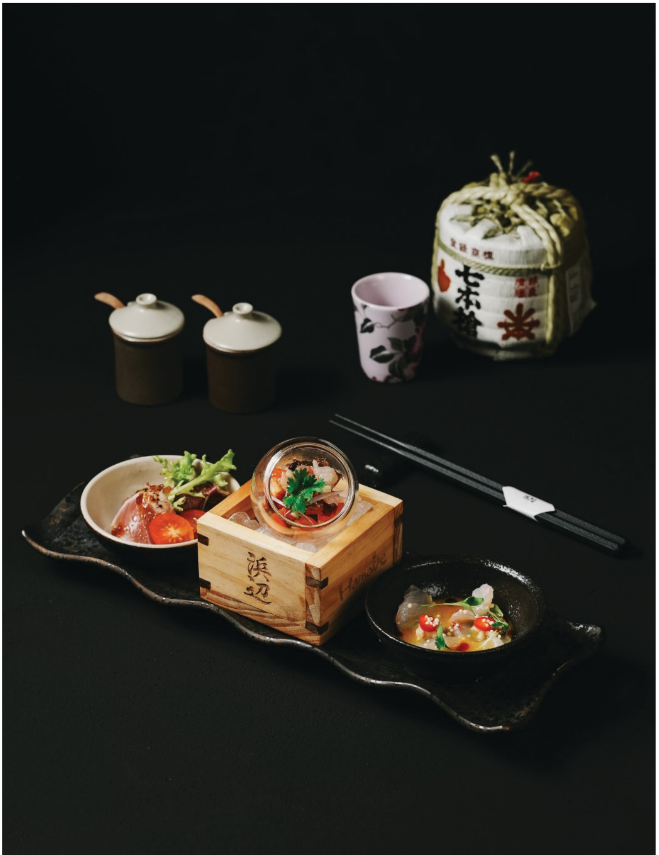
Sashimi 3 Ways