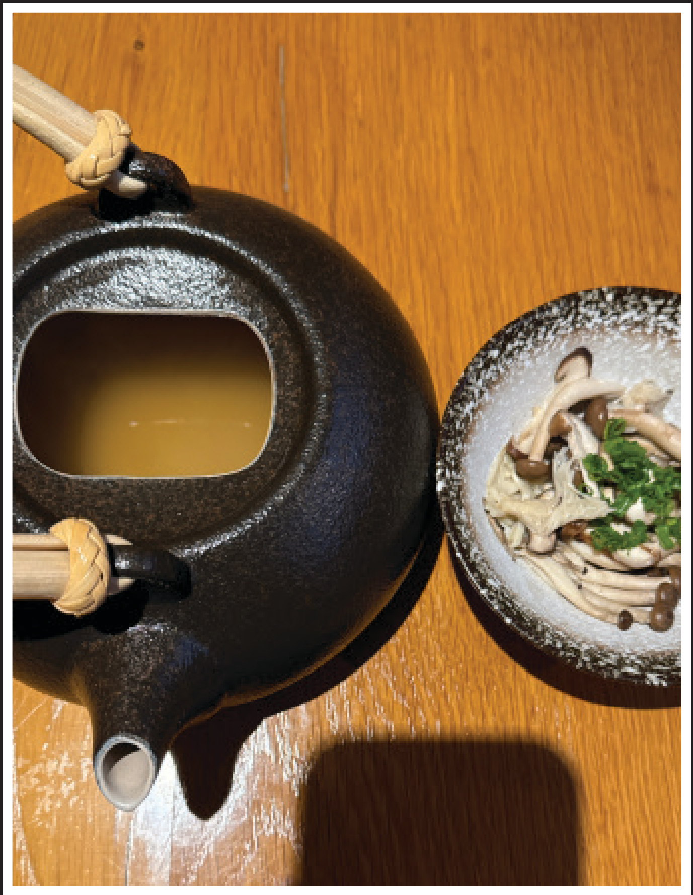
Mushroom Miso Soup