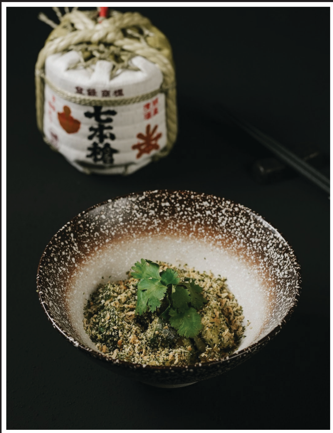
Cucumber Avocado Salad