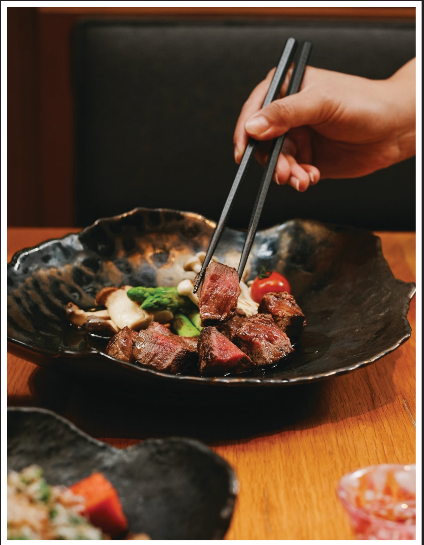
Sher Wagyu Striploin