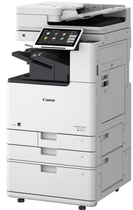
*shown with optional Stapler Finisher