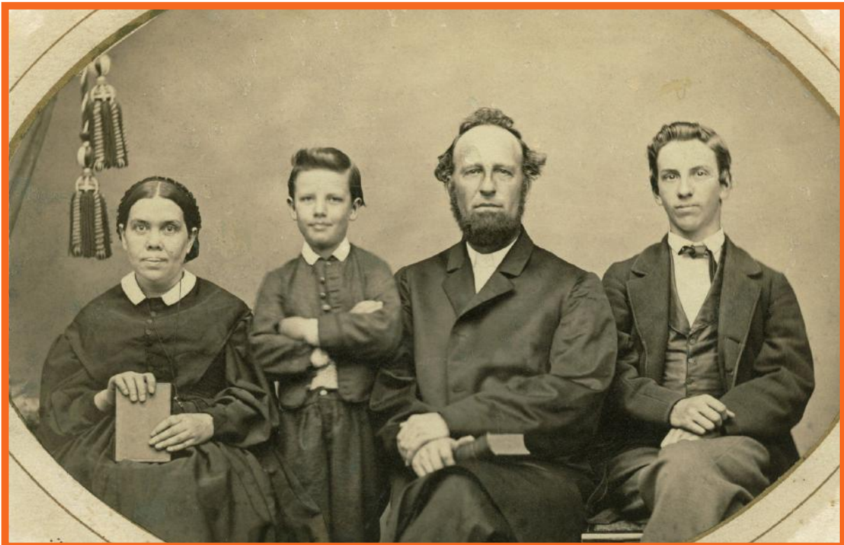
White Family

We encourage everyone to read and enjoy these brief readings in the bulletin and on the bulletin board.