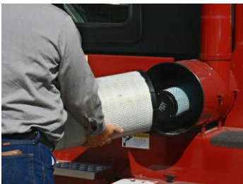
Donaldson Air Cleaner with Safety Element (Standard)