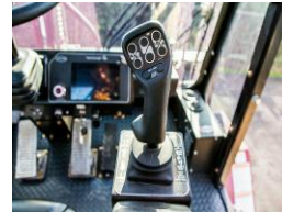
11 Button Command Joystick (Standard)