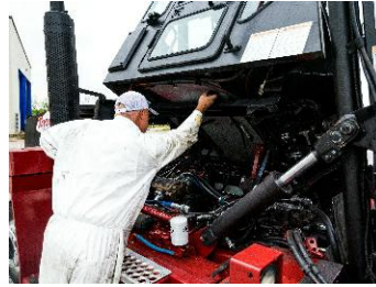
Easy Access to Drive Train & Hydraulics