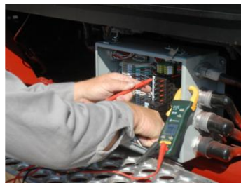
Heavy Duty Circuit Breakers/Reset Switches (Standard)