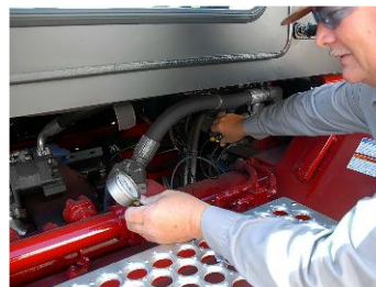
Service & Inspection from Ground Level