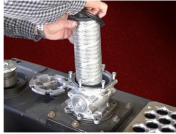
Spin-on Breather, Wire Mesh Strainer & Replaceable Internal Element (Standard)