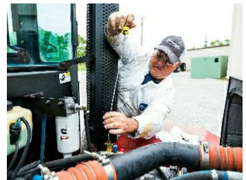
Easily Accessible Daily Checks