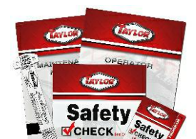
Safety CHECK Vehicle Information Package (Standard)