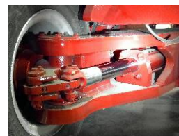
Industry's Toughest Steer Axle (Standard)