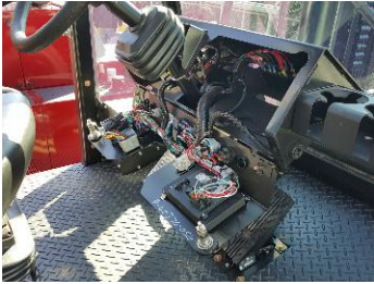
Flip-down Dash with Color/Number Coded Wiring (Standard)

Taylor Lift Trucks are designed with ease of maintenance and serviceability as a key priority. With today's engine and emissions requirements, daily maintenance checks and timely periodic service are the key to your equipment's longevity. All daily checks across the Taylor product line can be accessed from the ground or running board, ensuring that operators can complete these requirements with ease. Also, the sliding hood (on rollers), side service doors and 70 degree tilting cab open to expose the drive train and hydraulics to provide easy access for service and inspection.