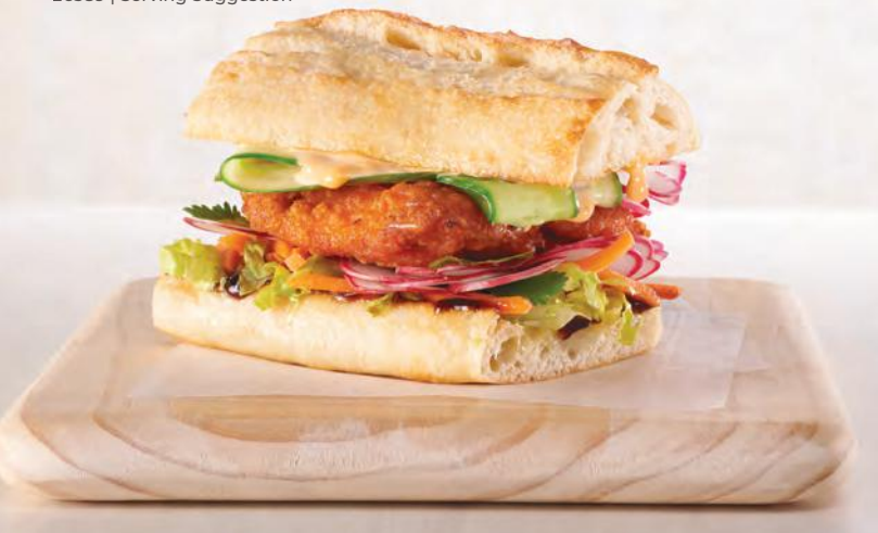
26589 | Serving Suggestion