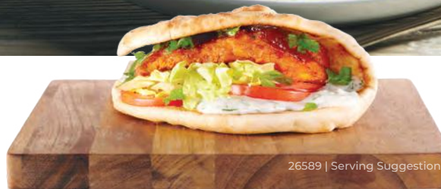
26589 | Serving Suggestion

ARE YOU OFFERING A BREADED CHICKEN SANDWICH ON YOUR MENU YET?