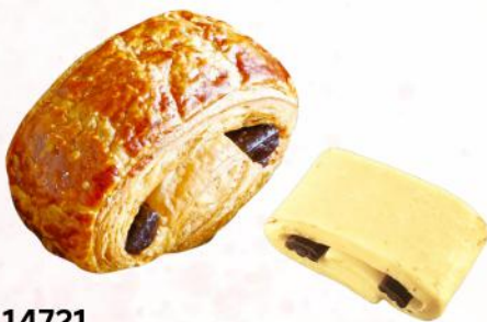
114721 Pain Au Chocolate 30gm 120s