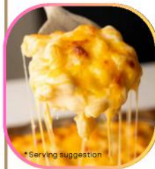
102231 Shredded Tasty/Cheddar Cheese 2kg