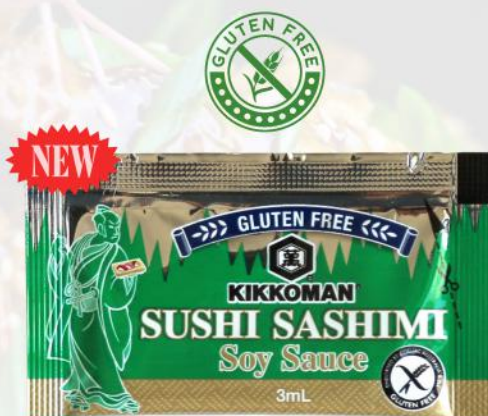
116875 Soy Sauce Sushi GF Pc 100s x 3ml