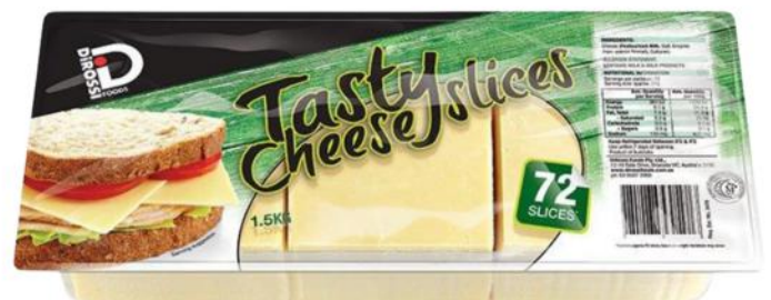
111991 Sliced Tasty Cheese 72s 1.5kg