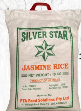
102711 Jasmine Rice 10kg