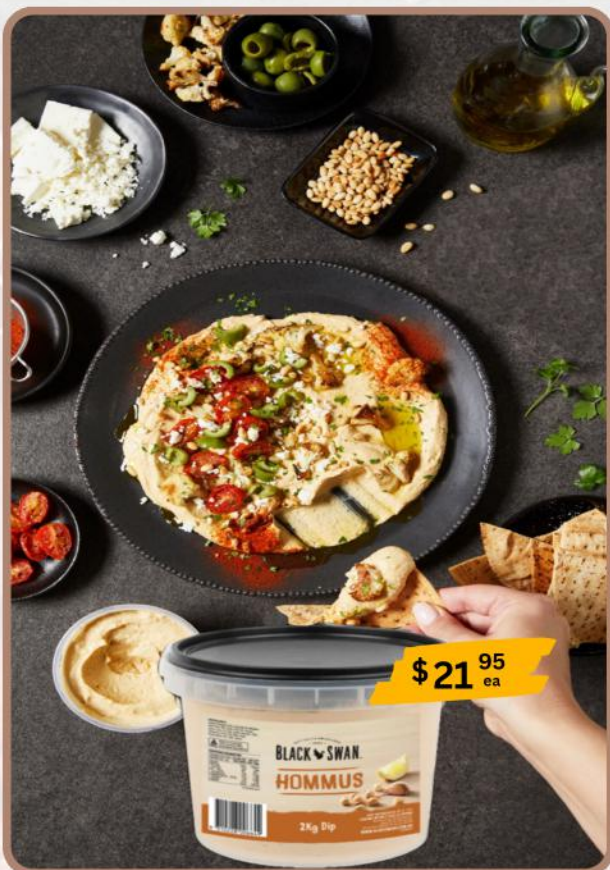
113868 Dip Hommus 2kg