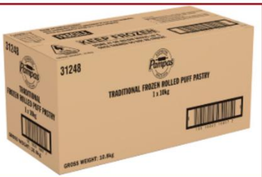
100725 Puff Pastry Roll 10kg