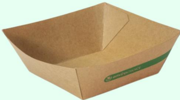
104642 Food Tray #7 Square 95x95x50mm 500s