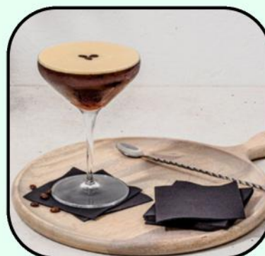
111842 Napkin Cocktail Black 2000s 1/4 Fold