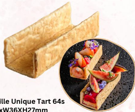
116833 Mille Feuille Unique Tart 64s D95xW36XH27mm