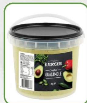
112495 Dip Guacamole 2kg