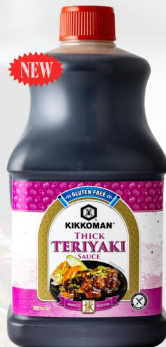
116872 Teriyaki Sauce GF 2.4kg