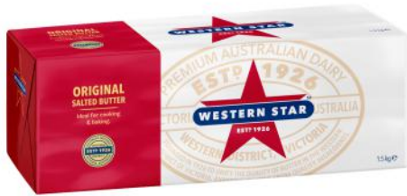
100625 Butter Salted 1.5kg