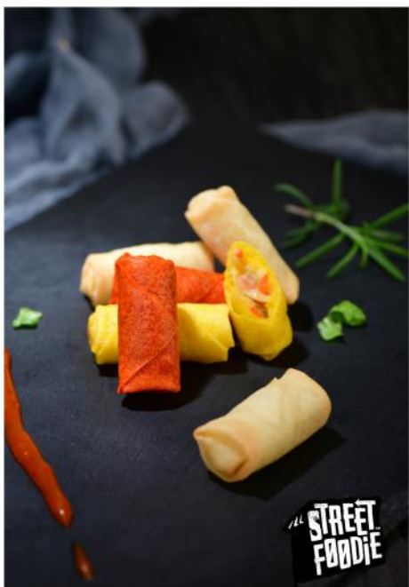
105973 Spring Roll Shots 1kg (Spicy, Thai Lime, Classic)