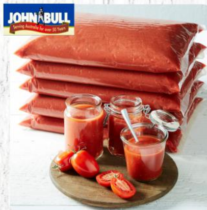
108770 Crushed Tomato Pouch 5x3kg