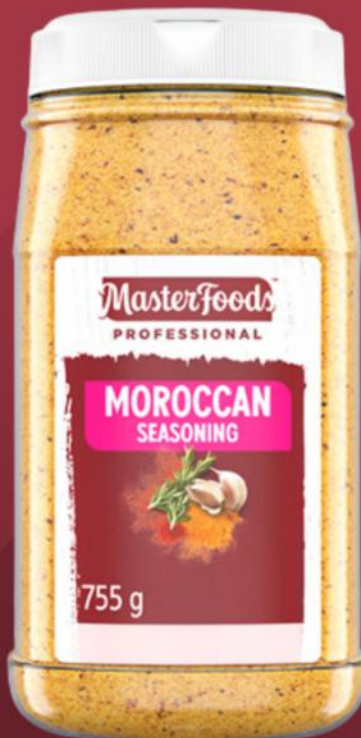
101065 Moroccan Seasoning 755g