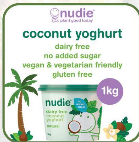
108638 Coconut Yoghurt Natural VF GF 1kg