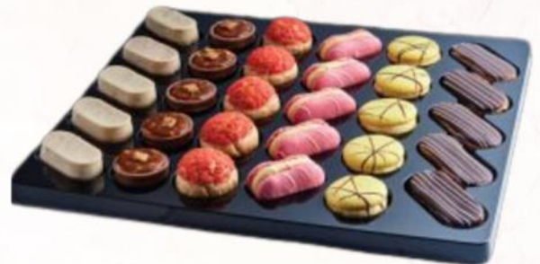
114407 Premium Collection 60s