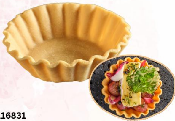
116831 Flower Paper Thin Shell Medium Round 120s H16xD55mm VF