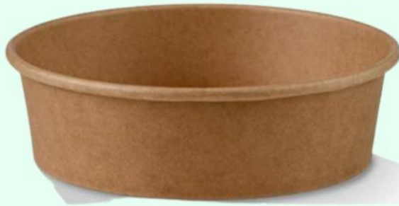
112770 Salad Bowl 16oz Kraft 300s