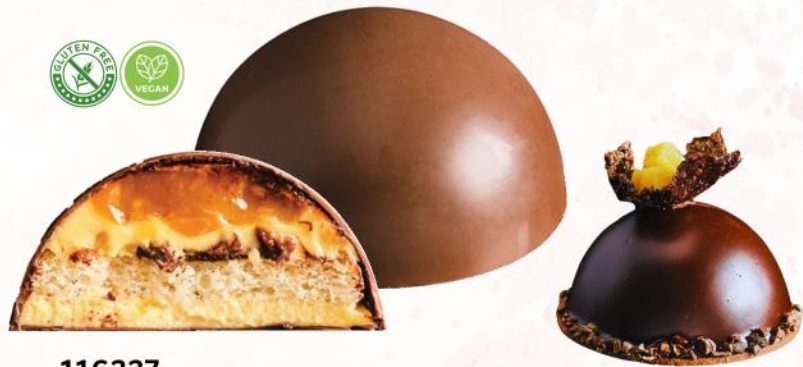
116337 Les Dome Mango Passionfruit Milk Choc H40x80mm 18s