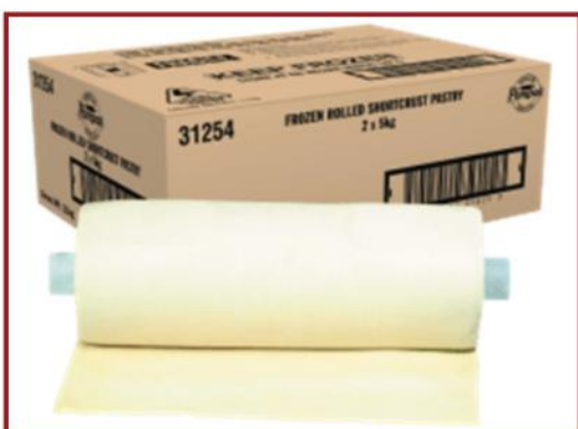
100722 Shortcrust Pastry Roll 2 x 5kg