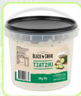
107929 Dip Tzatziki 2kg