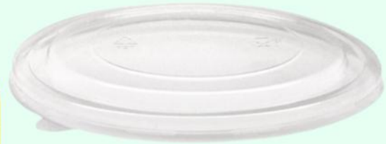
112771 Lid Pet Cold 300s for Salad Bowl Kraft