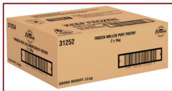
100724 Puff Pastry Roll 2 x 5kg