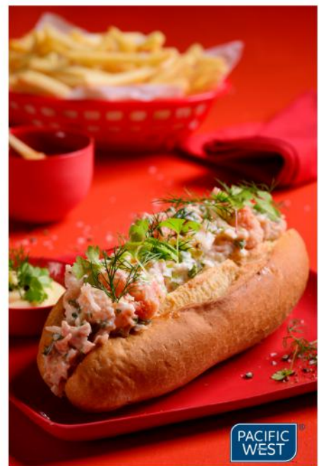
116649 Lobster Sensations 907g