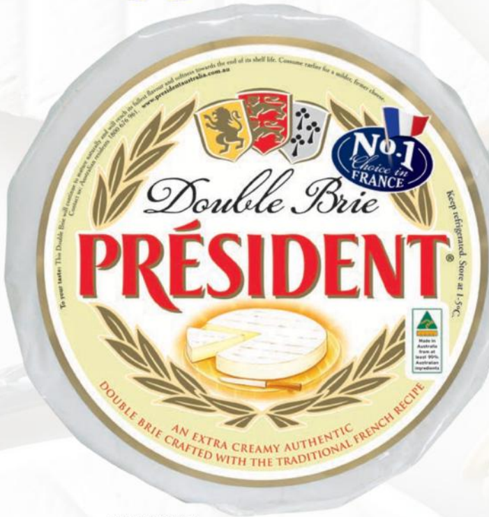
111986 Double Brie Cheese 1kg RW

PRÉSIDENT DOUBLE BRIE AND PRÉSIDENT CAMEMBERT ARE PROUDLY MADE IN AUSTRALIA TO A FRENCH-INSPIRED RECIPE.