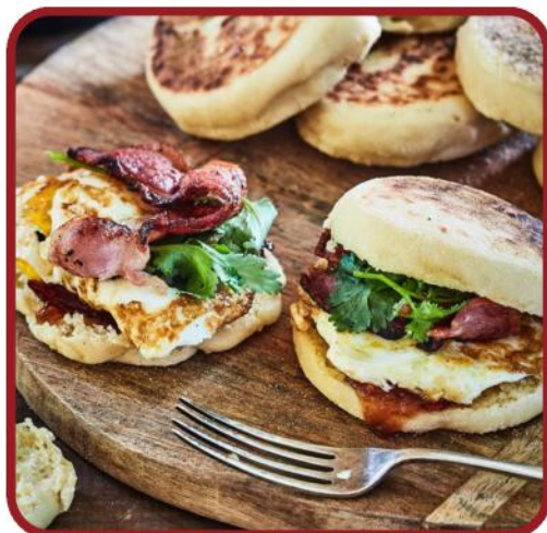
109609 English Muffin 65g x 192