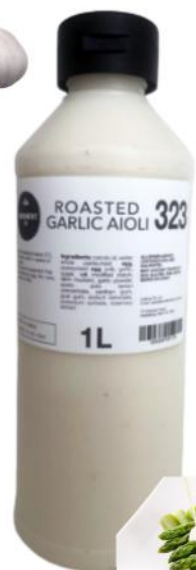
109403 Roasted Garlic Aioli GF DF 1L