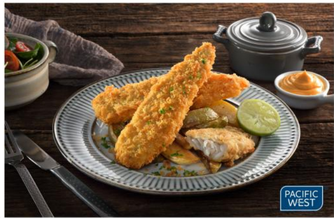
110915 Panko Southern Blue Whiting 66 x 50g 4kg