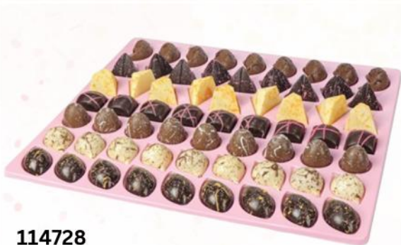
114728 Chocolates Crystal Collection 126s