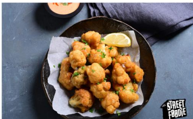
115401 Cauliflower Popcorn 50s 1kg