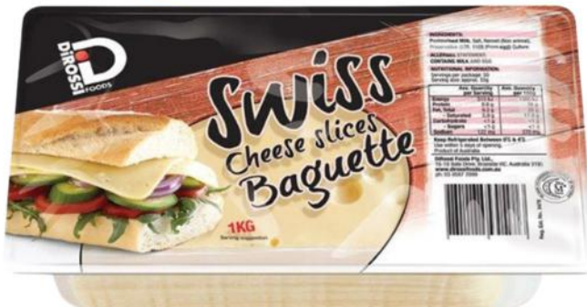
103437 Swiss Cheese Sliced Baguette 1kg