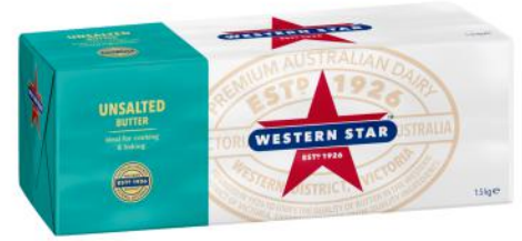
100624 Butter Unsalted 1.5kg