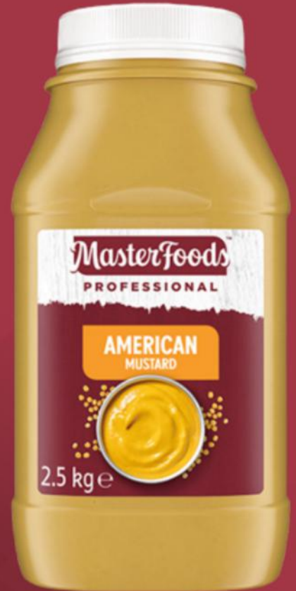
101055 Mustard American 2.5kg