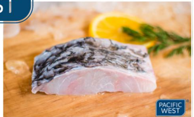
114961 Barramundi Portion Skin On 170-190g - 25s 5kg