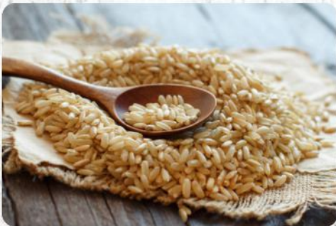
112008 Brown Rice 10kg