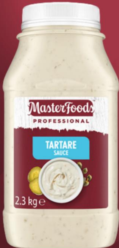
101050 Tartare Sauce 2.3kg