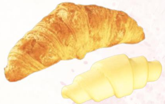
114417 Mini Croissants 30g 260s