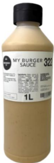
109402 My Burger Sauce GF DF 1L