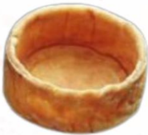
114694 Mille Feuilles Tarts Small H19x44mm 125s