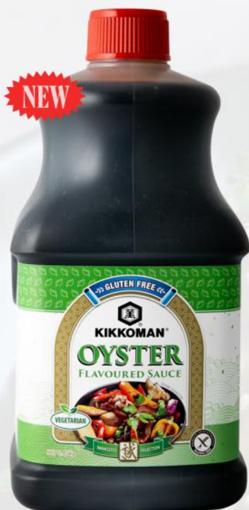
116874 Vegetarian Oyster Sauce GF 2.4kg