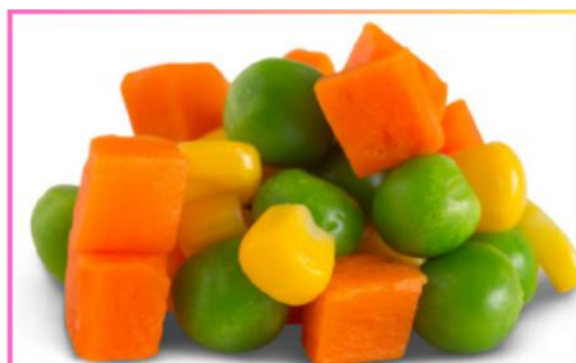
101282 Mixed Vegetable Diced 2kg