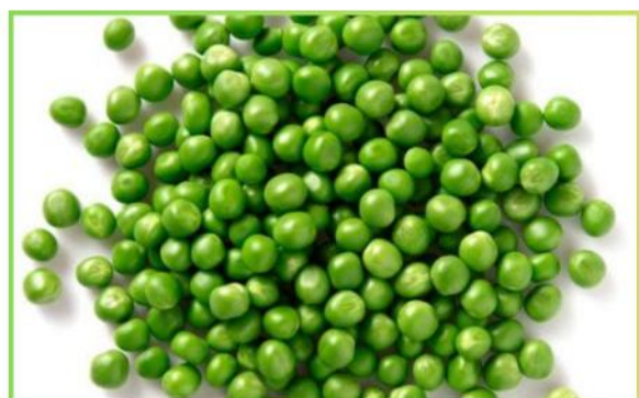
112137 Peas Frozen 2kg