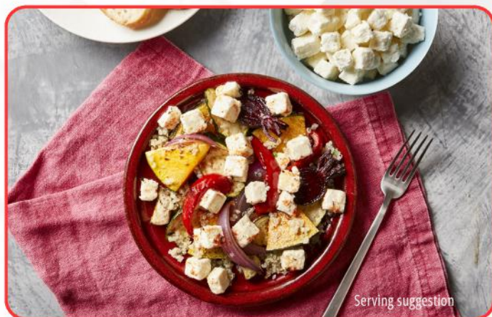
104331 Fetta Cheese Full Cream 2kg