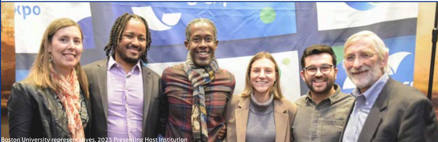
Boston University representatives, 2023 Presenting Host Institution