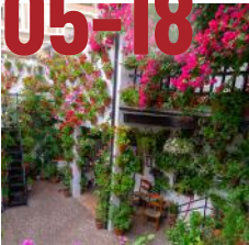
Festivities. Fiesta de los Patios de Córdoba