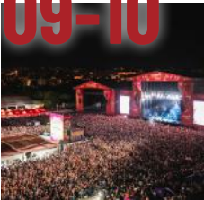
Music. Toledo Beat Festival