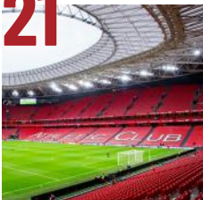
Sports. Europa League final in Bilbao