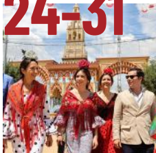
Festivities. Feria de Córdoba