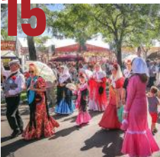
Festivities. Fiestas de San Isidro