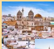
Most A's Cádiz