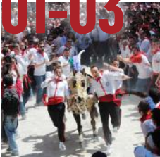
Festivities. Los Caballos del Vino