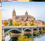
Most B's Salamanca