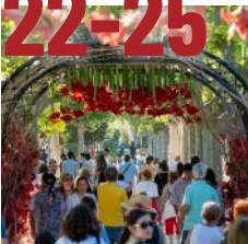
Festivities. Zaragoza Florece