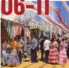
Festivities. Feria de Sevilla