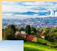
Most C's Oviedo