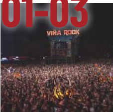
Music. Viña Rock Festival