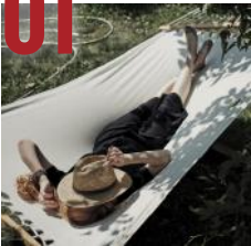
National holiday. Día del Trabajador