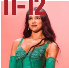
Music. Dua Lipa in Madrid